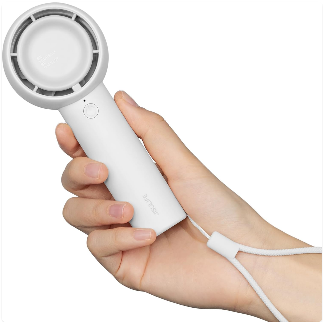
Figure 1: JISULIFE Mini Portable Fan in use.