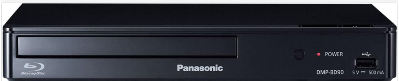
Figure 3.1: Front view of the Blu Ray DVD Player, showing the disc tray, power button, power indicator, and USB port.