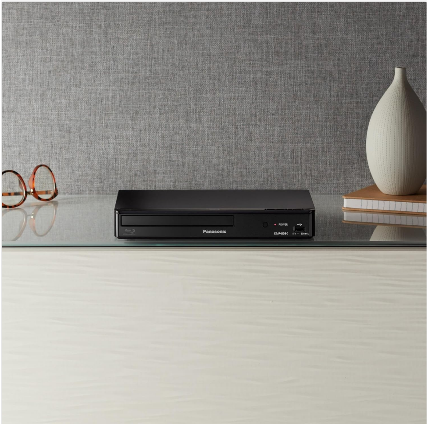
Figure 5.1: Inserting a disc into the player, compatible with CD, DVD, and Blu-ray formats.