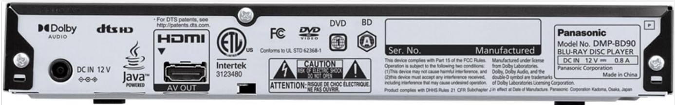
Figure 3.2: Rear view of the Blu Ray DVD Player, showing the DC IN, HDMI OUT, and AV OUT ports.