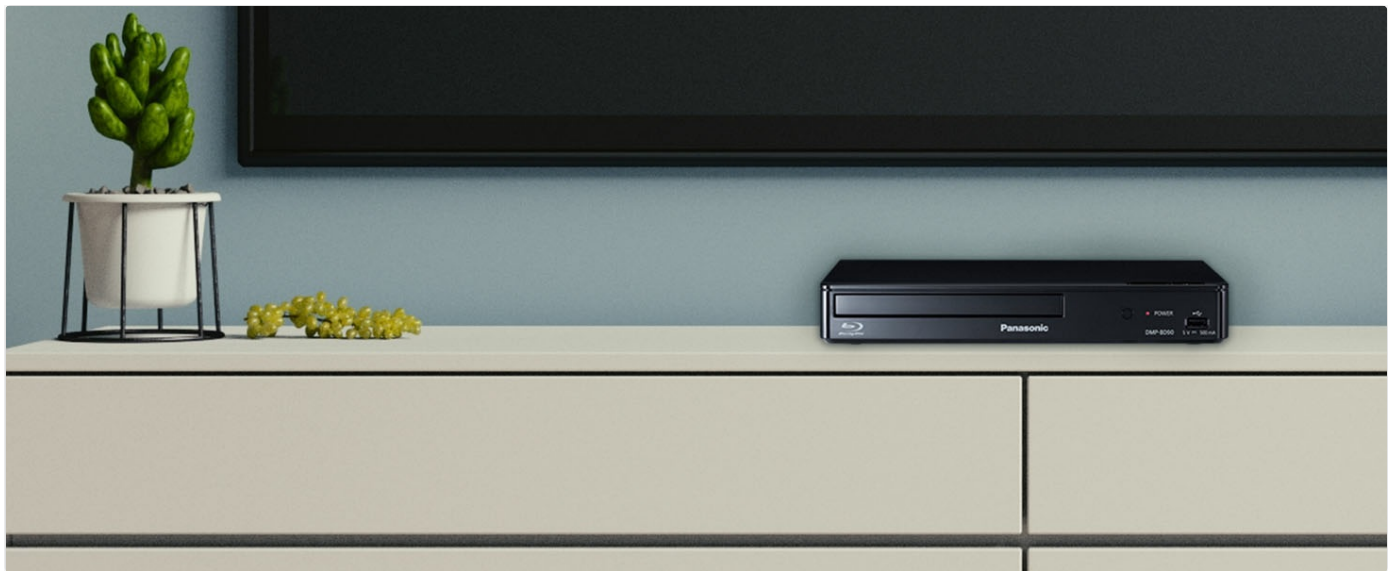
Figure 4.1: The player seamlessly integrated into a home entertainment setup.