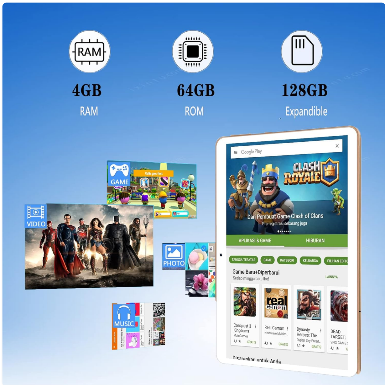
Figure 3.1: Illustration of the tablet's memory specifications: 4GB RAM, 64GB internal storage (ROM), and up to 128GB expandable storage via MicroSD card.