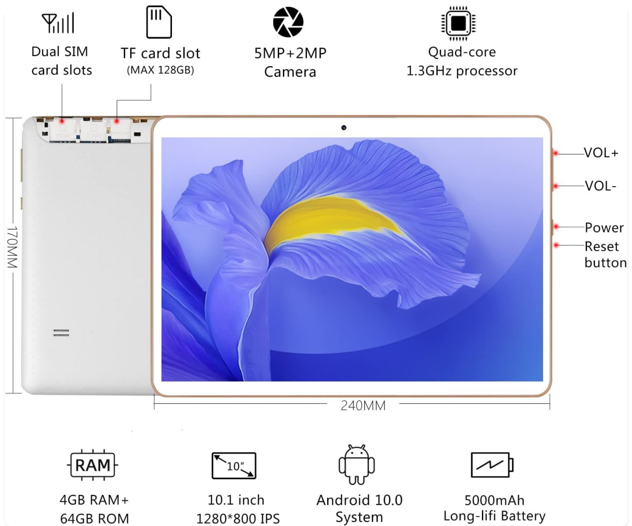
Figure 2.1: Diagram illustrating the physical layout of the YOTOPT Y103-EEA tablet, including the Dual SIM card slots, TF card slot (MicroSD), 5MP rear camera, 2MP front camera, Quad-core 1.3GHz processor, volume up/down buttons, power button, and reset button.

The tablet features a 10.1-inch IPS display with 1280x800 resolution. It is equipped with 4GB RAM and 64GB ROM, powered by a 5000mAh long-life battery, and runs on Android 10 system.