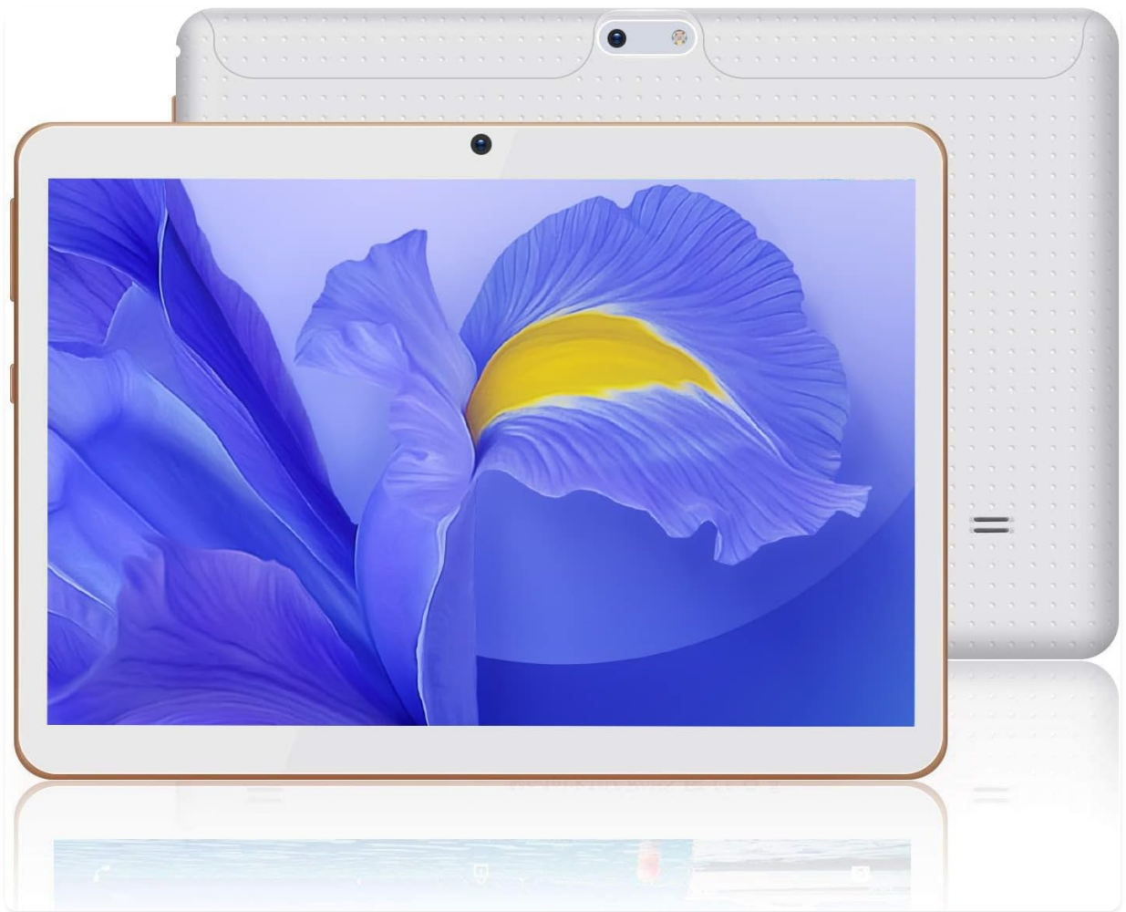
Figure 1.1: Front and back view of the YOTOPT Y103-EEA 10-inch Android Tablet.