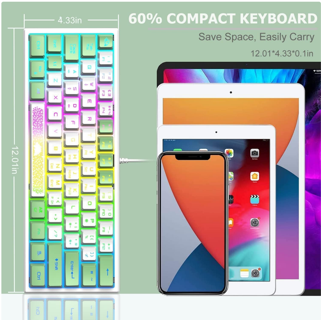
Image: The LexonElec K61 Pro keyboard shown next to a smartphone and tablet, illustrating its compact 60% size and portability.