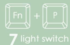
Image: Close-up of the keyboard highlighting the Fn key and associated keys for adjusting RGB brightness, speed, and light modes.