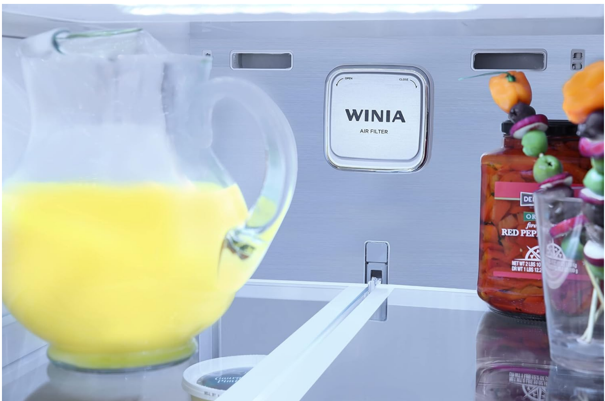
Close-up of the Winia Air Filter located inside the refrigerator compartment.

The NSF-certified water filter system delivers premium filtering for great tasting, high-quality water and ice, as well as peace-of-mind.