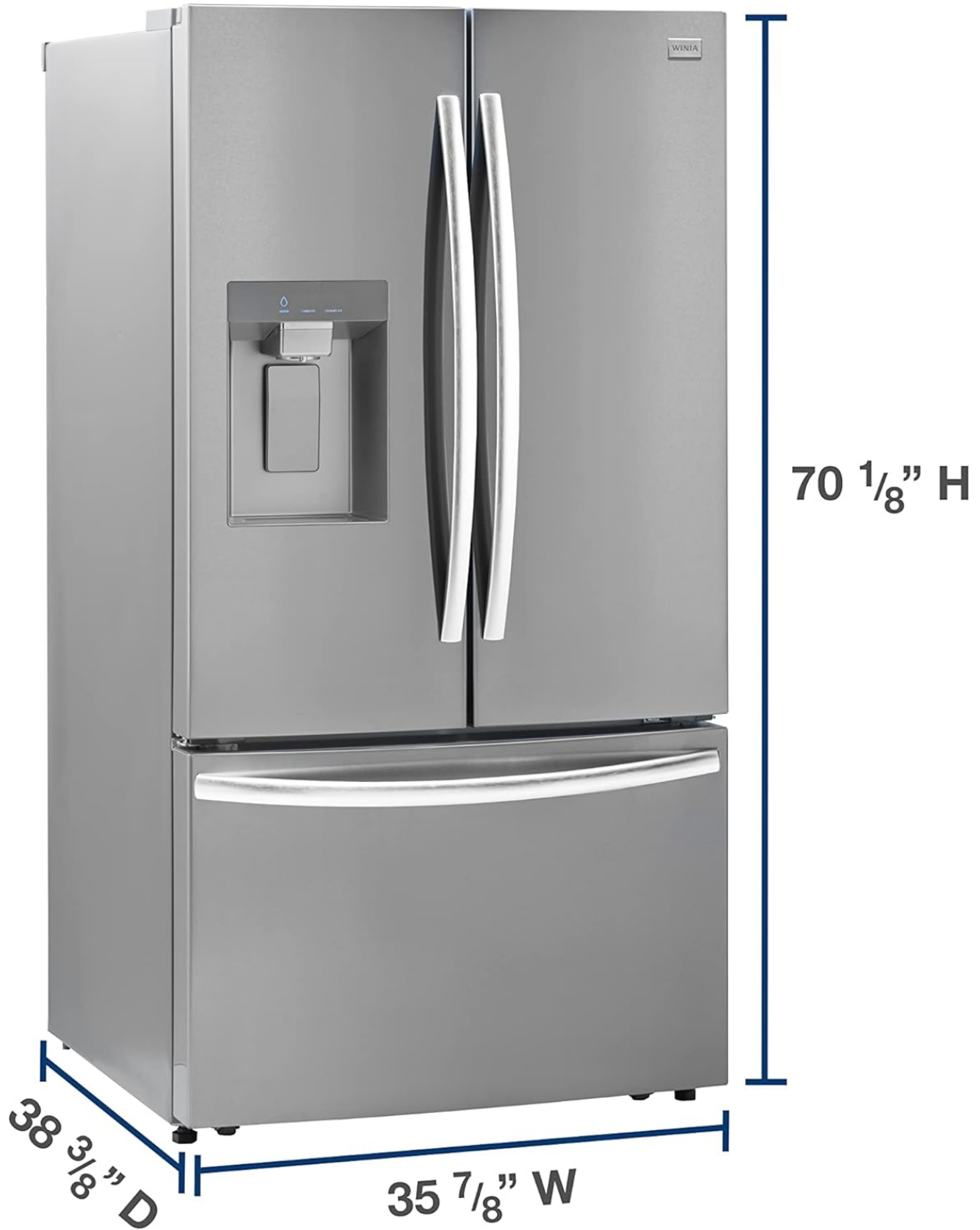
Image showing the exterior of the Winia French Door Refrigerator with its height, width, and depth dimensions clearly marked.