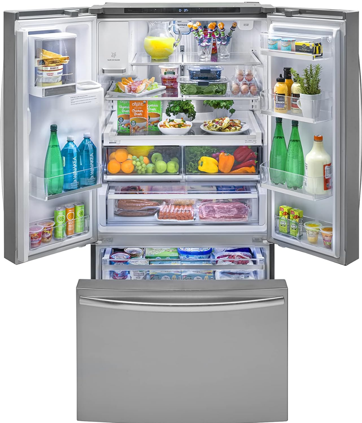
A wide-angle view of the refrigerator's interior, highlighting the extensive storage space across multiple shelves and drawers.