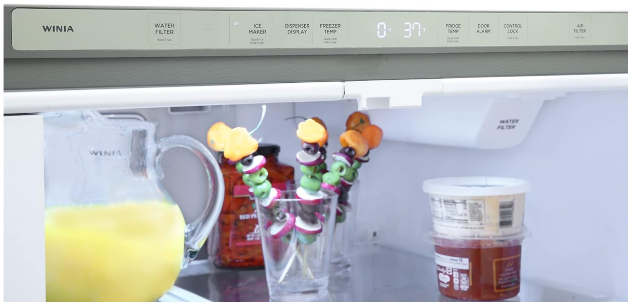
Close-up of the refrigerator's internal control panel, displaying various settings including water filter status, ice maker, freezer temp, refrigerator temp, and door alarm.