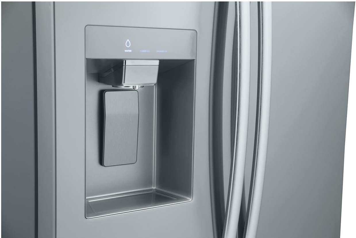
Close-up image of the refrigerator's exterior water and ice dispenser, showing the touch controls for water, cubed ice, and crushed ice.