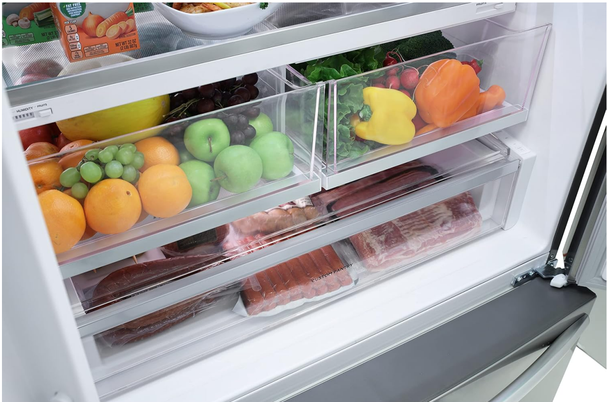
Image showing the interior crisper drawers of the refrigerator, filled with various fruits and vegetables, demonstrating the humidity control feature.

Choose the ideal humidity level for your produce with the humidity-controlled crispers. Set to high for leafy vegetables and low for longer-lasting fruits.