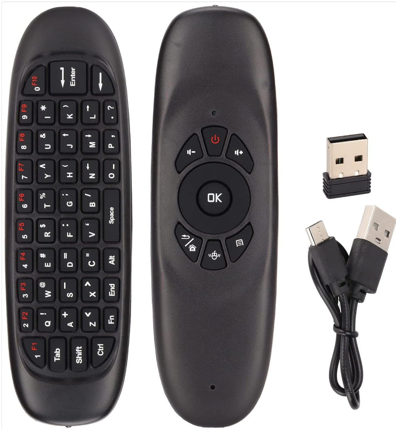
Figure 1: Overview of the Jectse Air Mouse, including the remote control unit, USB receiver, and USB charging cable.