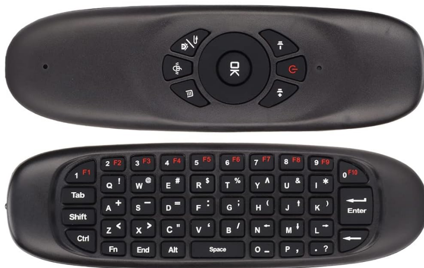
Figure 4: The Jectse Air Mouse held in hand, illustrating its comfortable grip for air mouse control.