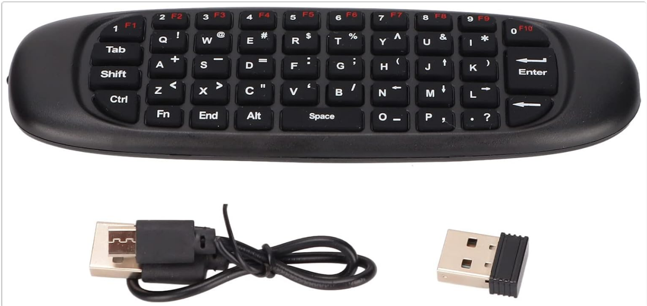
Figure 2: The USB receiver and charging cable. Use the cable to charge the air mouse.

Before first use, ensure the air mouse is fully charged. Connect the provided USB charging cable to the air mouse's charging port and the other end to a standard USB power source (e.g., computer USB port, USB wall adapter). The LED indicator light will show charging status and turn off when fully charged.