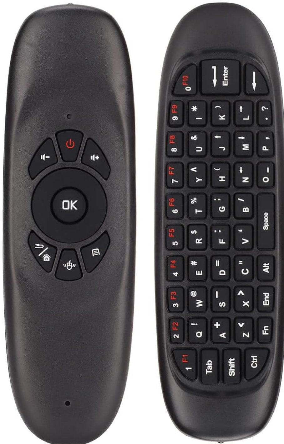
Figure 5: The two sides of the Jectse Air Mouse, highlighting the remote control interface and the full QWERTY keyboard.