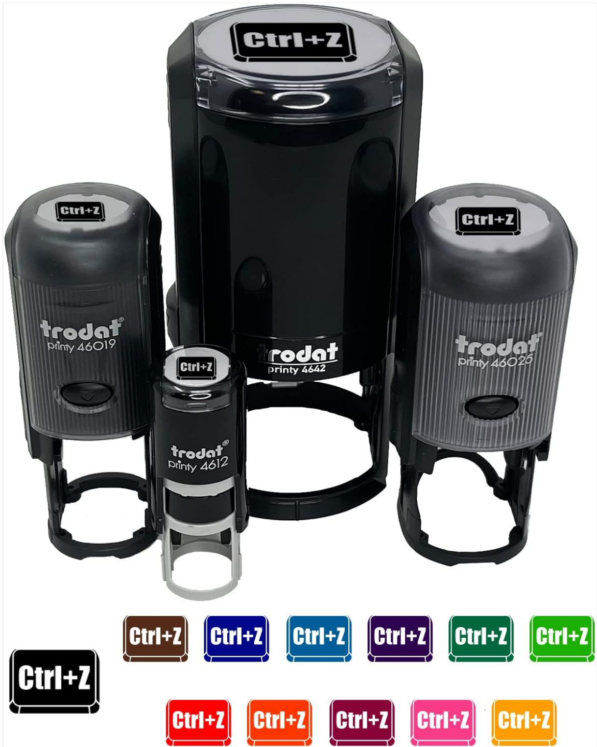
Image: A visual representation of the Sniggle Sloth Ctrl Z self-inking rubber stamps, showcasing different sizes and available ink colors. The main stamp featured is the 1-1/2 inch large black ink model.