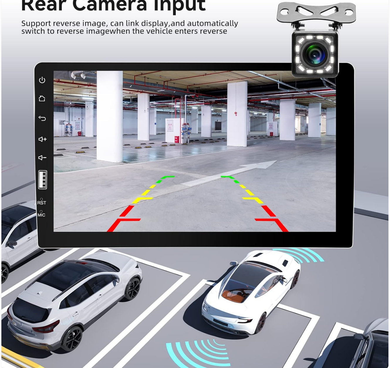
Figure 6.2: Automatic backup camera display.

Support reverse image, can link display, and automatically switch to reverse image when the vehicle enters reverse