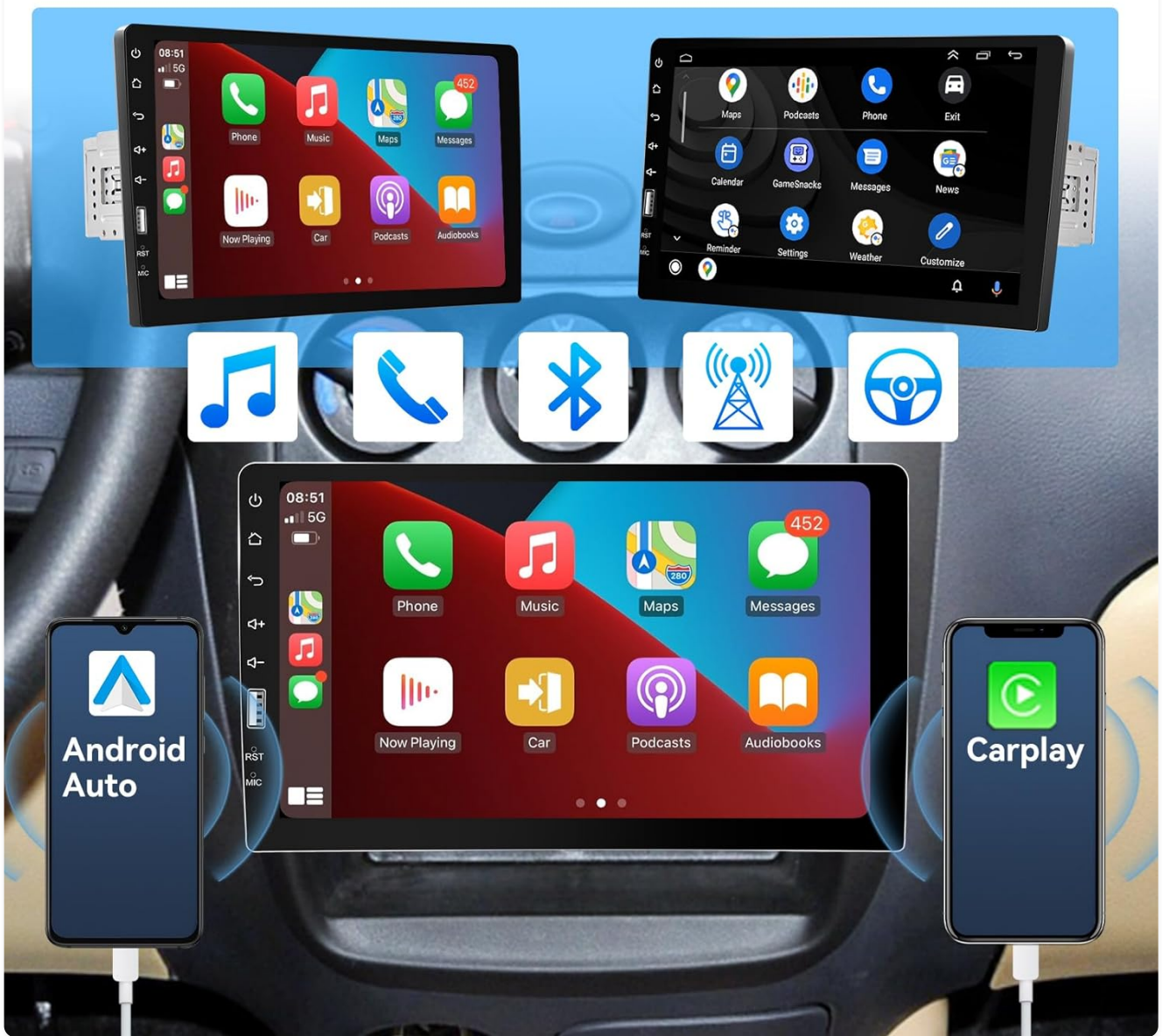
Figure 5.1: CarPlay and Android Auto interfaces. Your browser does not support the video tag.

Video 5.1: Demonstrates the steps for connecting and using CarPlay, Android Auto, and Mirror Link.