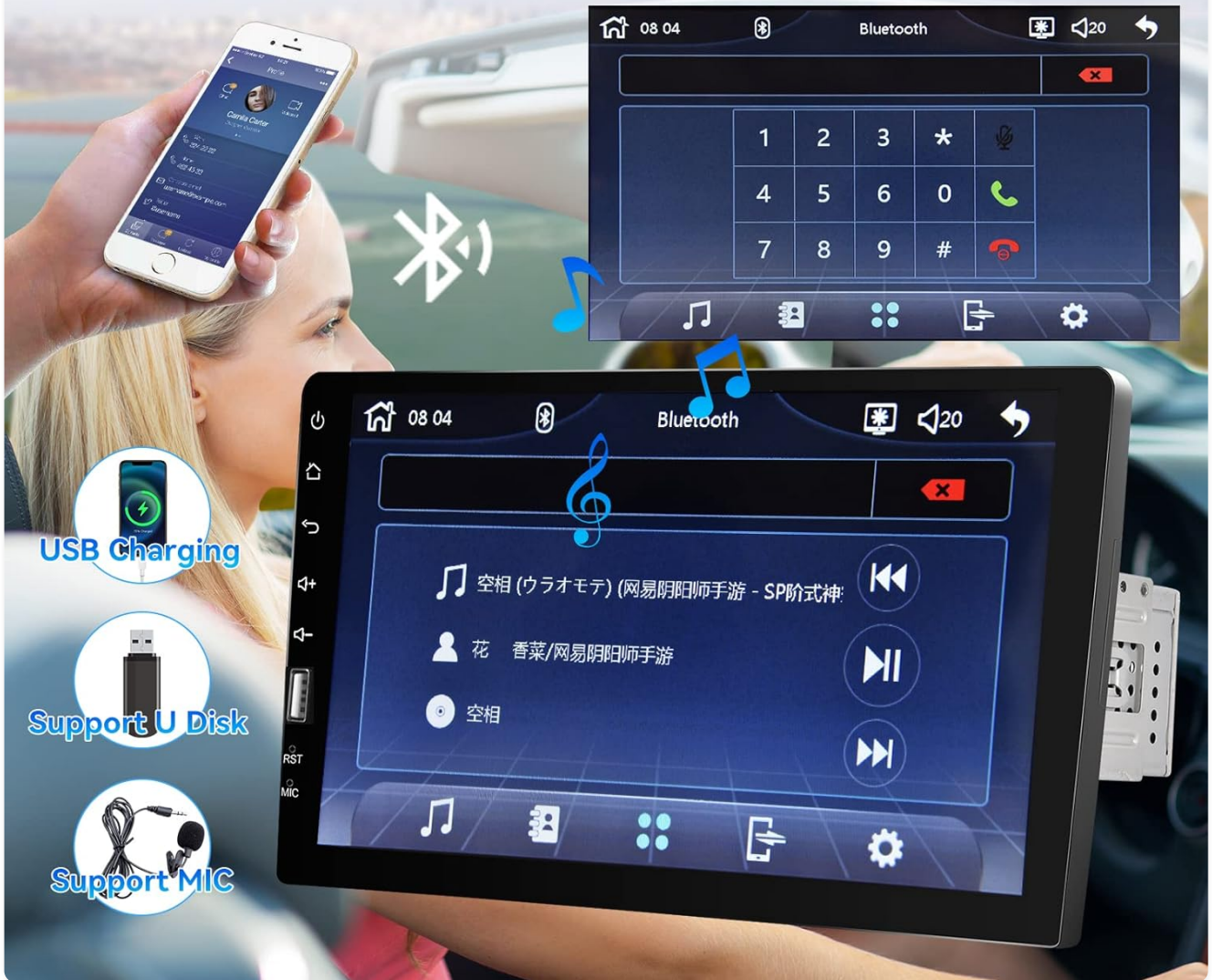
Figure 5.2: Bluetooth connection screen.

Built in BT high-speed transmission chip ,realize BT hands-free call , car mobile phone BT music ,can directly touch the screen to make a callchat at any time , ensure your driving safety