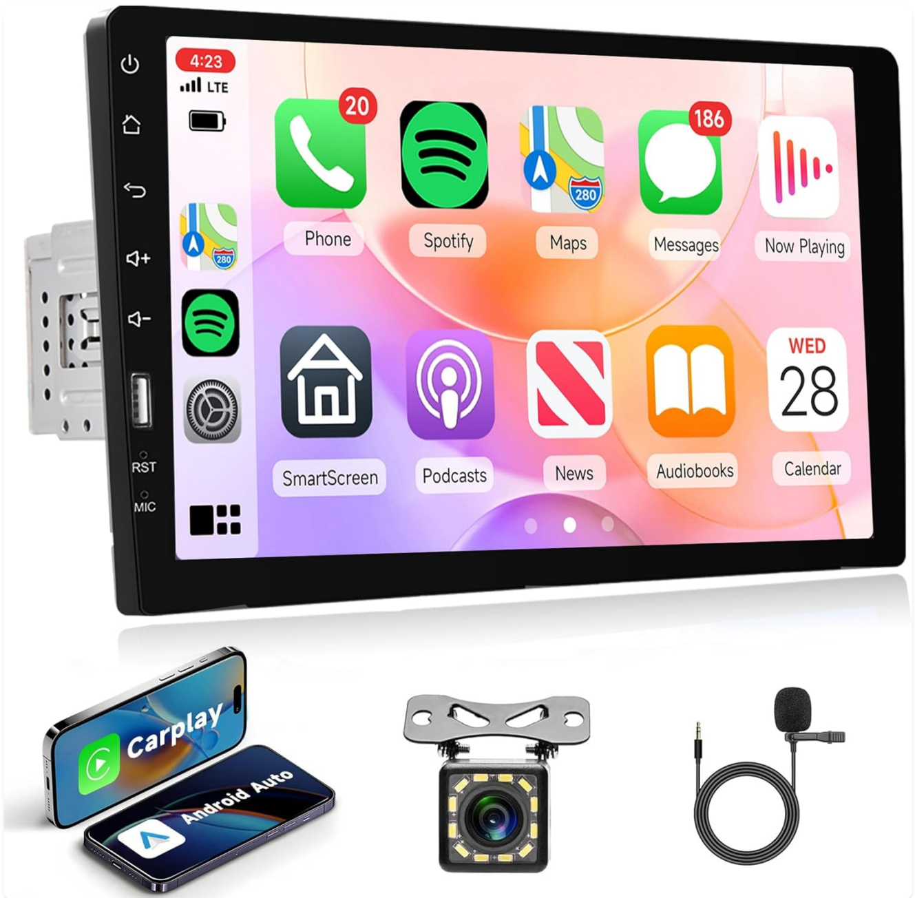
Figure 3.1: Main product unit and included accessories.