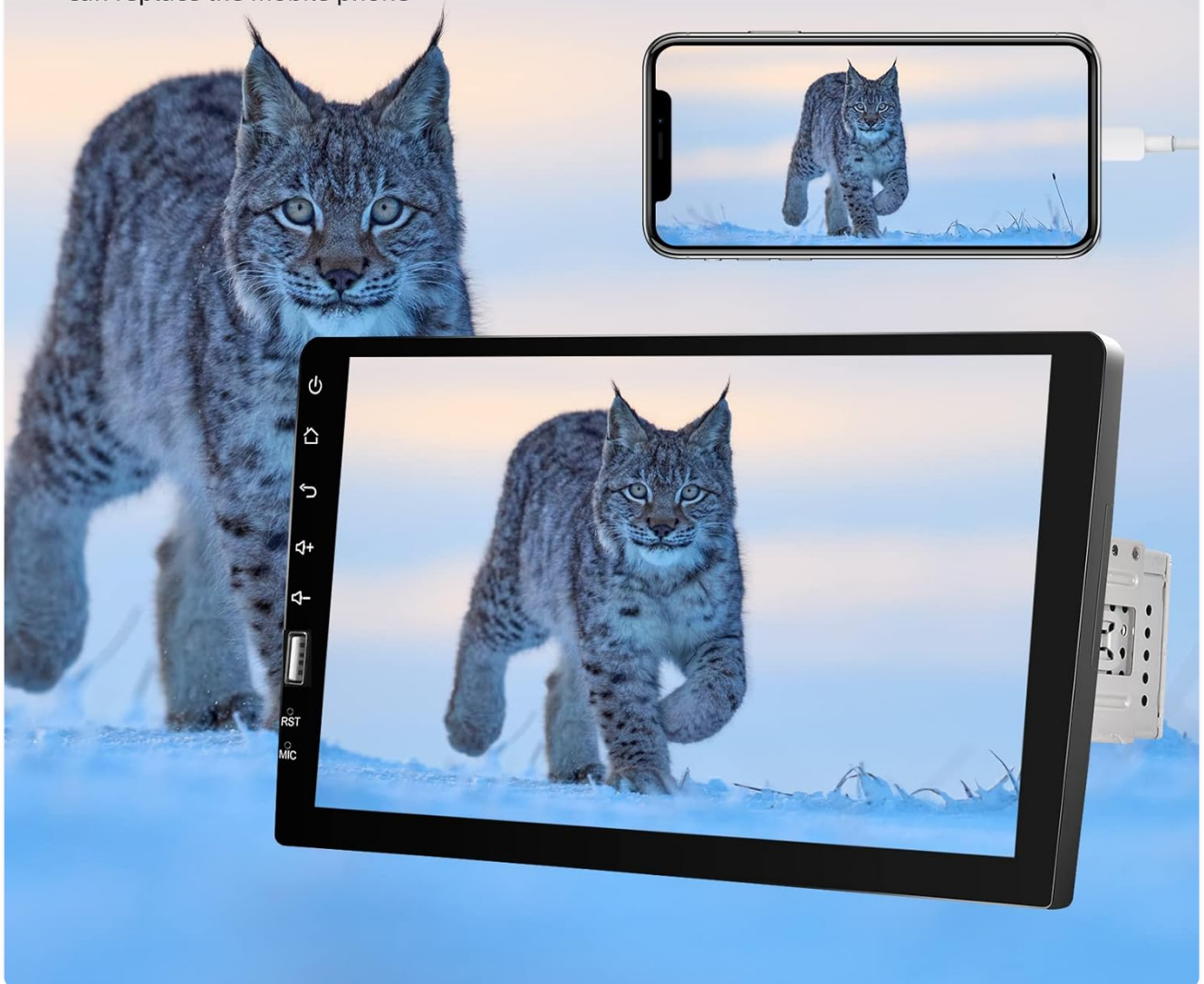
Figure 6.1: Mirror Link in action.

Mobile phone tablet can synchronously display the picture and sound on the mobile phone to the car screen through the data cable connection so that the car screen can replace the mobile phone