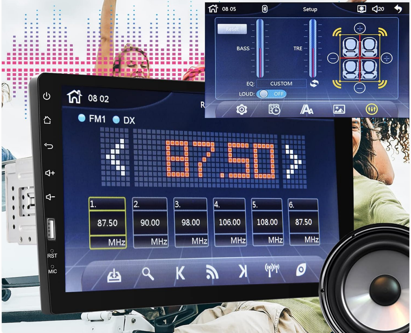
Figure 5.3: FM Radio and EQ settings interface.

Equipped with EQ equalizer , excellent noise reduction , bass enhanced amplification , creating an immersive music feast