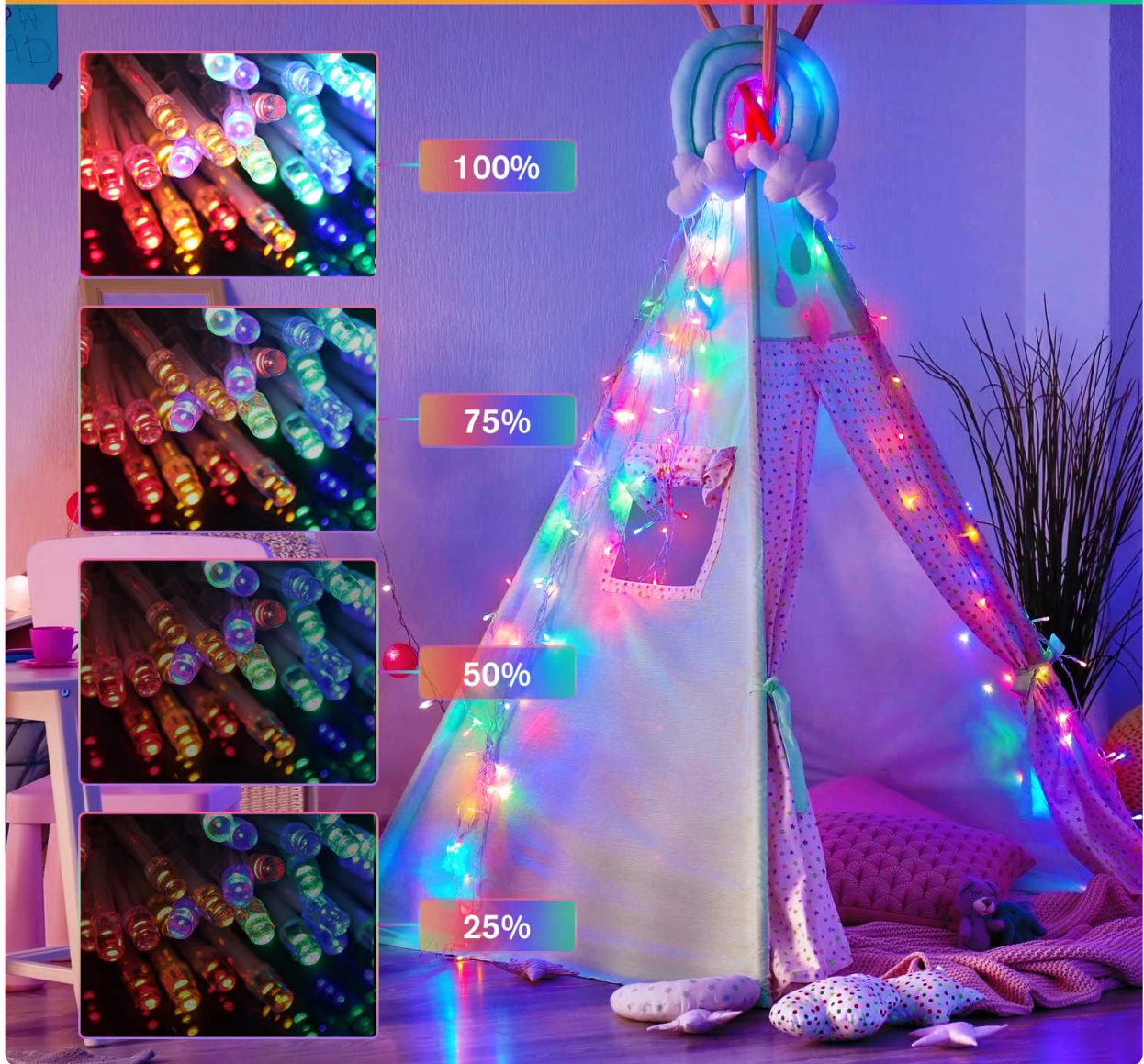
Image: A child's teepee tent decorated with JMEXSUSS string lights, illustrating the 100%, 75%, 50%, and 25% dimmable brightness levels.

Video: Official product video from JMEXSUSS showcasing various lighting modes and colors of the string lights, suitable for Christmas decorations.