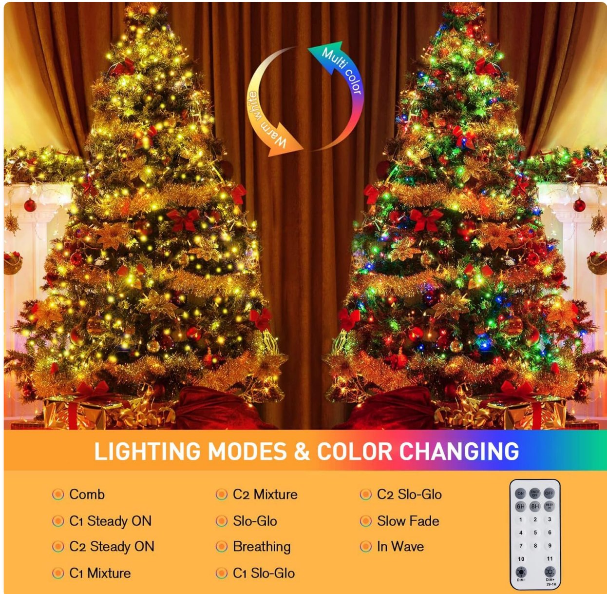
Image: Two Christmas trees illuminated by JMEXSUSS string lights, demonstrating the warm white and multicolor changing modes and a list of 11 lighting options.

Press the button on the UL plug to cycle through the available lighting modes. This button does not control dimming or timer functions.