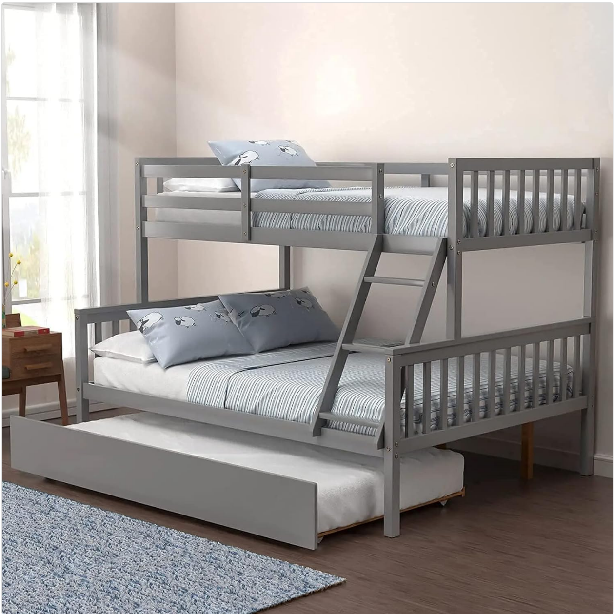
Image 2.1: Tatub Twin Over Full Bunk Bed with Trundle, Grey finish.

Your browser does not support the video tag.