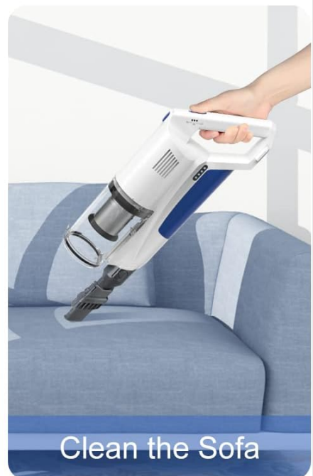
Figure 6: Examples of the vacuum's versatile applications in handheld and extended modes.