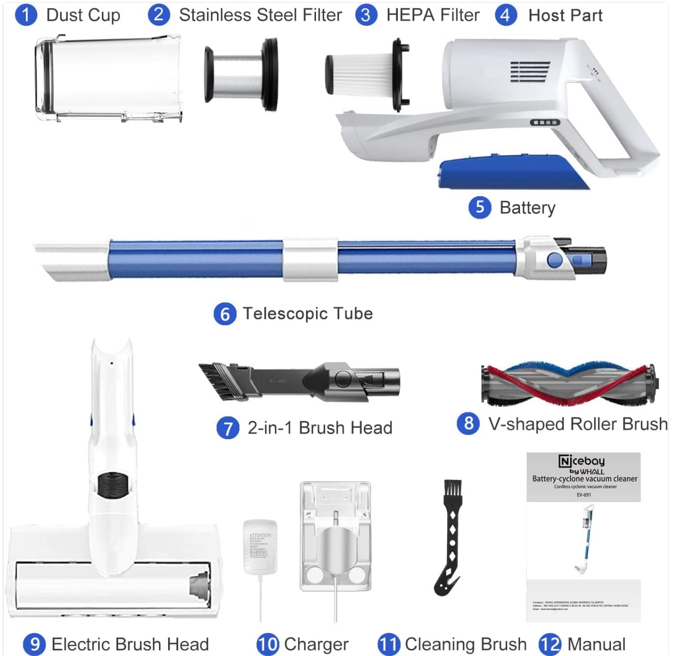
Figure 2: Exploded view of the vacuum cleaner components for identification.