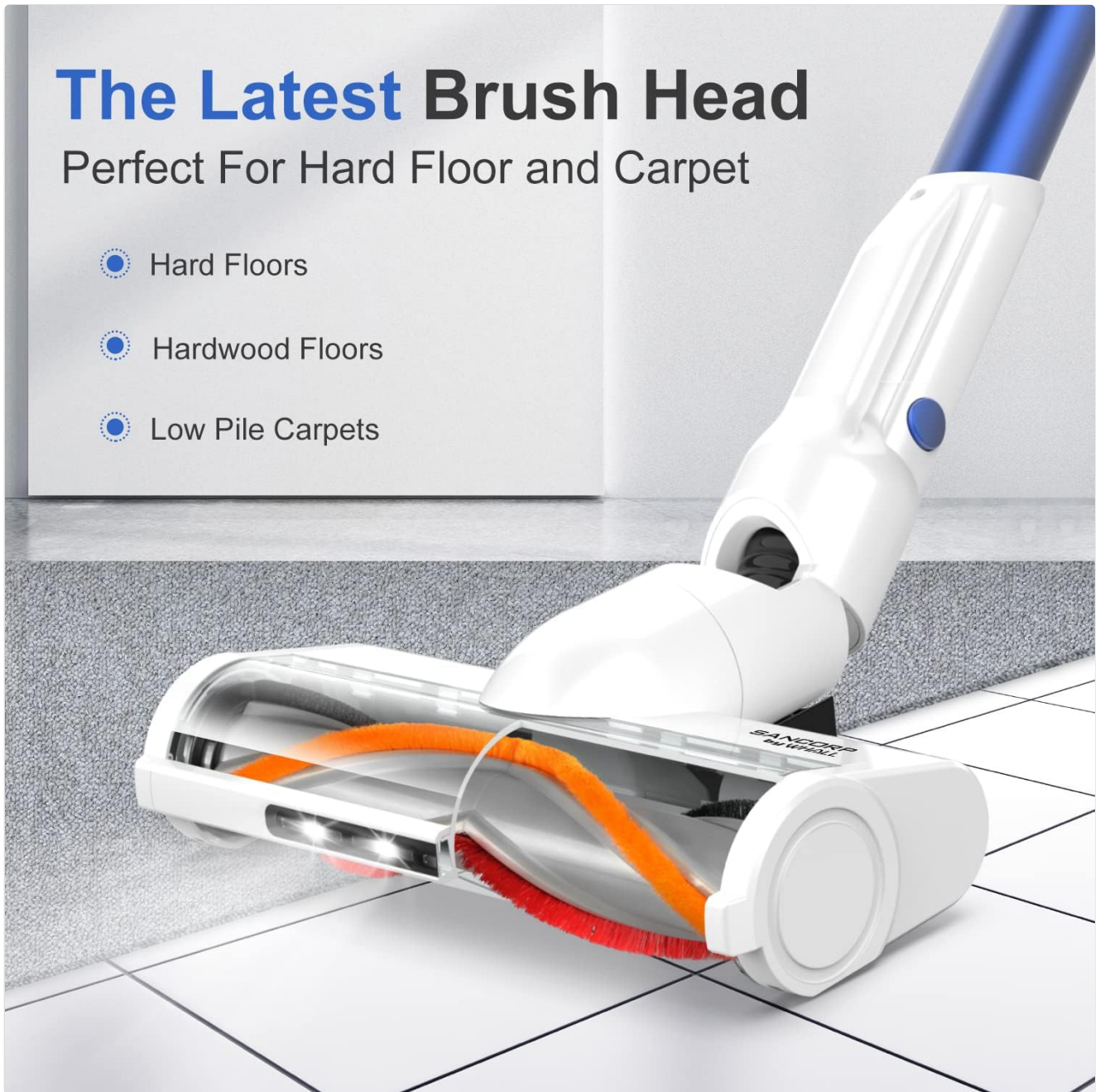
Figure 5: The V-shaped roller brush with integrated LED lighting for enhanced visibility.