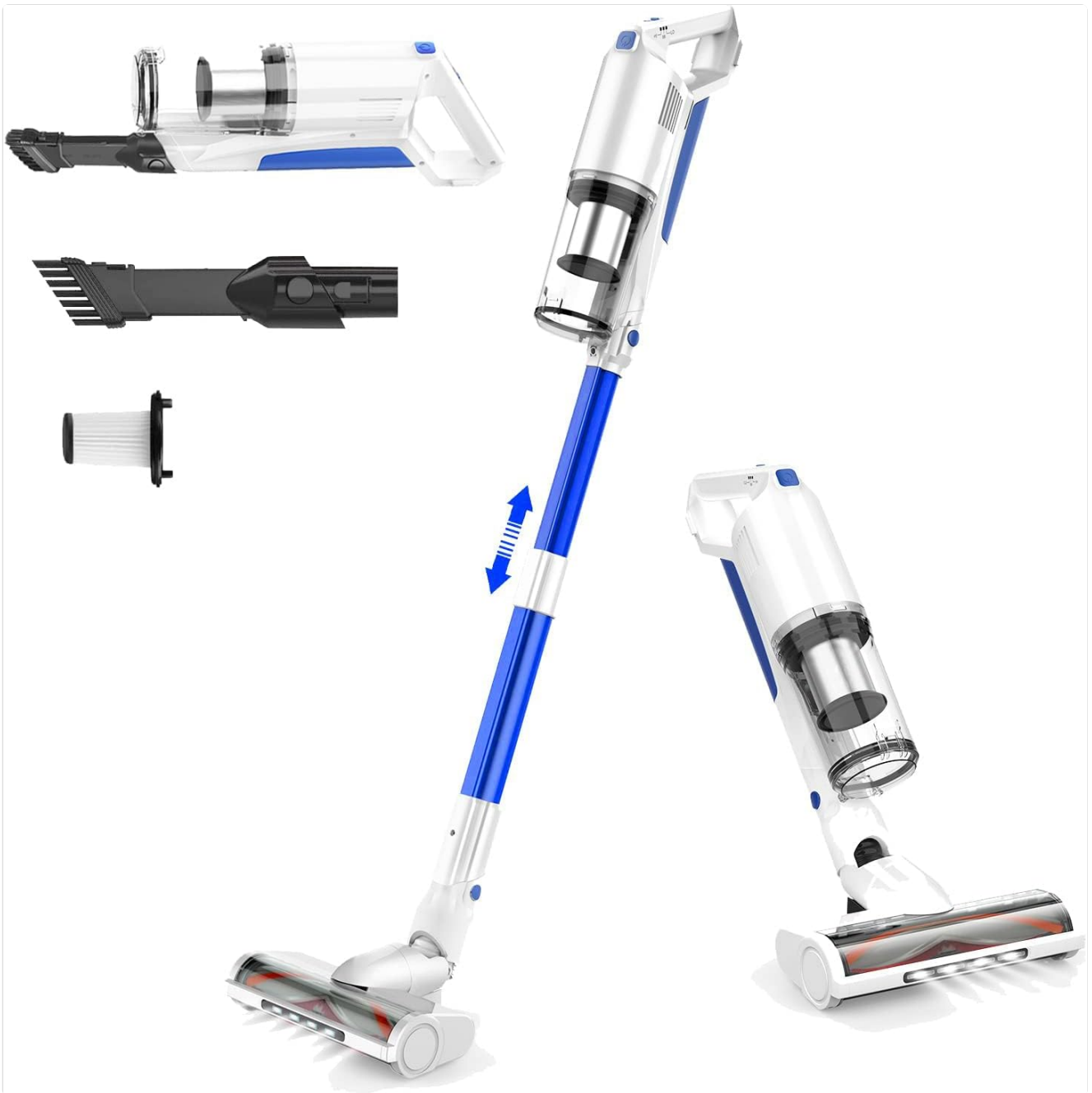
Figure 1: Whall Cordless Vacuum Cleaner with various attachments and configurations.