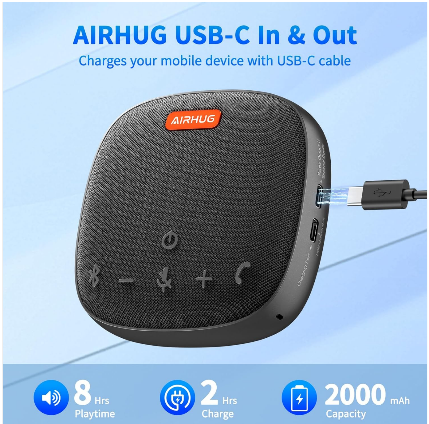
Image: The AIRHUG 01 speakerphone connected via USB-C for charging, illustrating the charging port and the power output port for external devices.

The device offers approximately 8 hours of playtime on a full charge. It also features a "Power Output to External Device" port, allowing you to charge other USB-C compatible devices using the speakerphone's battery.