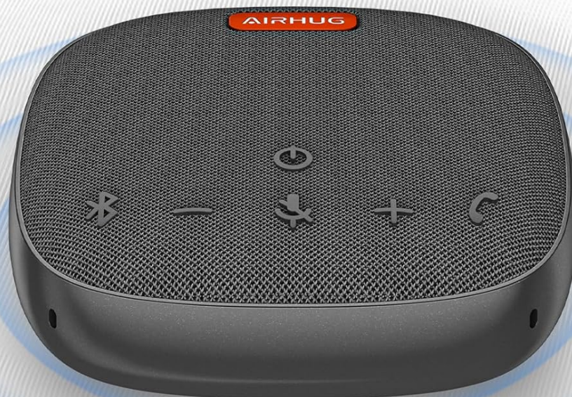
Image: The top view of the AIRHUG 01 speakerphone, highlighting the control buttons and their associated functions like power, Bluetooth, volume, microphone mute, and call answer/end.