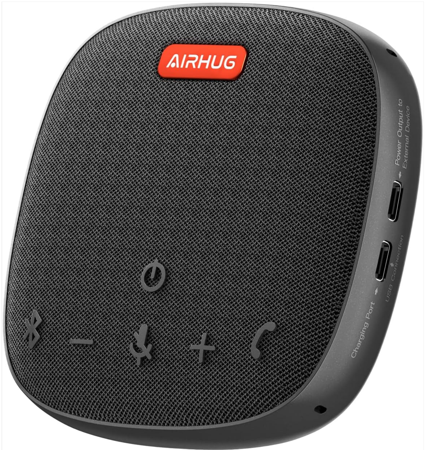
Image: The AIRHUG 01 Conference Speaker and Microphone, showcasing its compact design and control buttons.