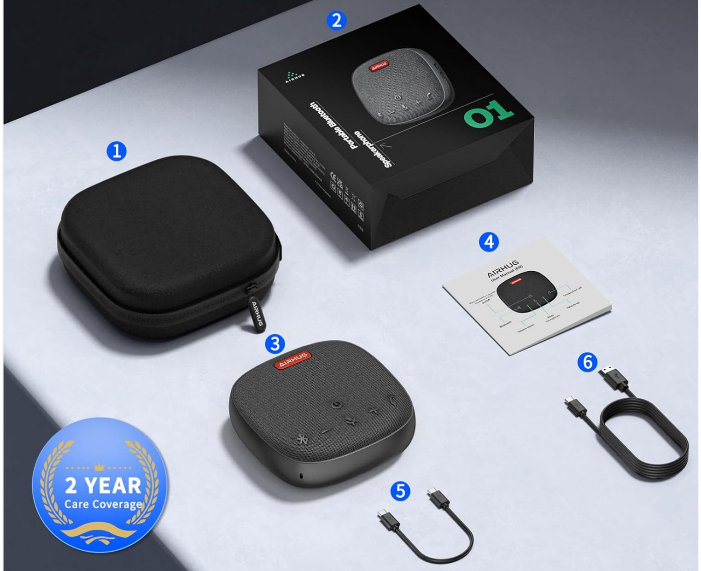
Image: All components included in the AIRHUG 01 package: the speakerphone, two USB cables, user manual, and a travel case.