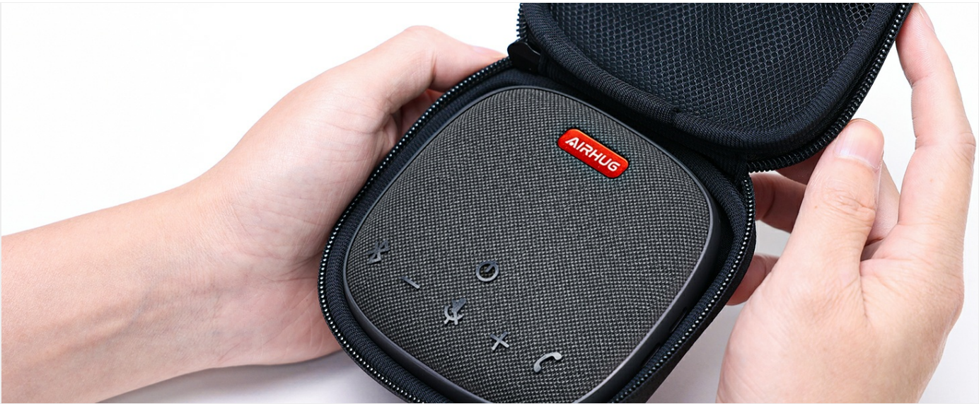
Image: A hand placing the AIRHUG 01 speakerphone into its protective travel case, emphasizing portability and safe storage.