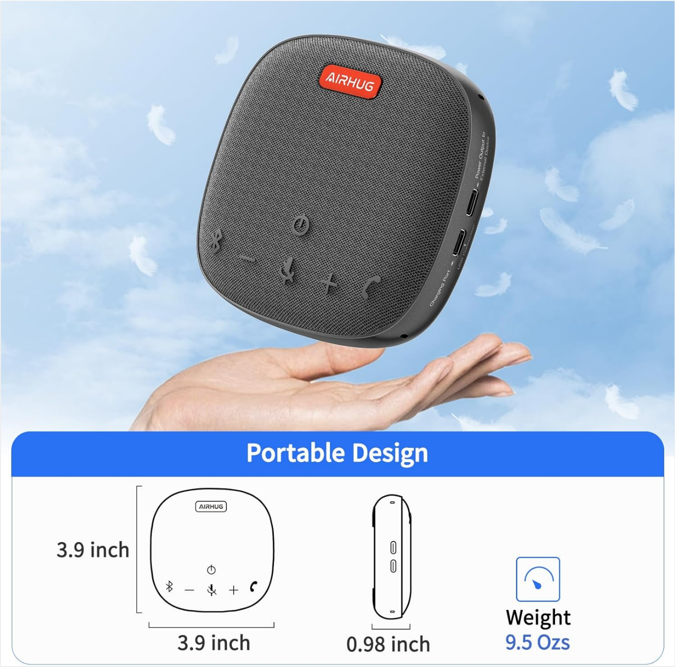
Image: Diagram showing the dimensions (3.9 inches by 3.9 inches by 0.98 inches) and weight (9.5 ounces) of the AIRHUG 01 speakerphone, highlighting its portable design.