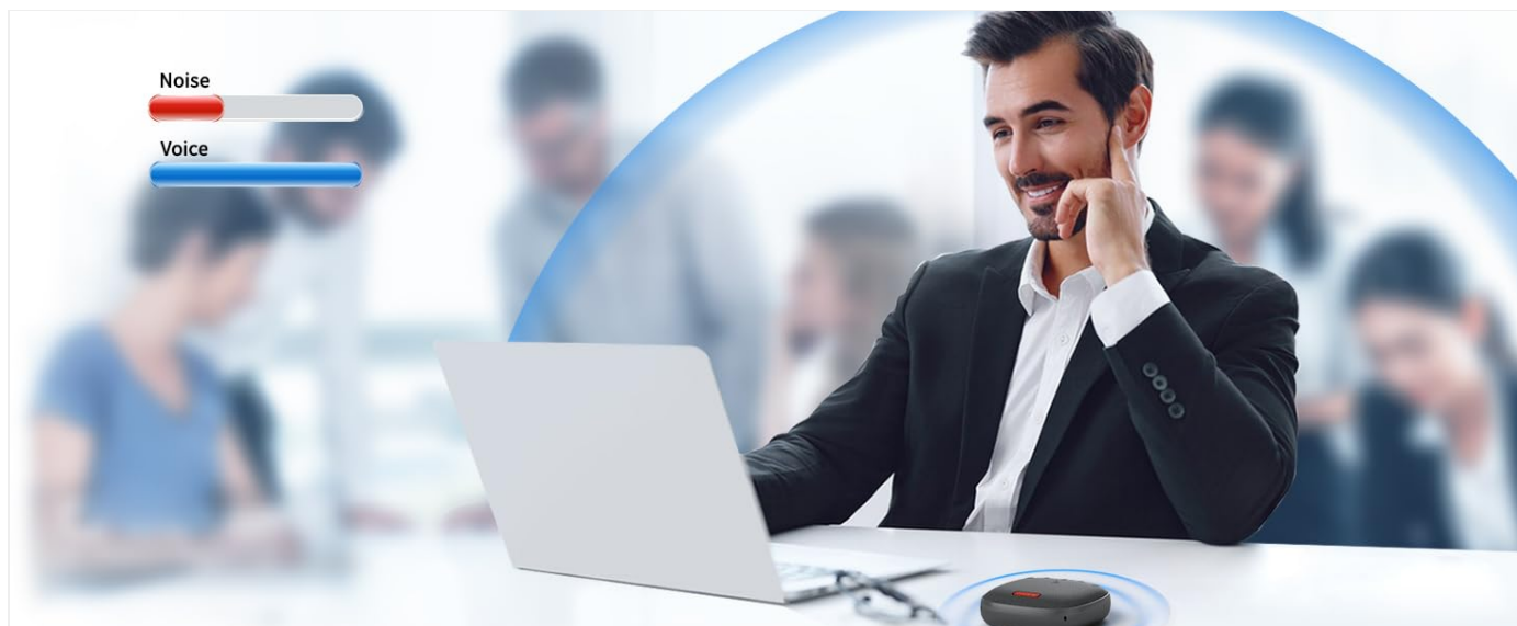
Image: A visual representation of the AIRHUG 01's noise reduction technology, distinguishing between unwanted noise and clear voice signals.