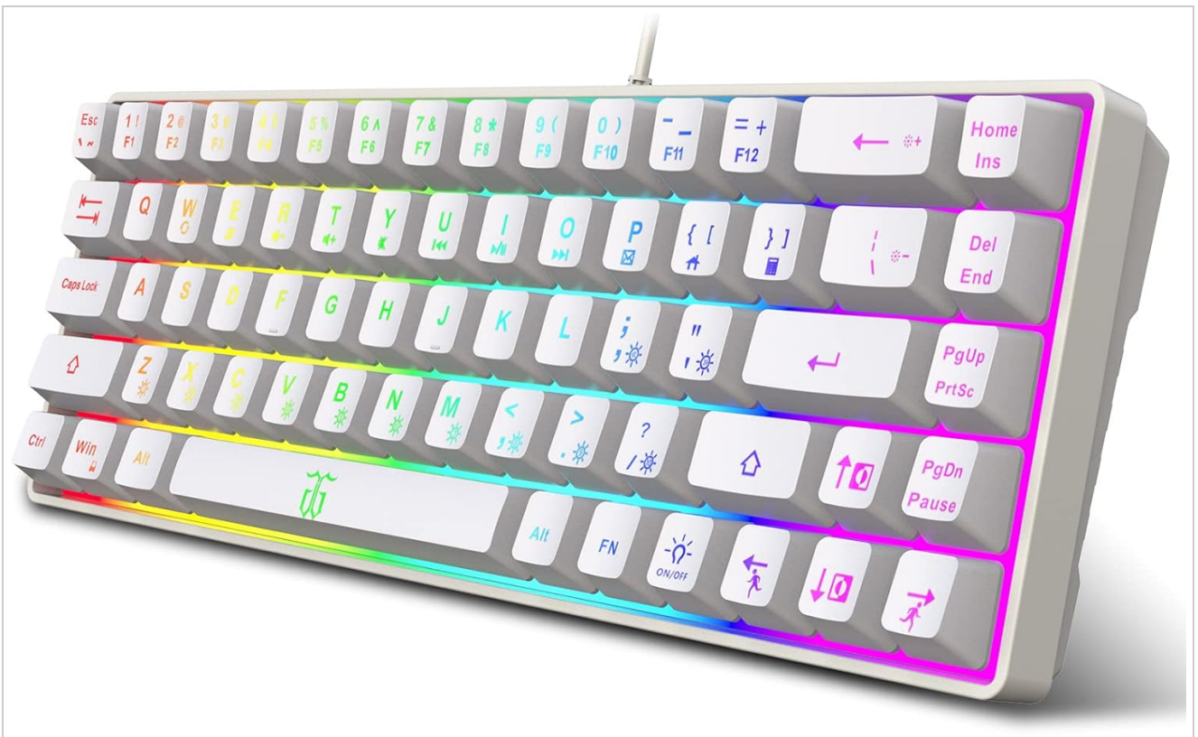
Image 1.1: The Snpurdiri K68 60% Gaming Keyboard in white, showcasing its compact layout and vibrant RGB backlighting.

Thank you for choosing the Snpurdiri K68 60% Gaming Keyboard. This compact, RGB-backlit keyboard is designed for gaming and general use, offering a balance of functionality and space-saving design. This manual provides detailed instructions for setup, operation, maintenance, and troubleshooting to ensure optimal performance and user experience.