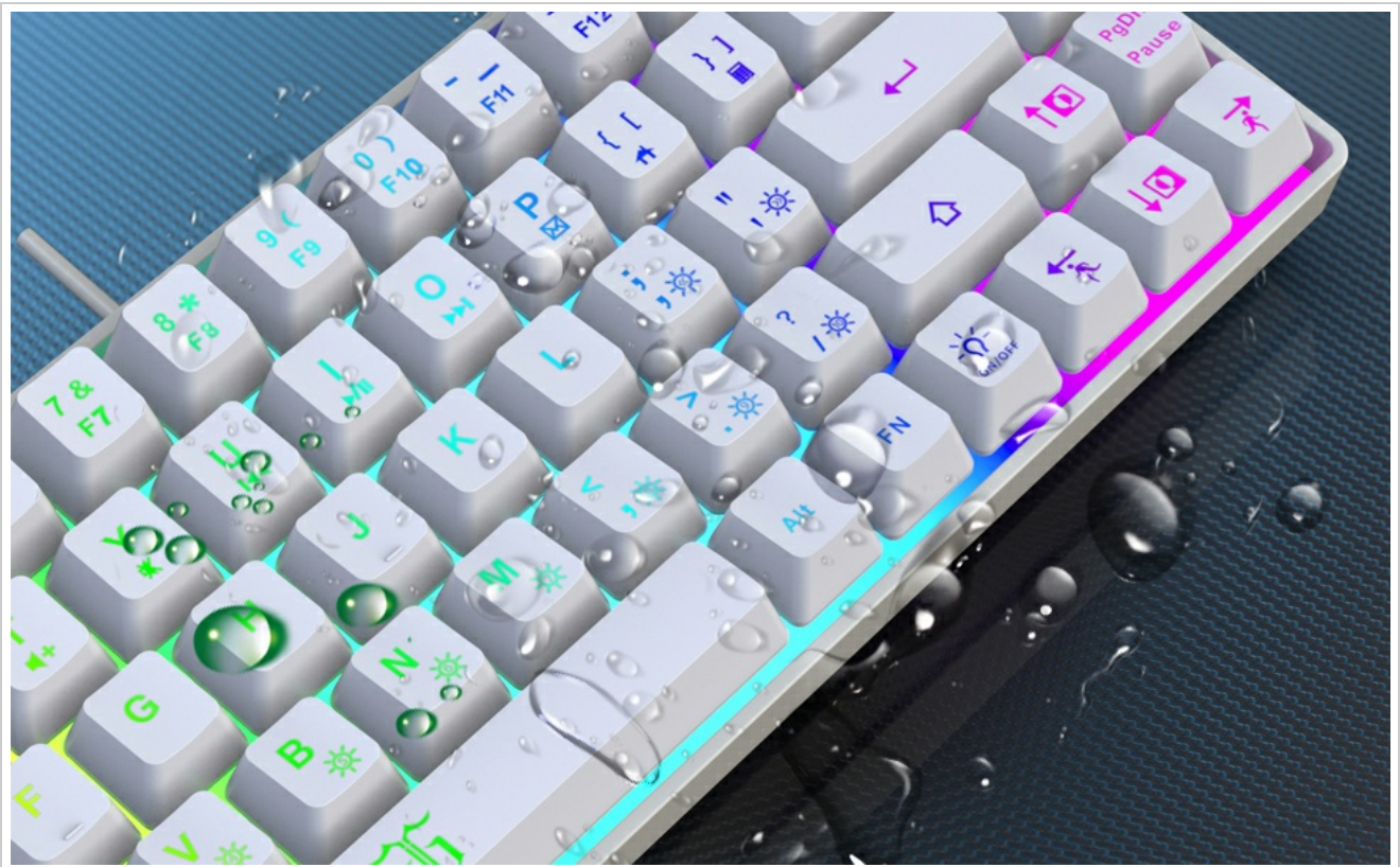
Image 6.1: The keyboard demonstrating its water-resistant design, capable of handling minor spills.