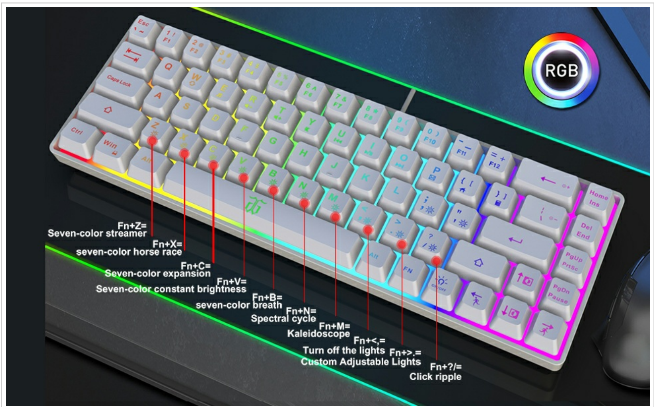
Image 5.2: Detailed explanation of various RGB lighting modes and their corresponding Fn key combinations.