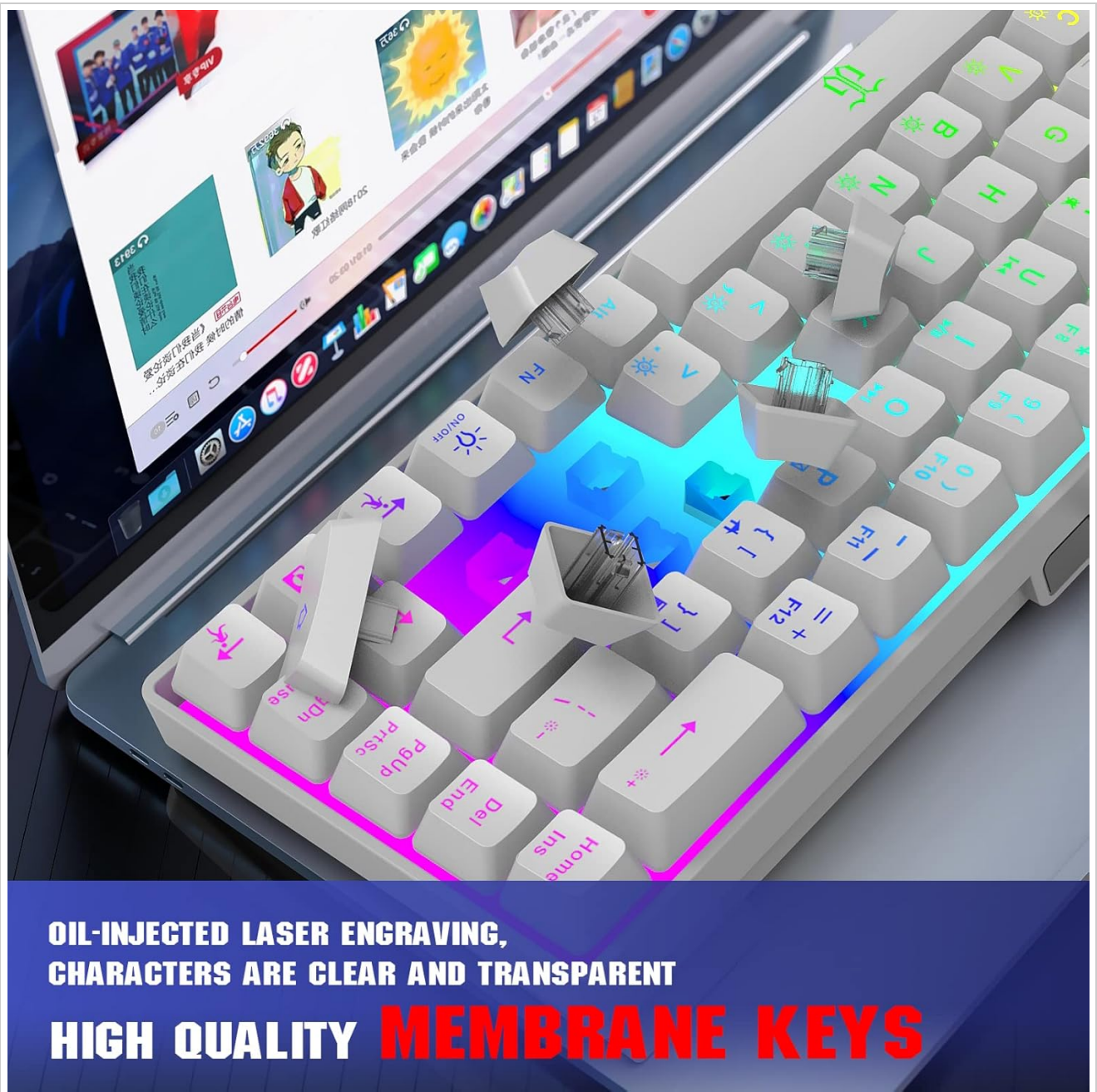
Image 3.3: Detailed view of the keycaps, showing the oil-injected laser engraving for clear, transparent characters and the underlying membrane key structure.