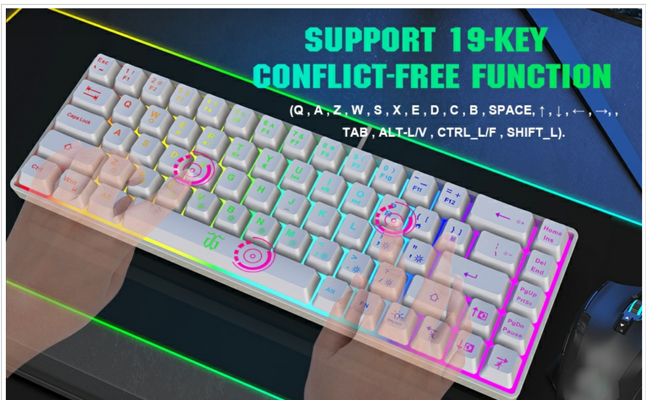
Image 5.4: Visual representation of the 19-key conflict-free (anti-ghosting) function.

The supported conflict-free keys include: Q, A, Z, W, S, X, E, D, C, B, SPACE, ↑, ↓, ←, →, TAB, ALT-L/V, CTRL-L/F, SHIFT-L.