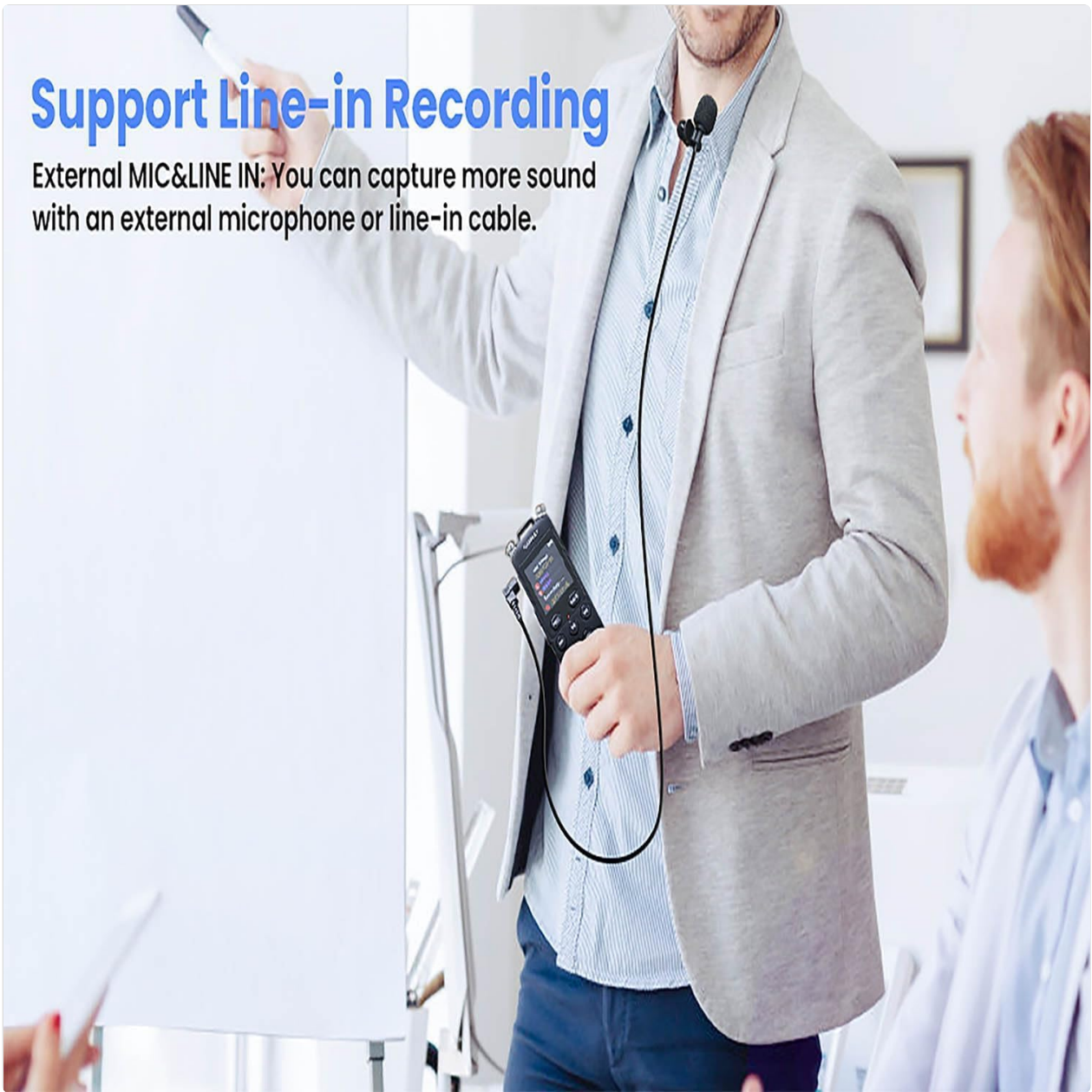
Image: A user demonstrating line-in recording with an external microphone, highlighting the device's ability to capture more sound.

External MIC&LINE IN: You can capture more sound with an external microphone or line-in cable.