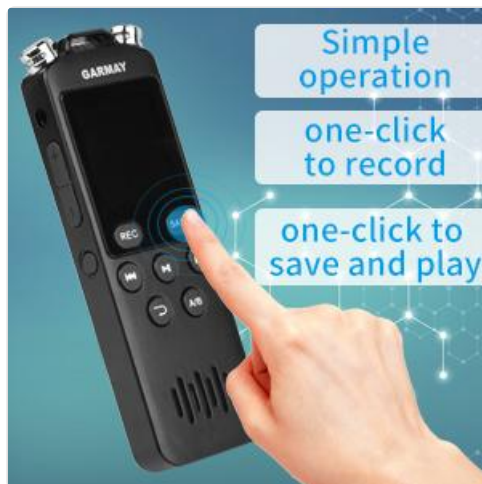
Image: A hand demonstrating the simple one-click operation to start recording on the device.