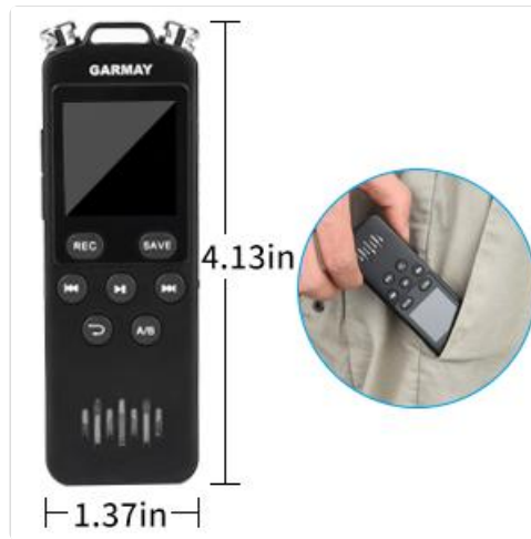
Image: The compact dimensions of the voice recorder (4.13 inches long, 1.37 inches wide) and its portability, fitting easily into a pocket.