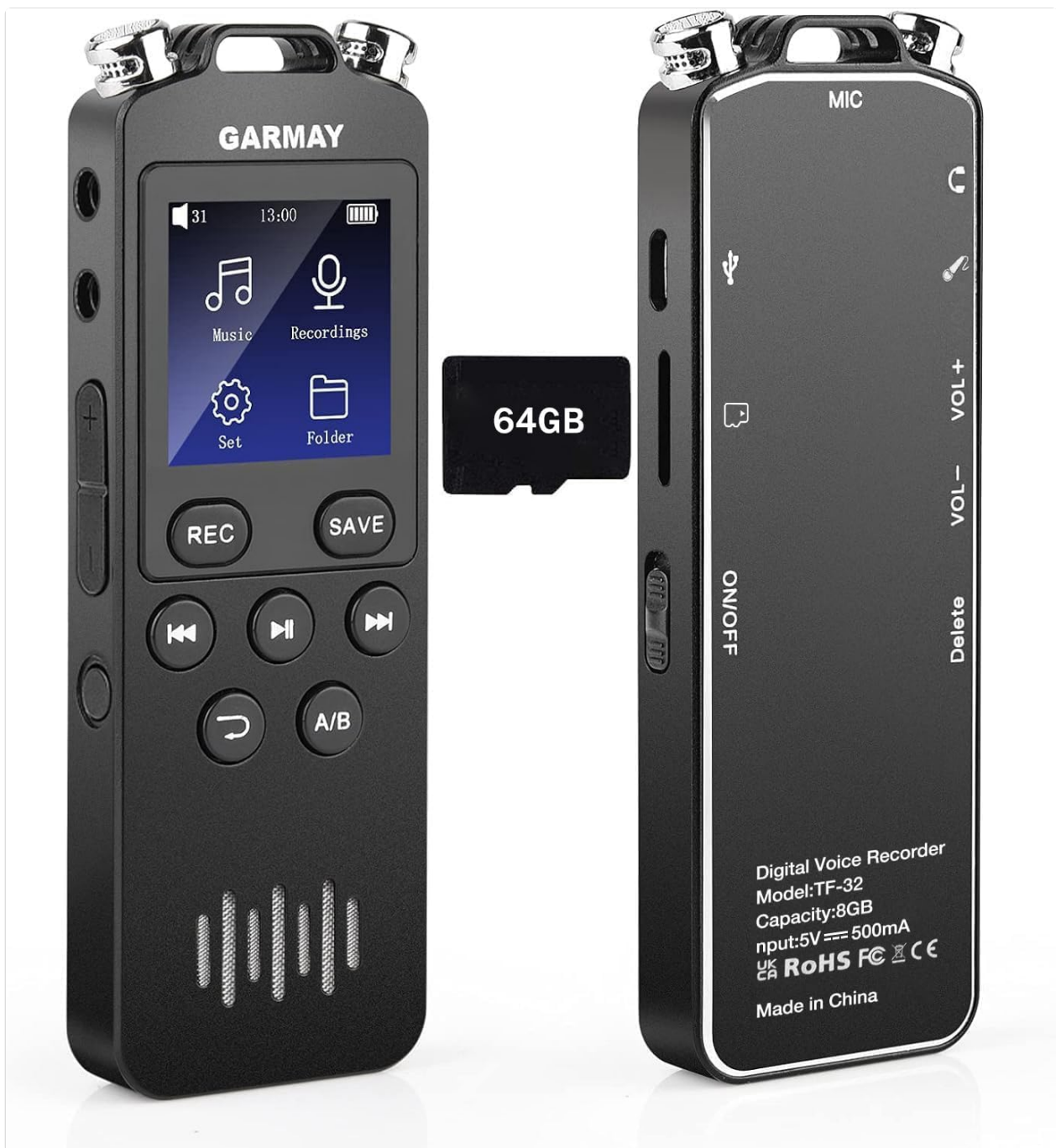
Image: Front and back view of the GARMAY Digital Voice Recorder, showcasing its compact design and the included 64GB TF card.