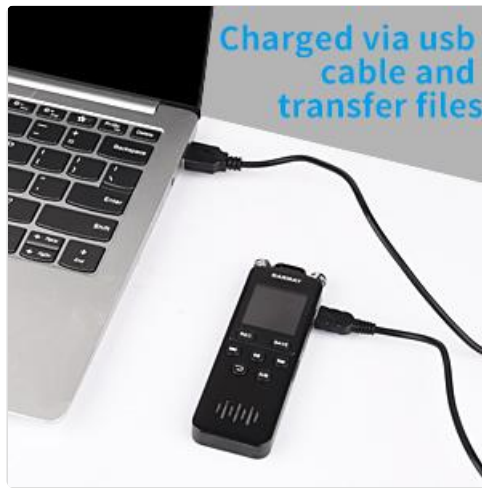
Image: The voice recorder connected to a laptop via USB cable, illustrating the charging and file transfer process.