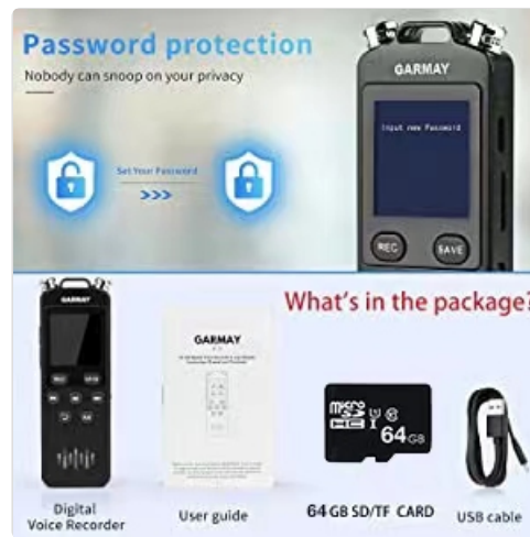
Image: Illustration of the package contents, including the voice recorder, user guide, 64GB SD/TF card, and USB cable.