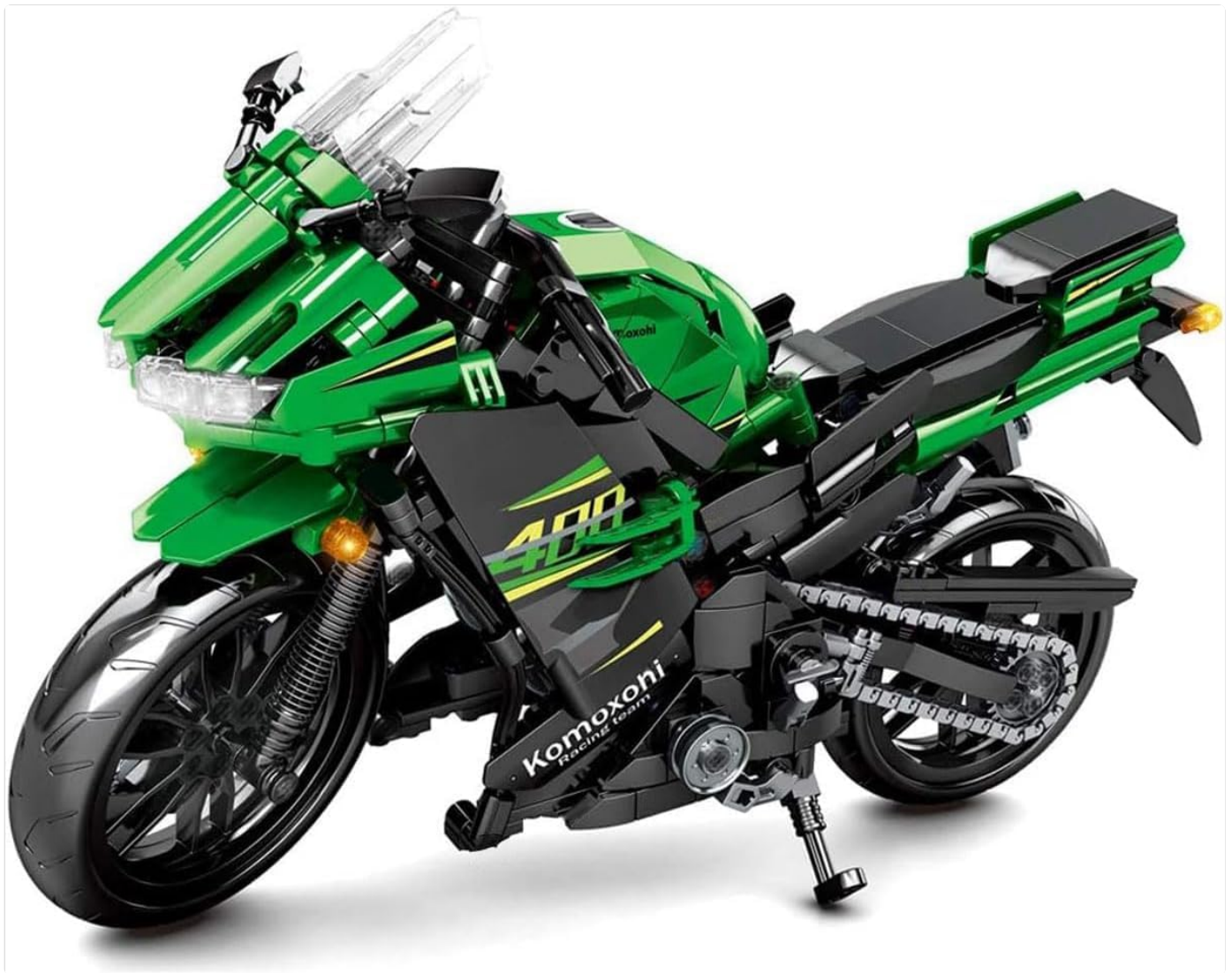
Image: The fully assembled Pasyru Technology Motorbike Building Set, showcasing its detailed design.