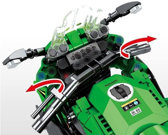
Image: Close-up view of the handlebars demonstrating the manual steering function.