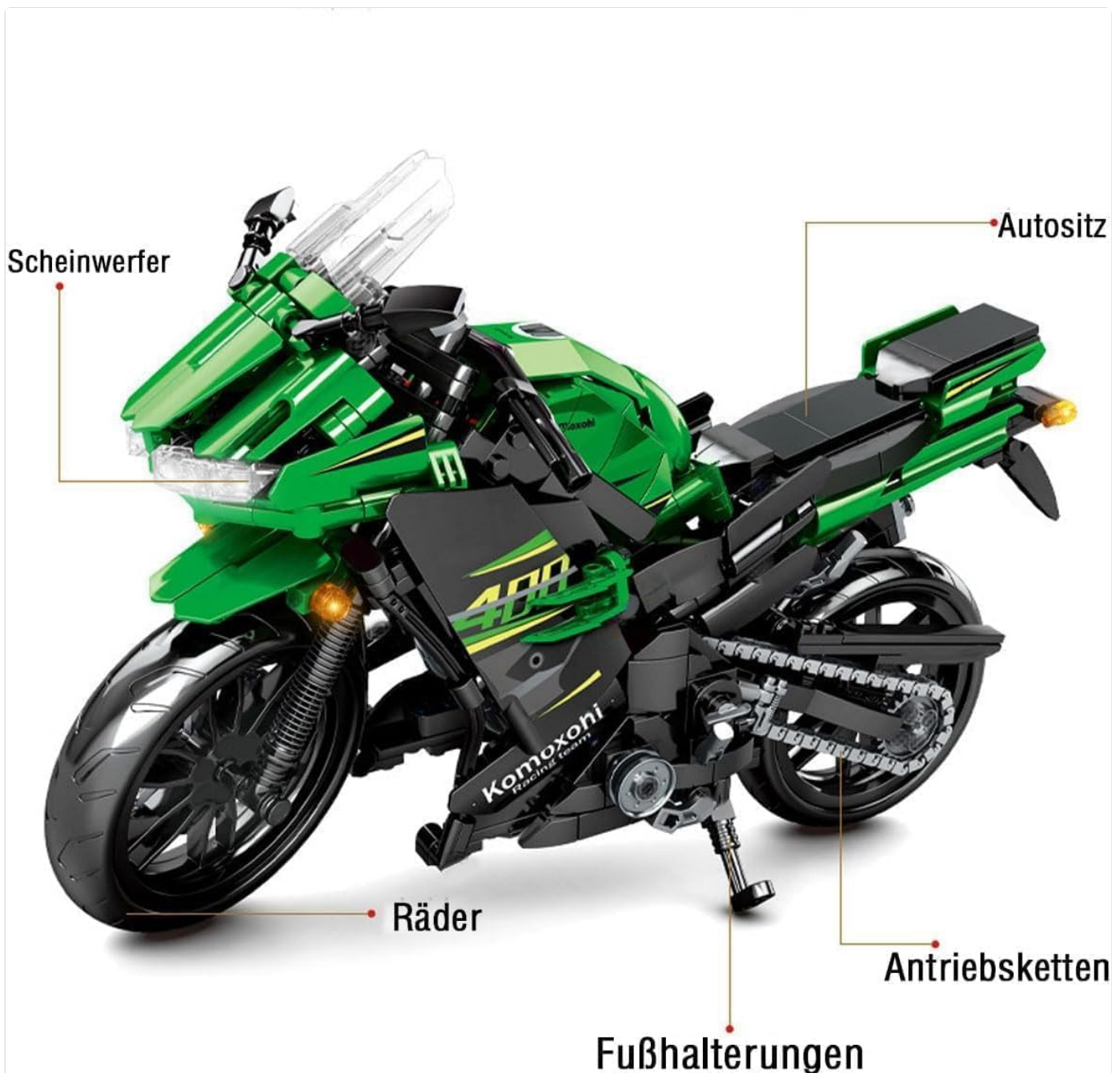
Image: An overview of the motorbike model highlighting key components such as the headlights, seat, wheels, drive chain, and footrests.