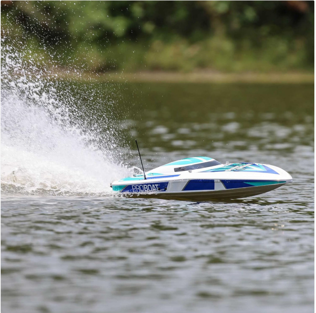
The Pro Boat Sonicwake V2 in action, demonstrating its speed and ability to create a significant rooster tail.

In the event the boat flips over during operation, the self-righting hull design allows it to automatically return to an upright position. This feature is particularly useful when operating far from shore or in challenging water conditions.