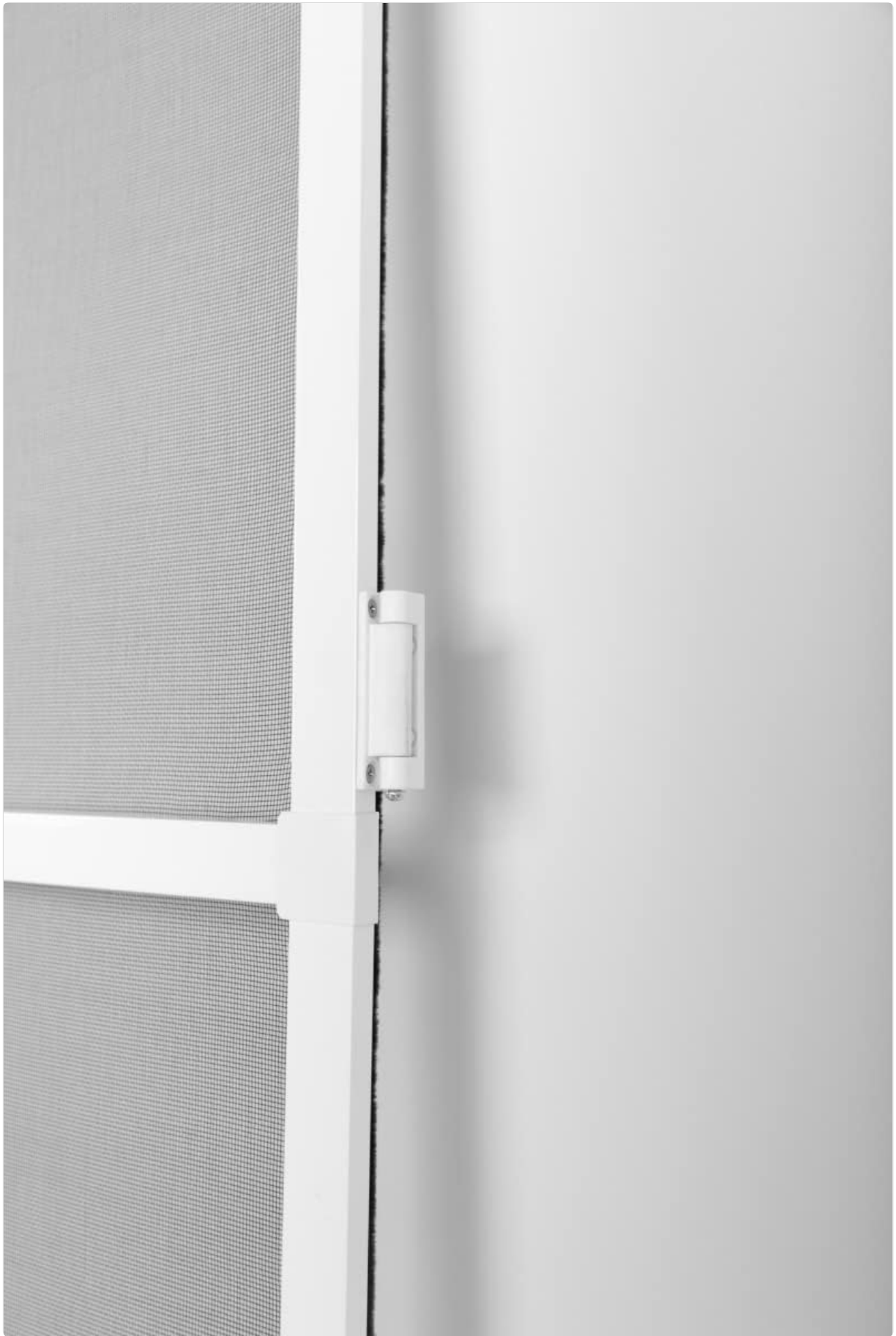
Image: Detail of a hinge attachment point on the screen door frame.