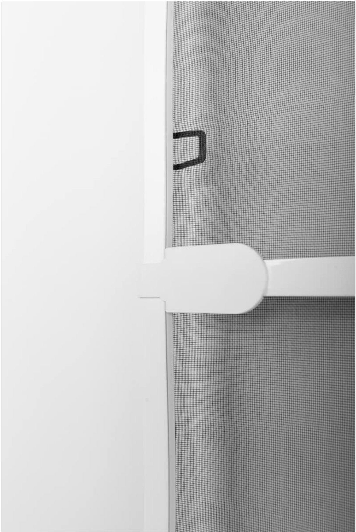
Detail of the handle installed on the screen door.