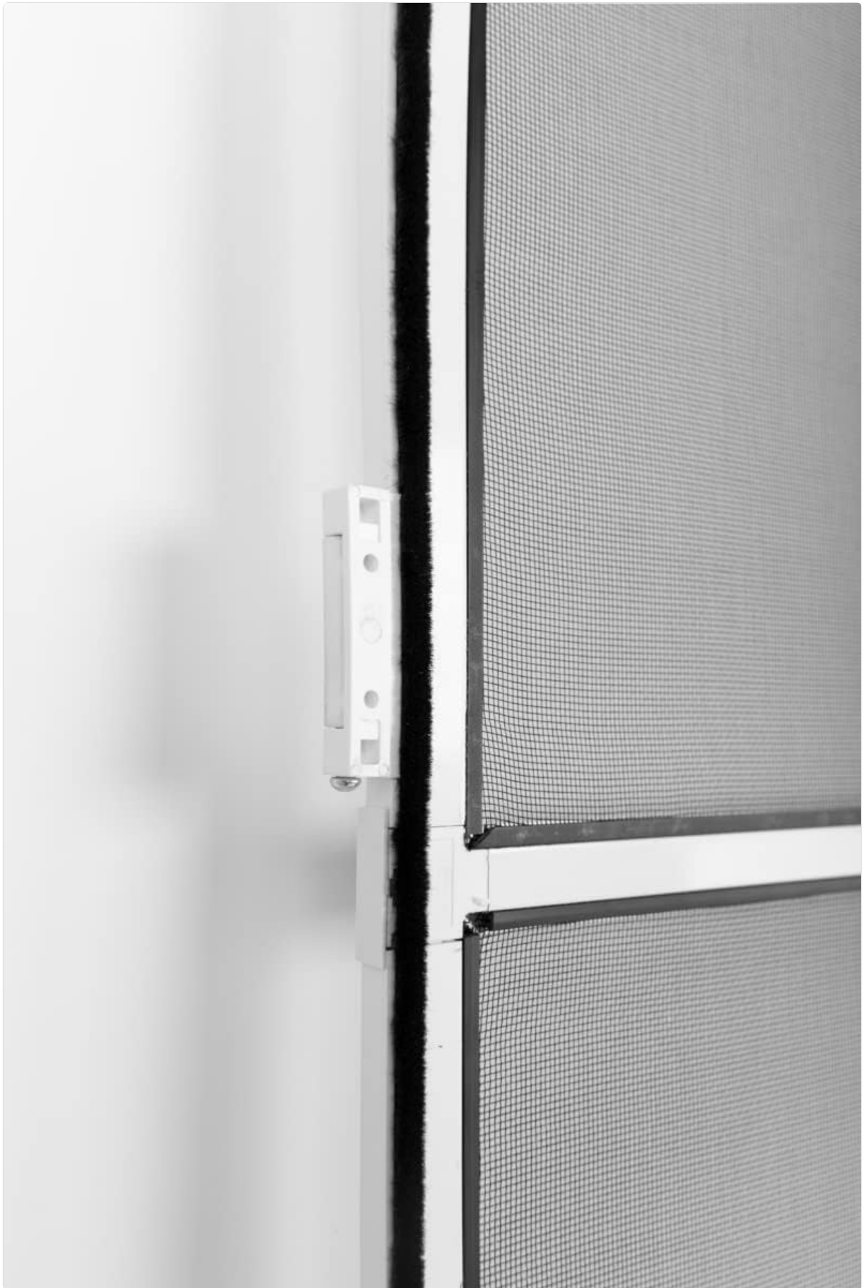
Image: View of the brush seal and the integrated magnet mechanism.