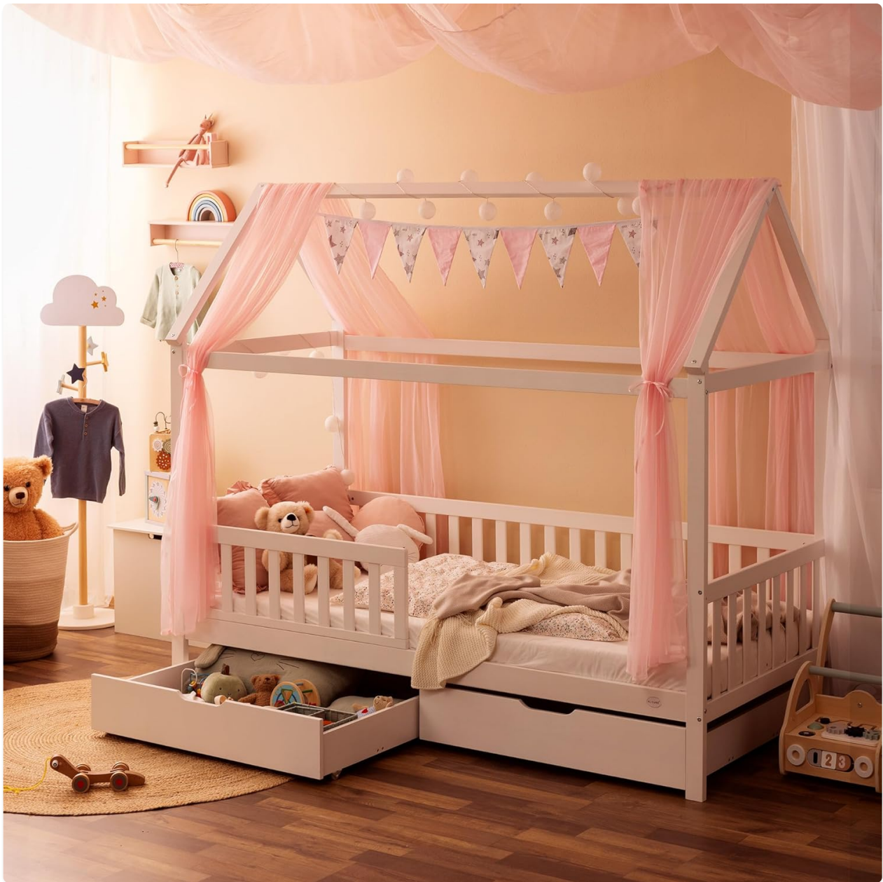
Image: The Alcube Home Bed, featuring a white wooden frame, pink canopy, and two pull-out storage drawers.