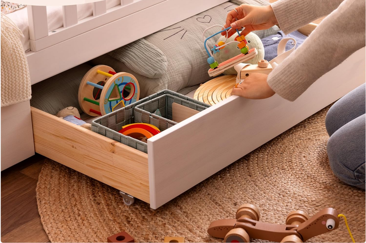
Image: The integrated storage drawers provide convenient space for toys and other belongings.

Fällt es euch auch schwer, euren Süßen Spielzeugwünsche abzuschlagen? Uns auch, daher sind gleich zwei Schubkästen dabei, die genug Stauraum bieten.