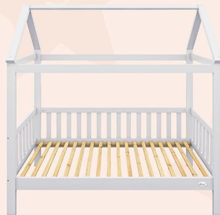
Geht auch ohne!

Image: The bed offers flexible fall protection, allowing installation on the left, right, or no fall protection for older children.