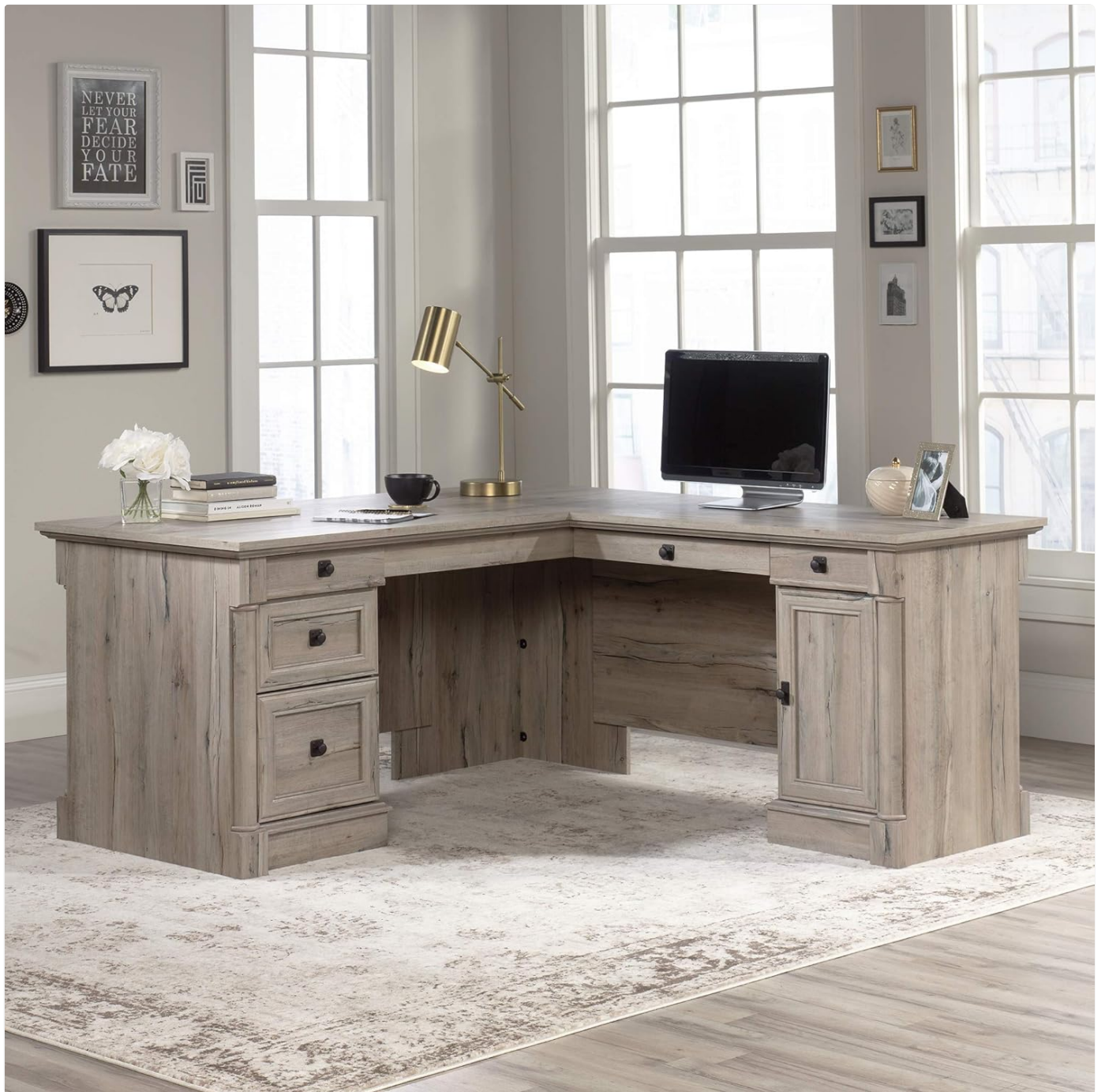
Image: Fully assembled Sauder Palladia L-Shaped Desk in a room, showcasing its design and functionality.