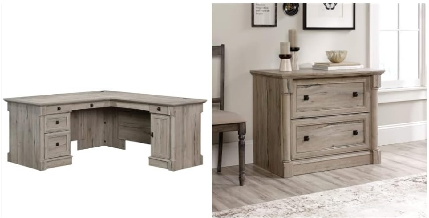
Image: Sauder Palladia L-Shaped Desk and Lateral File in Split Oak Finish.

The Sauder Palladia L-Shaped Desk and Lateral File combination provides a comprehensive solution for your home or office workspace. This set includes an L-shaped desk designed for efficient use of space and a matching lateral file cabinet for organized storage. Both pieces feature a durable construction with a Split Oak finish, offering both functionality and aesthetic appeal.