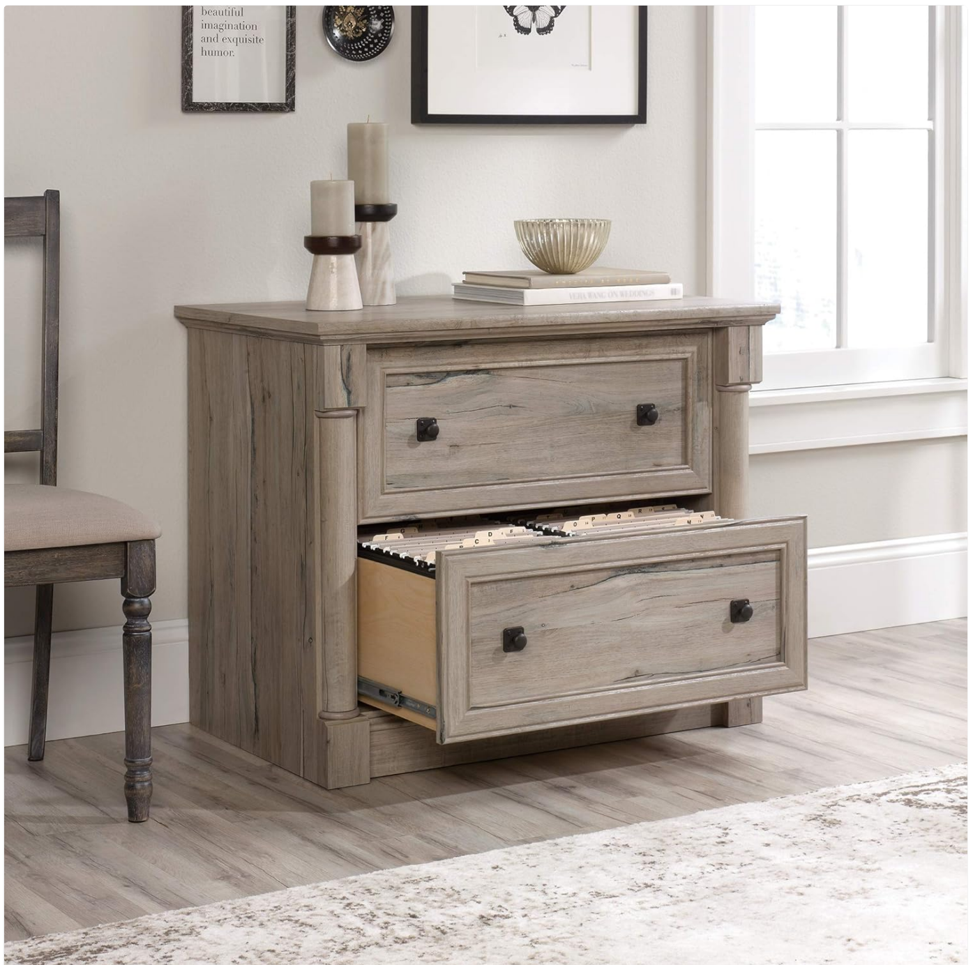
Image: Fully assembled Sauder Palladia Lateral File Cabinet, ready for use.