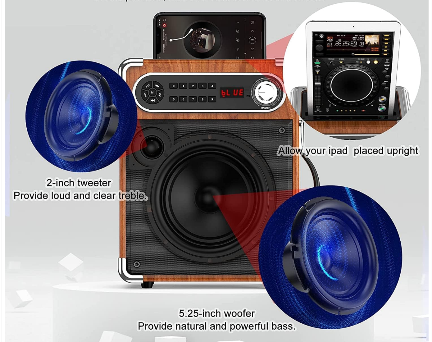
Figure 6: Internal components for HD Stereo Sound Quality.

Create powerful, loud and clear stereo sound effects.