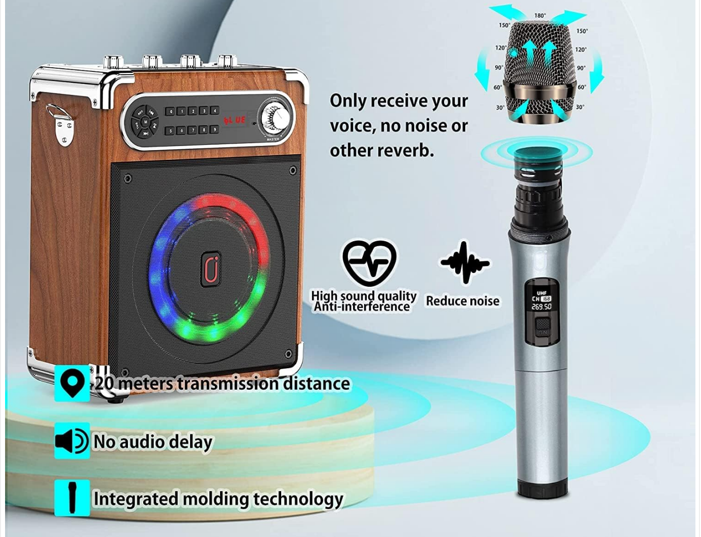
Figure 4: Auto-connection and high sound quality of microphones.

Advanced digital signal modulation technology of wireless transmission, Provide high sound quality and stable signal transmission.