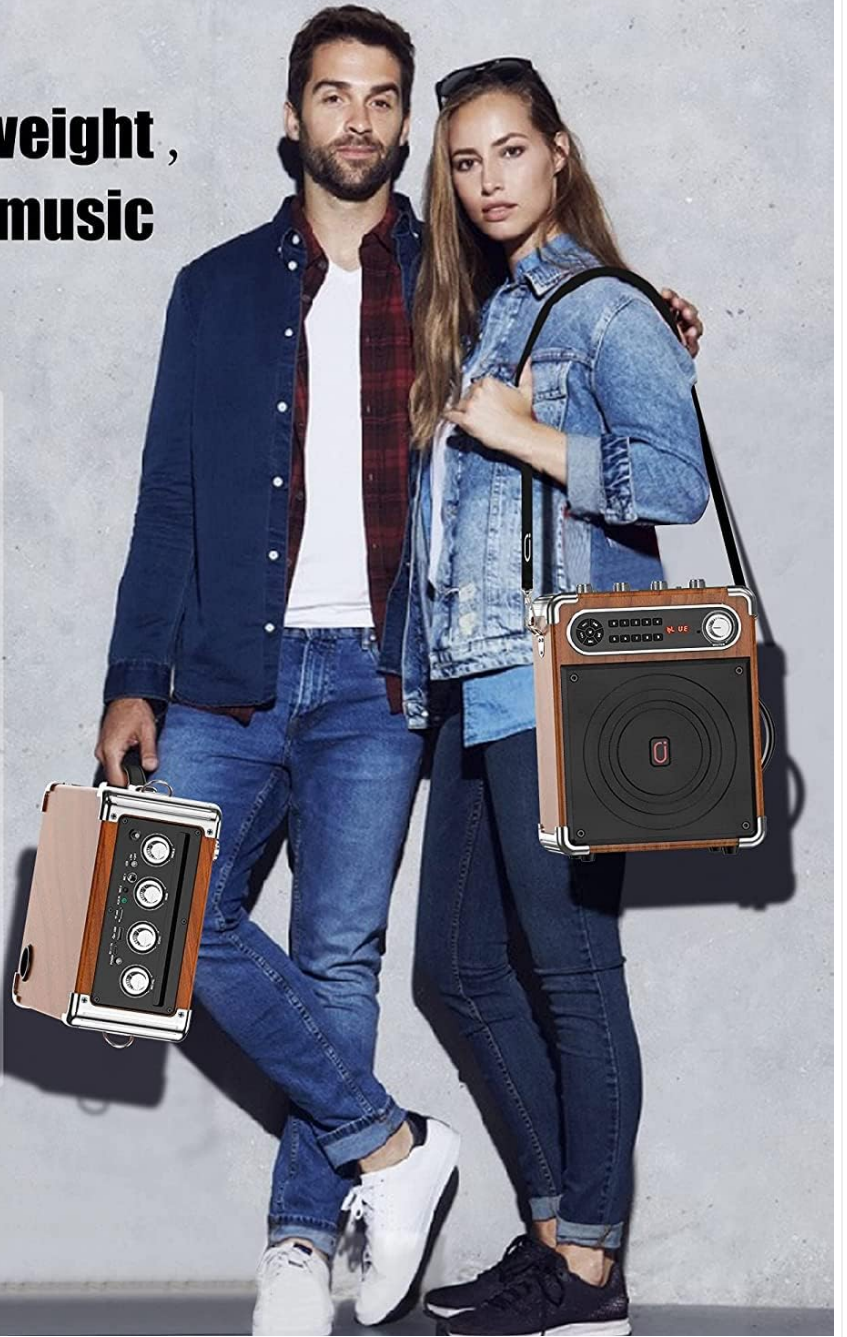
Figure 7: Compact and lightweight design with dimensions.