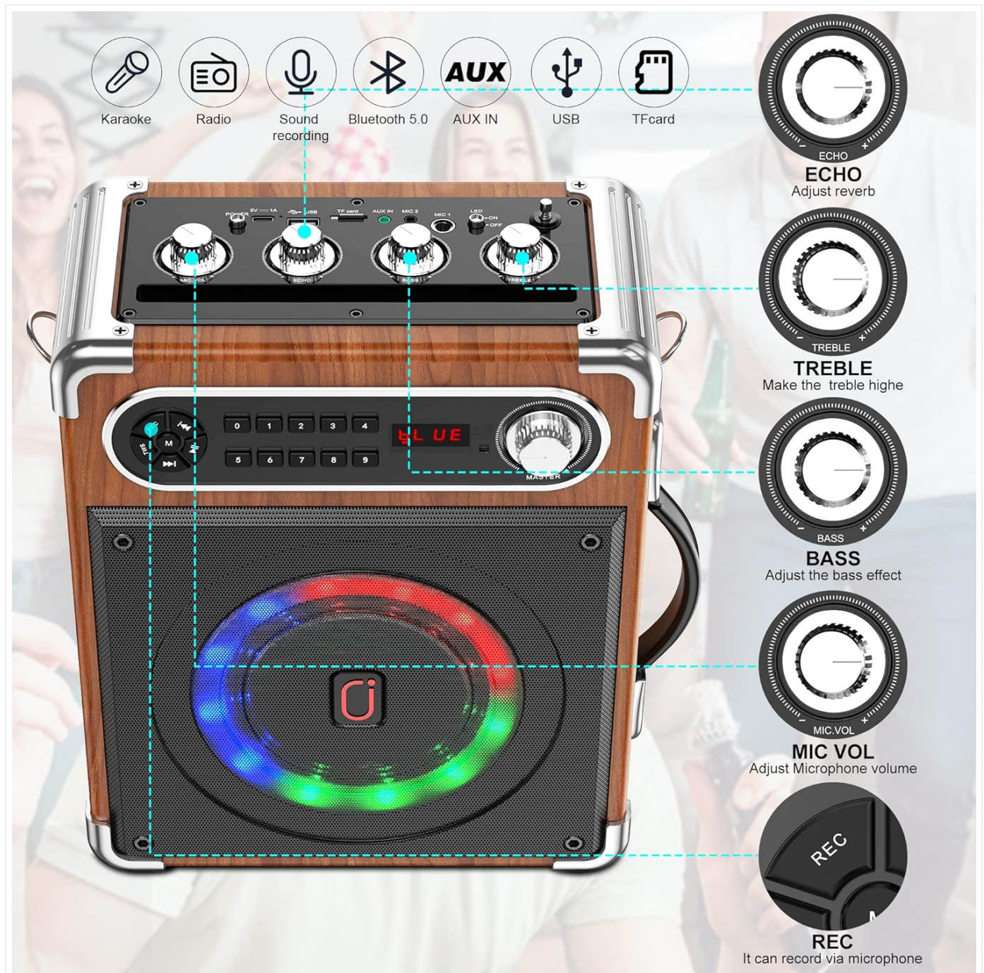
Figure 2: Control Panel Overview.

Locate the power button on the control panel. Press and hold to power the speaker on or off.