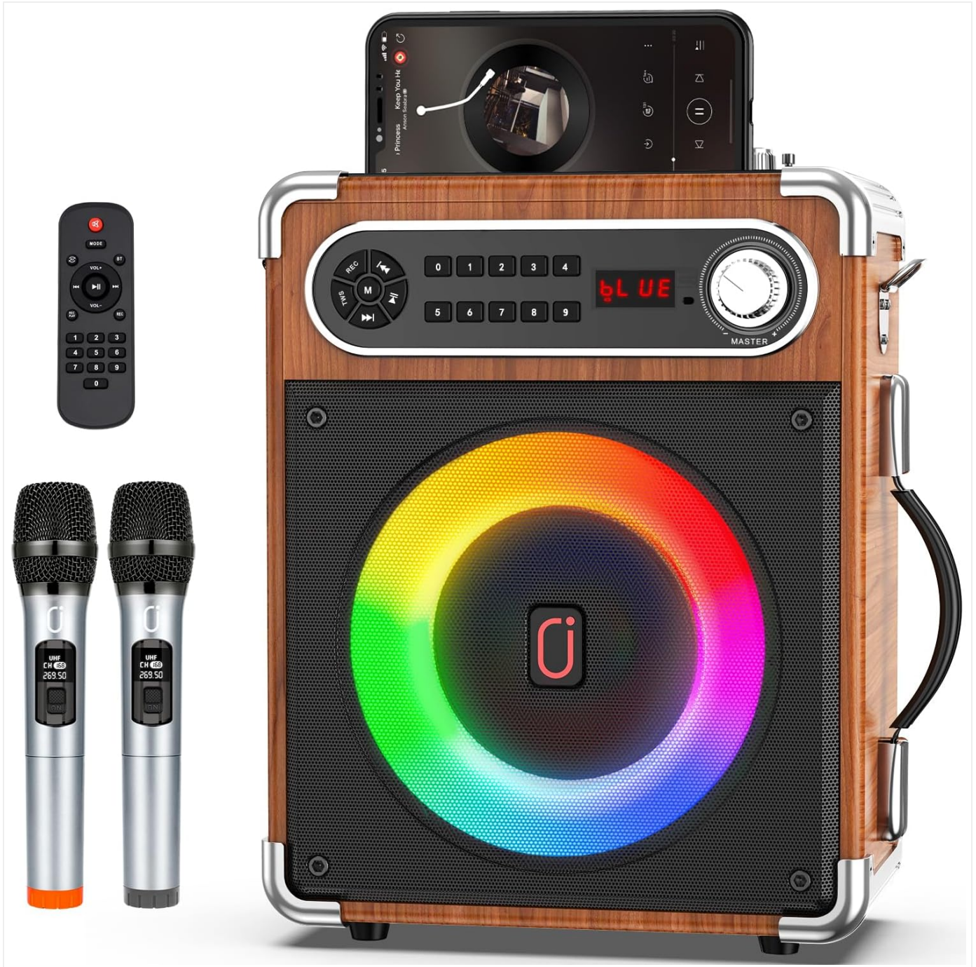
Figure 1: JAUYXIAN S55 Speaker System and Accessories.