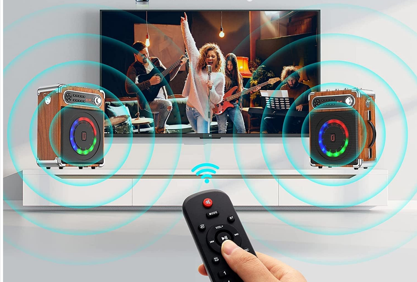
Figure 5: TWS (TWINS) interconnect technology for immersive stereo.