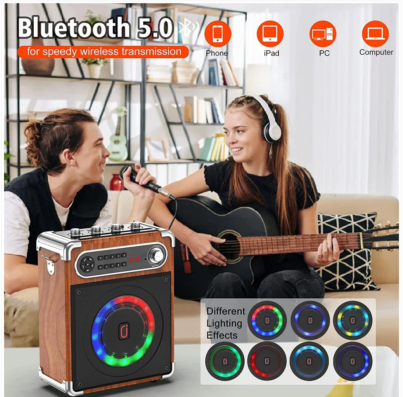
Figure 3: Bluetooth 5.0 for speedy wireless transmission.