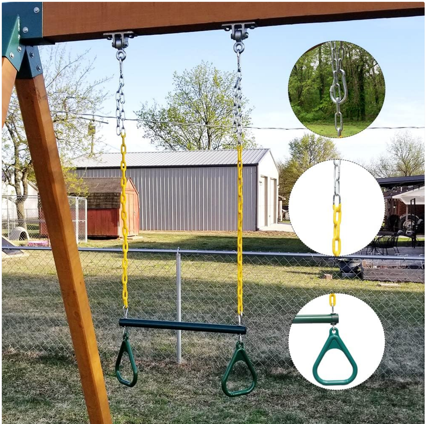
Figure 3: Example of the trapeze bar installed on a wooden swing set, showing chain and ring details.