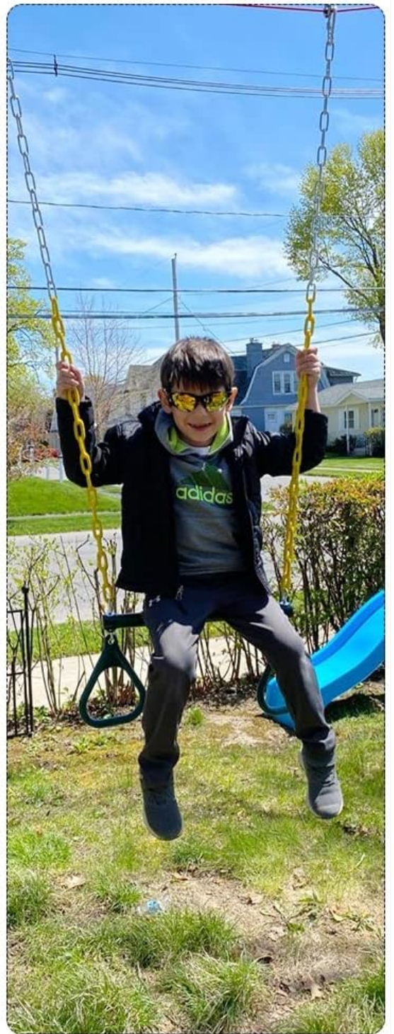
Figure 5: A child demonstrating the use of the trapeze swing bar, highlighting its recreational purpose.