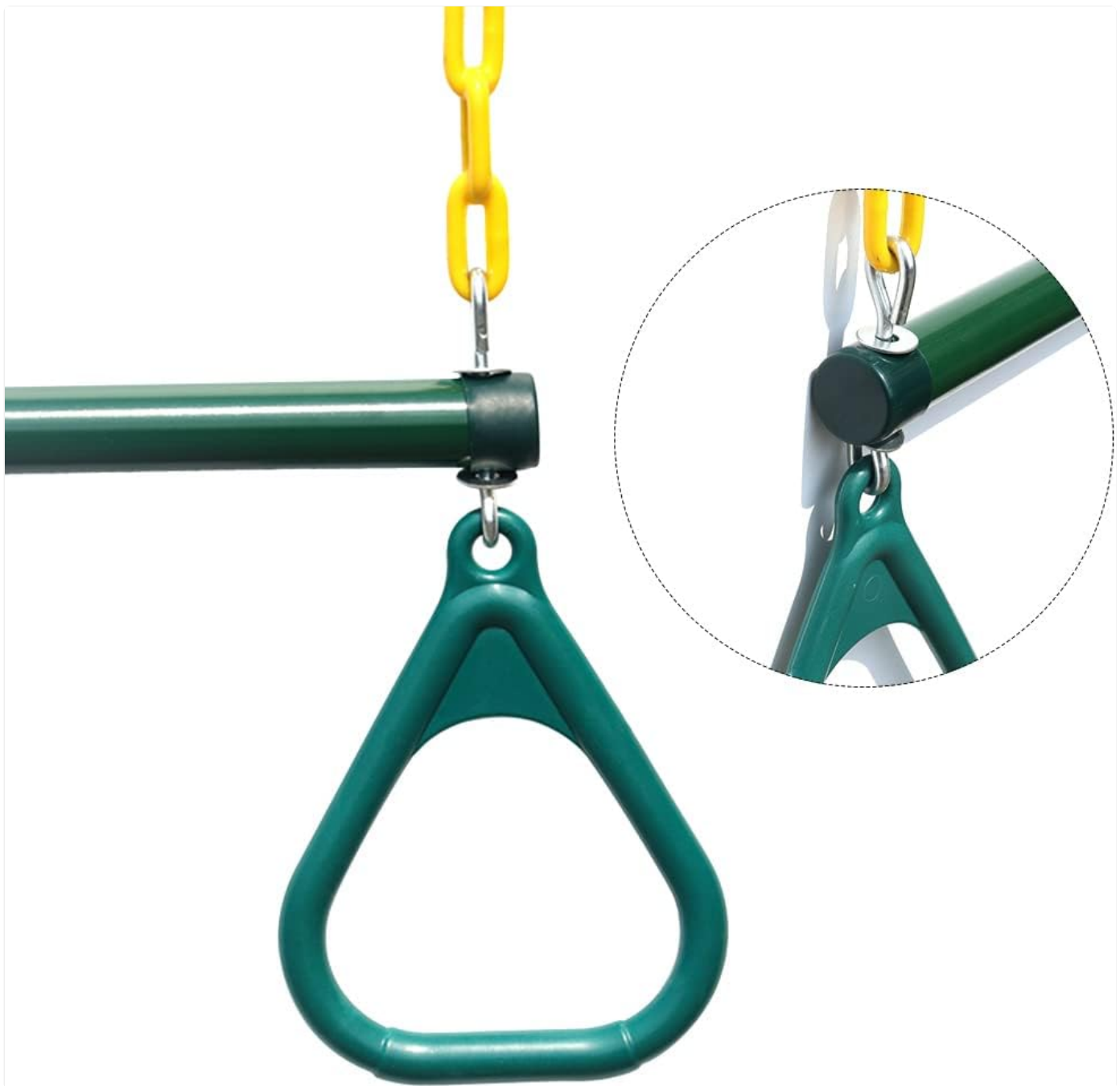
Figure 4: Close-up view of the trapeze bar and ring attachment point, highlighting the secure connection.