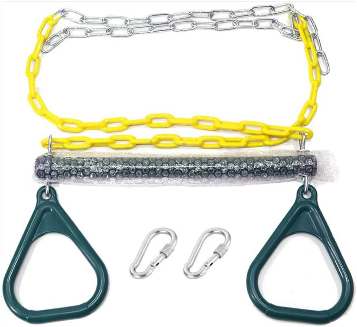
Figure 2: All components included in the package.