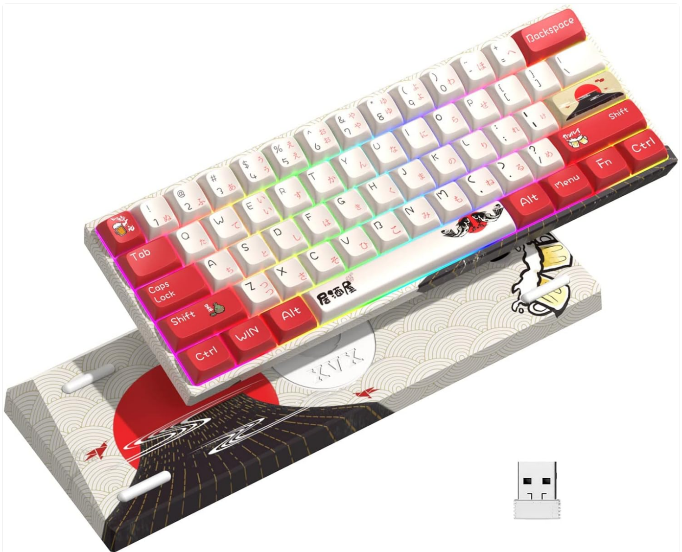
Image: The HITIME XVX M61 60% Wireless Mechanical Keyboard, showcasing its compact layout and Izakaya theme design with RGB backlighting.