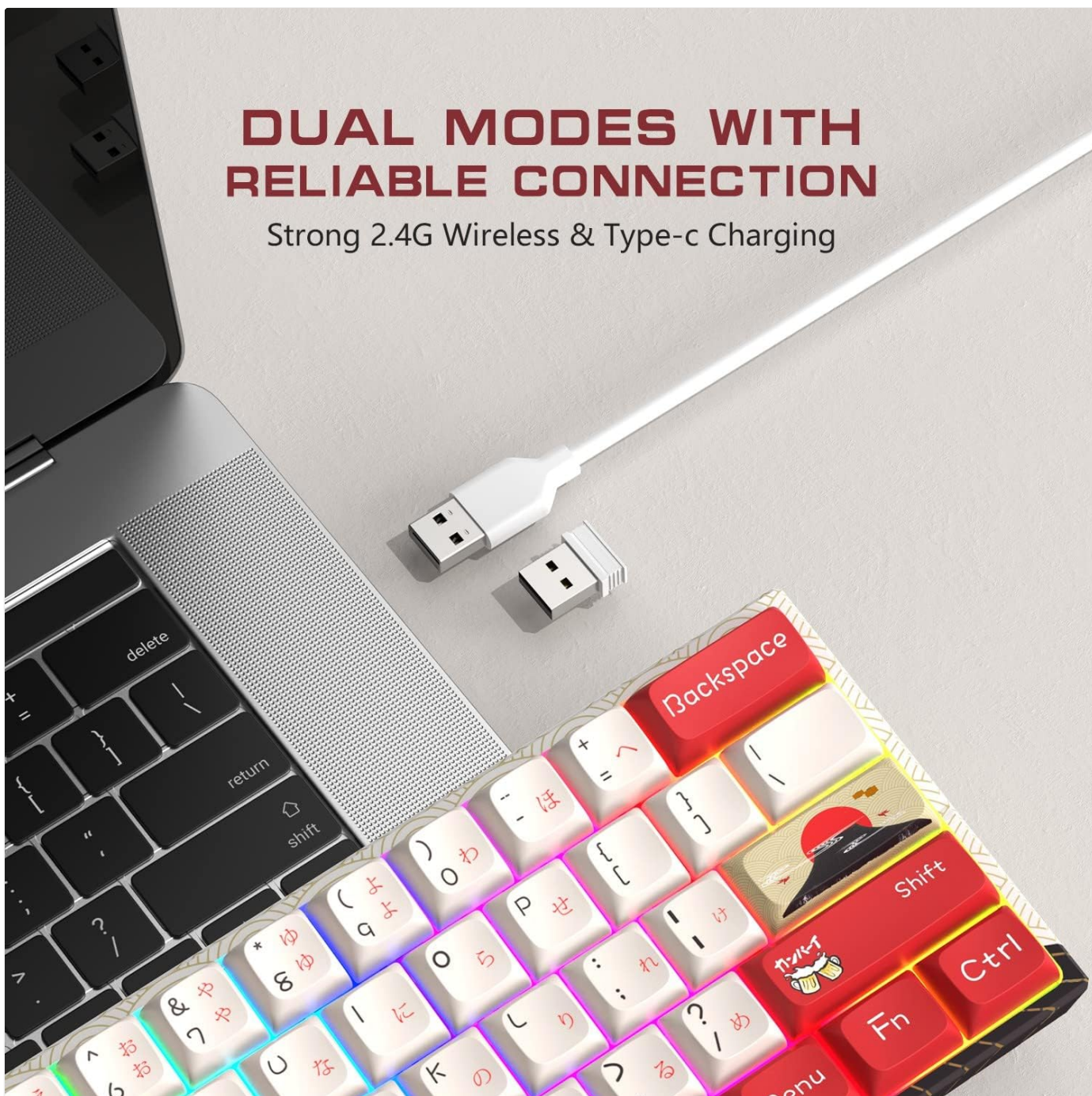
Image: The HITIME XVX M61 keyboard connected to a laptop, highlighting the 2.4G wireless receiver and USB-C charging cable.