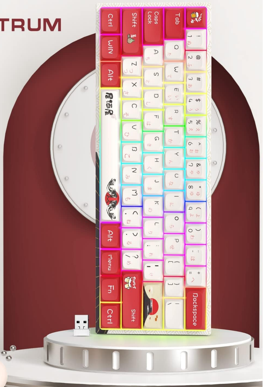
Image: Visual representation of the keyboard's RGB backlighting capabilities, including various effects, color options, and brightness adjustments.