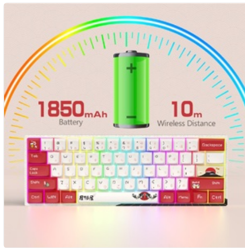
Image: Illustration showing the keyboard's 1850mAh battery capacity and 10-meter wireless range.