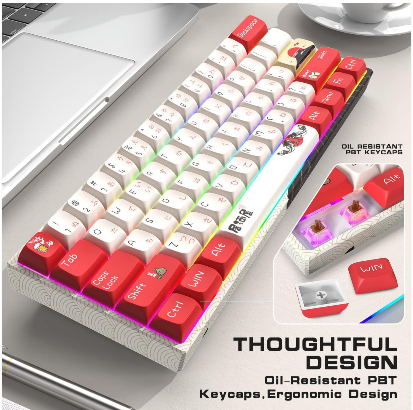
Image: Detailed view of the keyboard's construction, highlighting the oil-resistant PBT keycaps and the Gateron Brown mechanical switches.