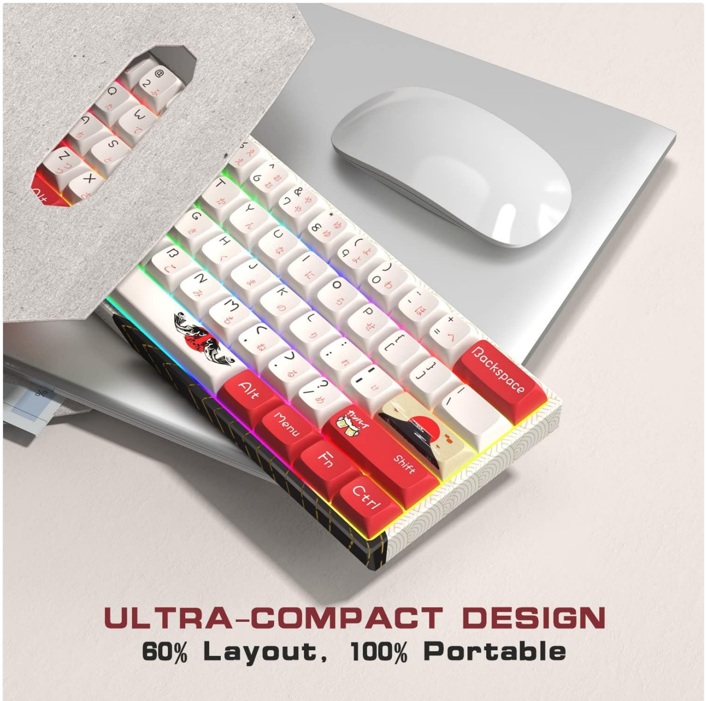
Image: The HITIME XVX M61 keyboard demonstrating its ultra-compact 60% layout, emphasizing portability.