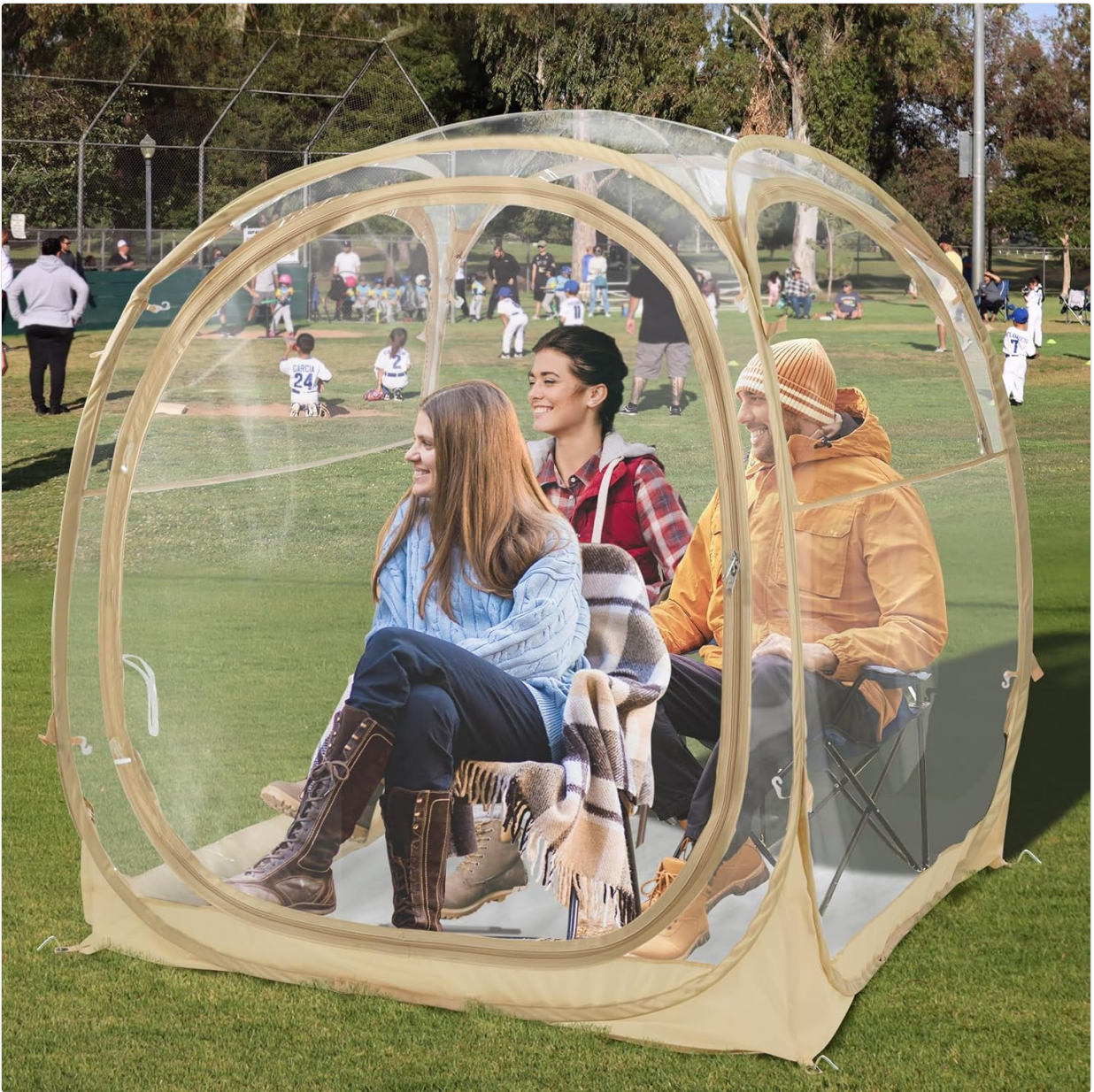
The EighteenTek Pod All Weather Sports Tent set up on a grassy field, providing shelter for three individuals.