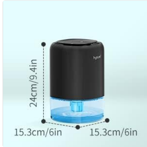
Image: The Hysure dehumidifier with its approximate dimensions (15.3cm/6in width and 24cm/9.4in height) clearly marked.