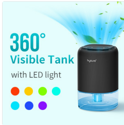
Image: A graphic illustrating the 360° visible water tank and the range of 7 LED light colors available for selection.