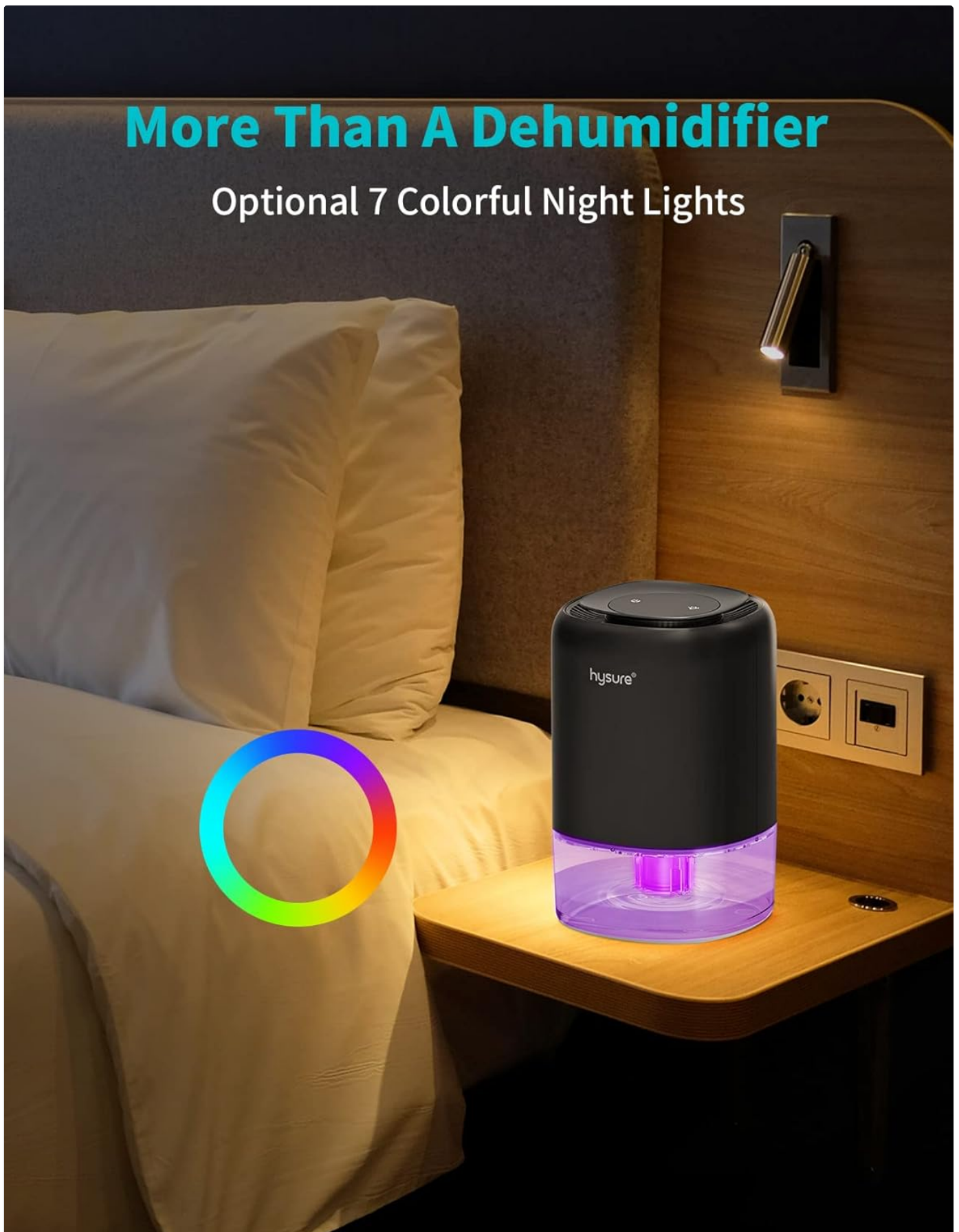
Image: The Hysure dehumidifier placed on a nightstand next to a bed, illustrating its compact size and the optional colorful night light feature in a bedroom setting.