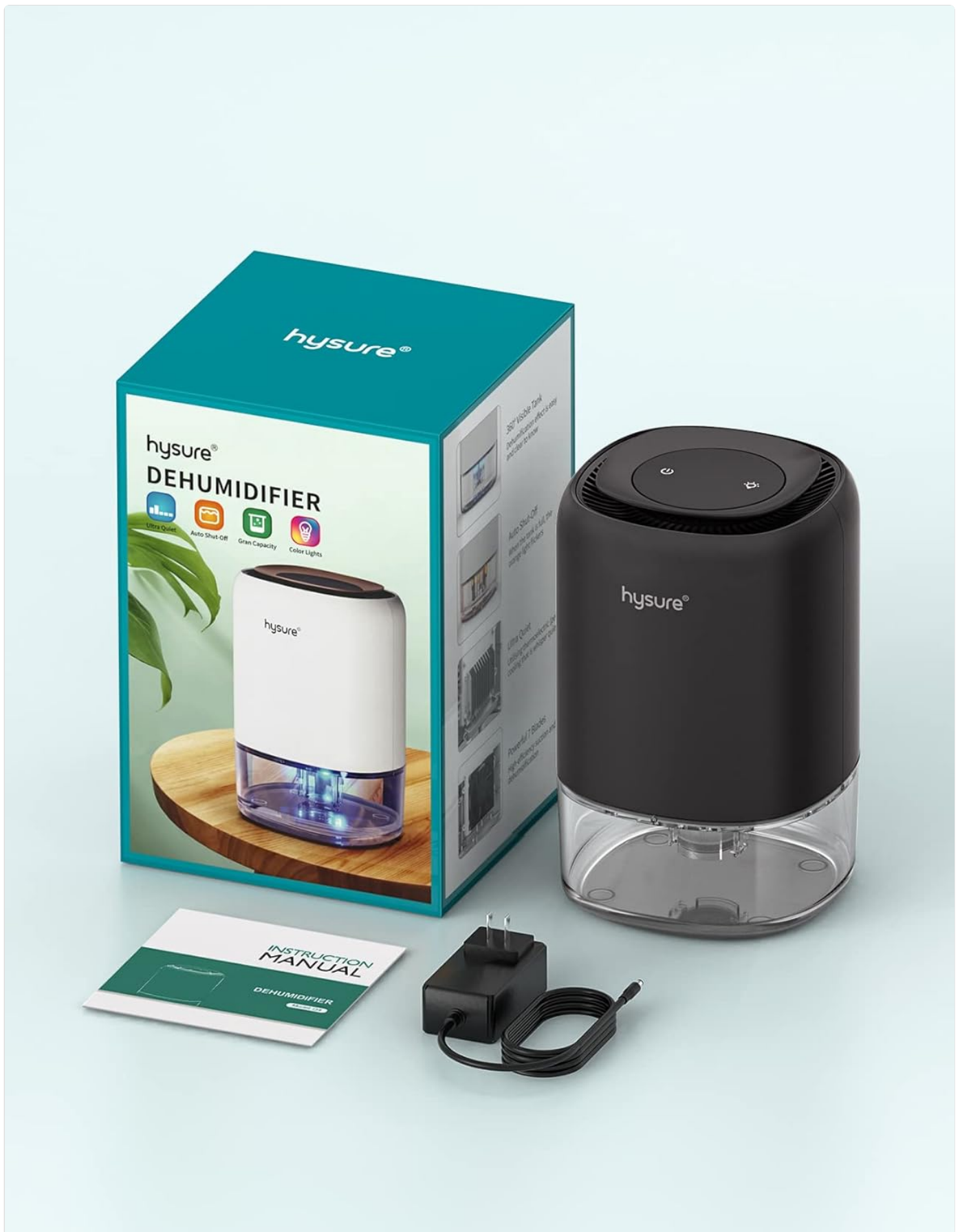
Image: The Hysure dehumidifier, its retail box, instruction manual, and power adapter, illustrating the items included in the package.