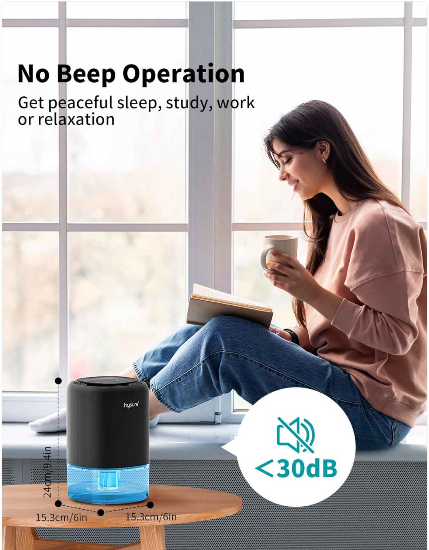
Image: A person reading next to the Hysure dehumidifier, emphasizing its quiet operation (less than 30dB) suitable for peaceful environments.

Get peaceful sleep, study, work or relaxation