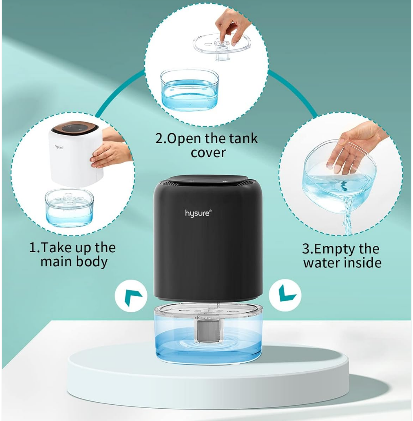
Image: A step-by-step visual guide demonstrating how to detach the main body, open the tank cover, and empty the 1400ml water tank for easy cleaning.