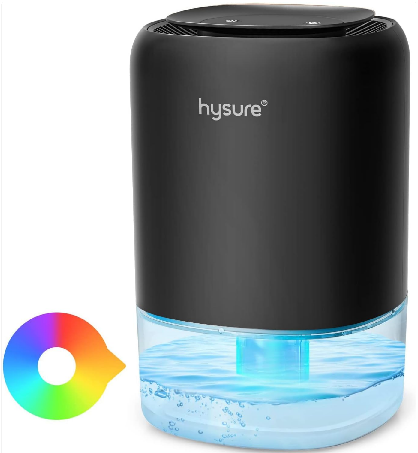
Image: Front view of the Hysure Small Dehumidifier, showcasing its compact design, transparent water tank, and the illuminated base indicating colorful light options.