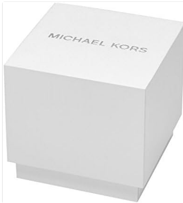
Figure 5: The Michael Kors presentation box, which typically contains the watch, user manual, and warranty information.