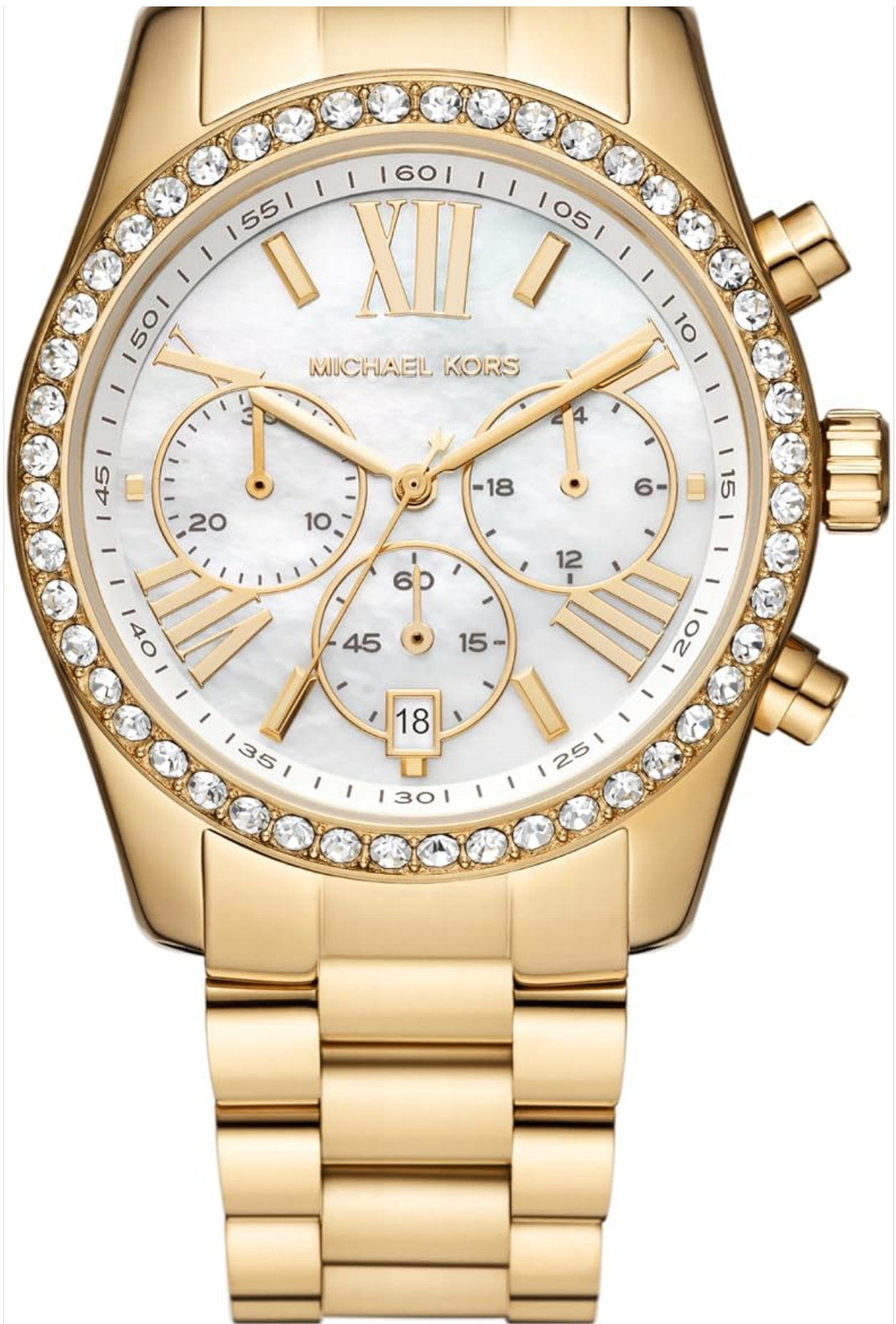
Figure 1: Front view of the Michael Kors Lexington Chronograph Watch, showcasing its gold-tone case, crystal-set bezel, white mother-of-pearl dial with Roman numerals and stick markers, and chronograph subdials.