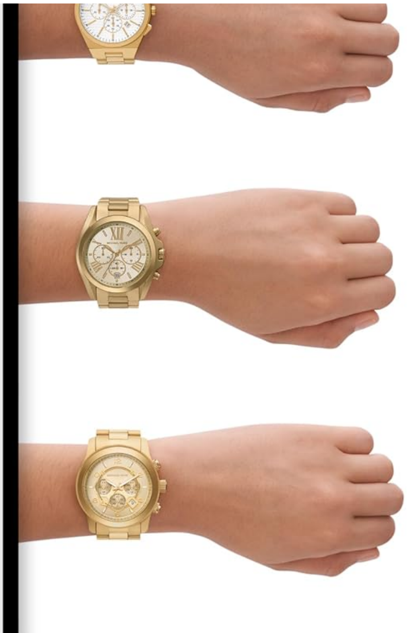
Figure 4: Visual guide illustrating different watch case sizes on a wrist, including the 38mm size of this model.