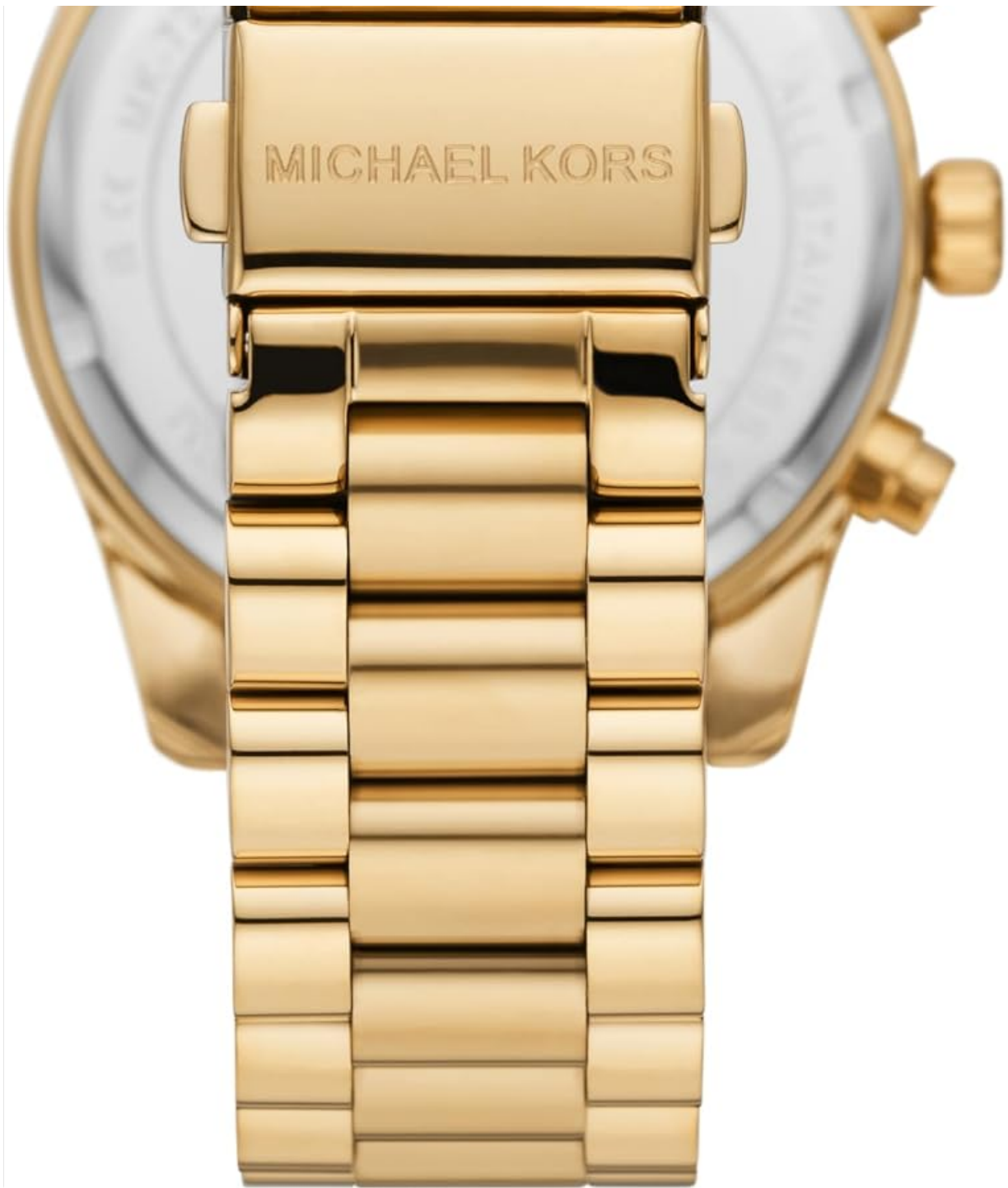
Figure 3: Rear view of the watch, showing the deployment clasp with the Michael Kors branding, which can be adjusted for fit.