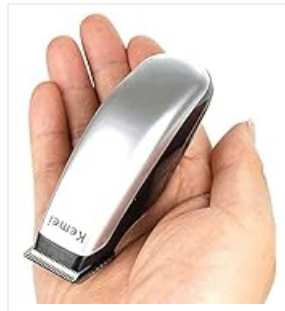
The compact KEMEI TX1 Shaver fits comfortably in hand, highlighting its portability.