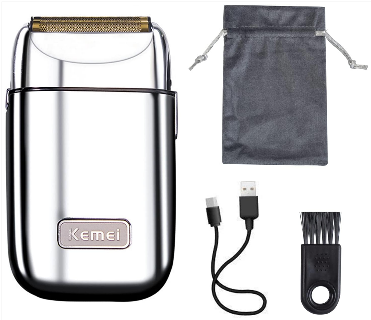
KEMEI TX1 Electric Foil Shaver with included USB charging cable, cleaning brush, and travel pouch.