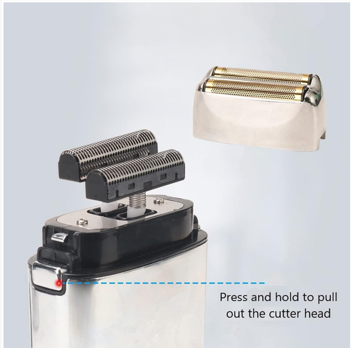
Demonstration of detaching the cutter head for cleaning.