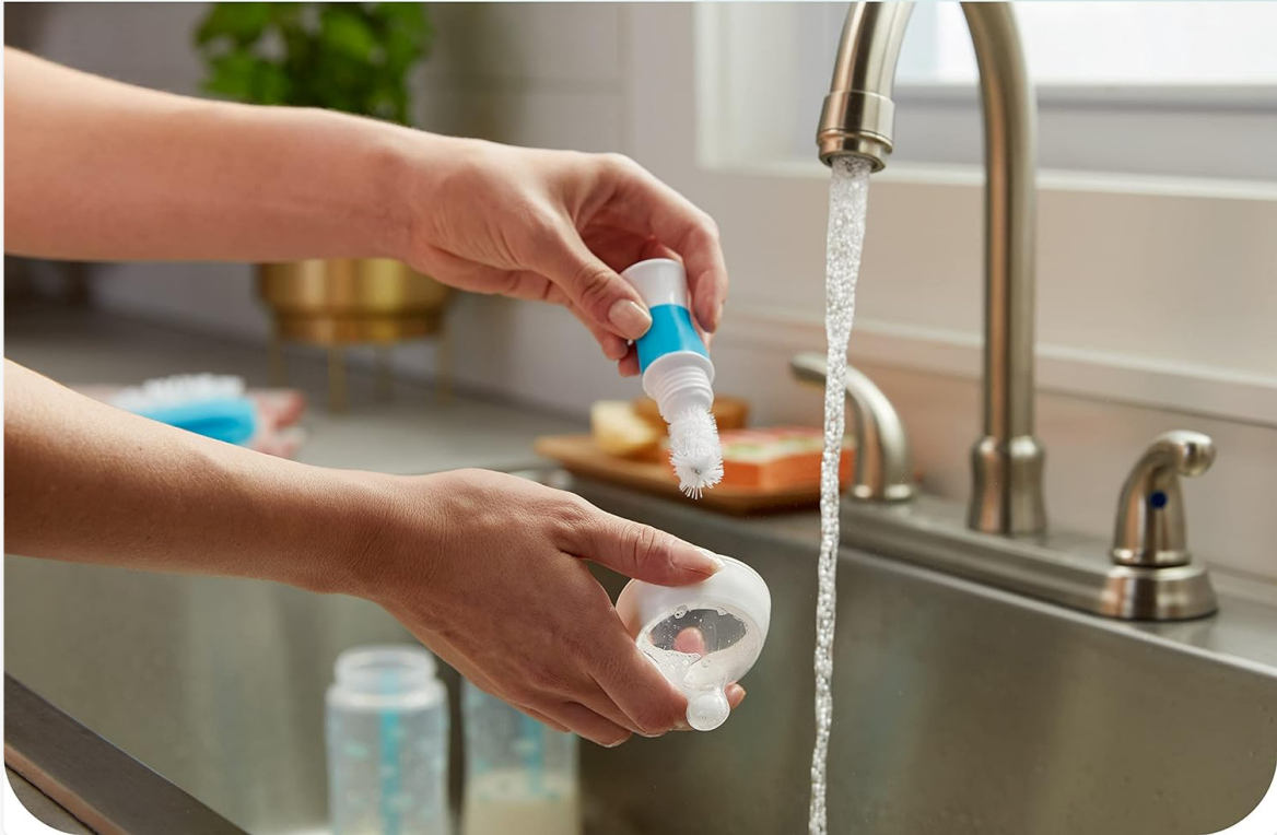
Image: A hand using the provided brush to clean the NUK Smooth Flow Pro bottle, highlighting the ease of cleaning the one-piece nipple and collar.