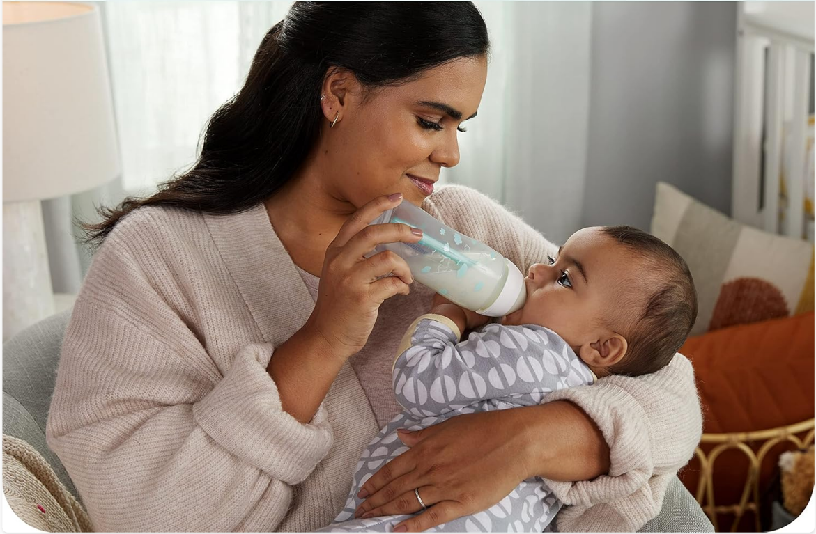
Image: A baby being fed with the NUK Smooth Flow Pro bottle, illustrating its use in reducing colic symptoms.

Proven to reduce colic symptoms such as gas, extensive crying, and reflux