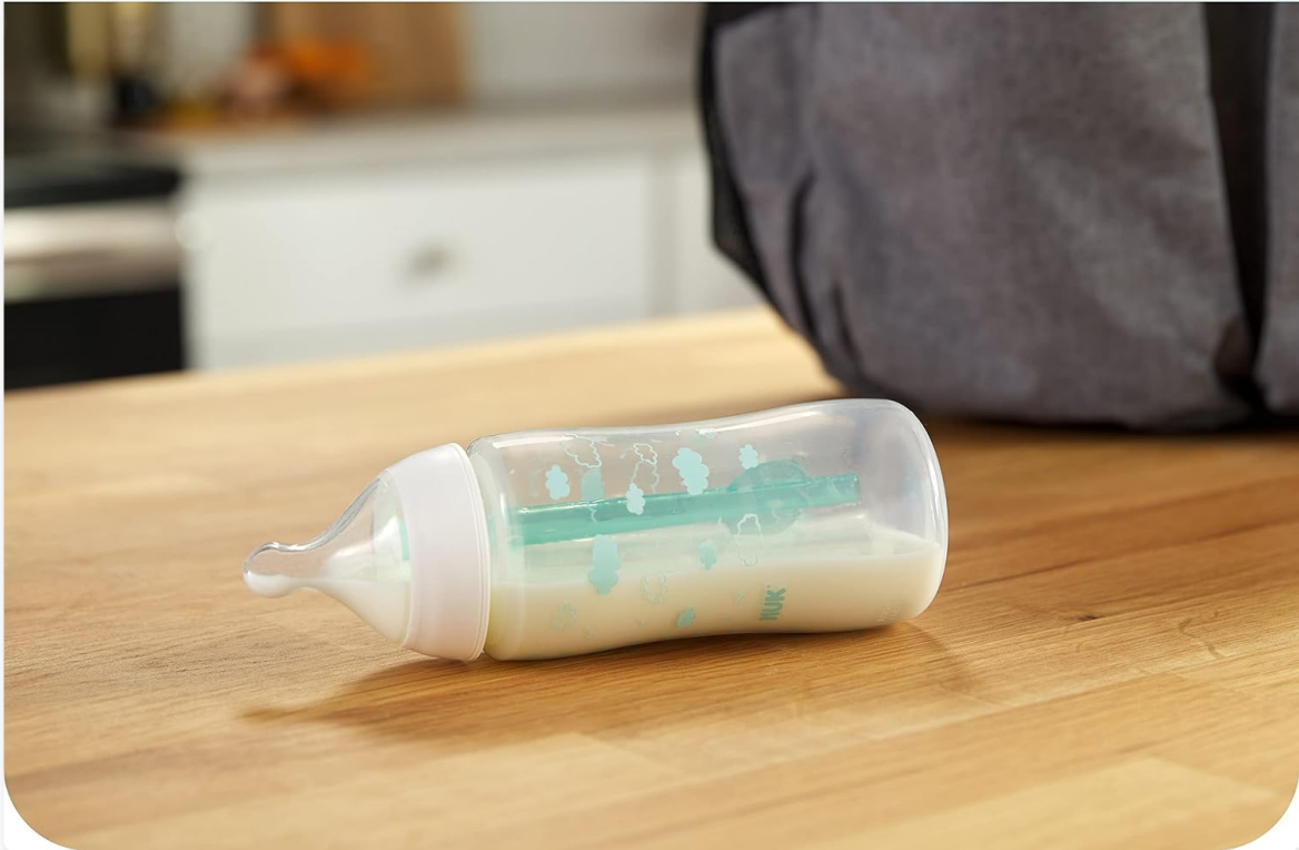
Image: A NUK Smooth Flow Pro bottle lying on its side, demonstrating its leak-proof design thanks to the seamless one-piece nipple and collar.

No leaks, guaranteed, thanks to the seamless 1-piece nipple and collar design