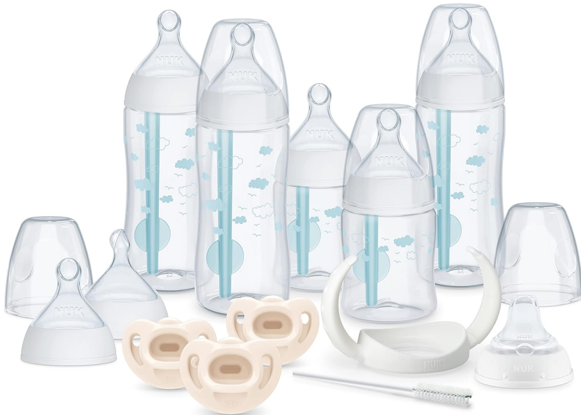
Image: The complete NUK Smooth Flow Pro Anti-Colic Baby Bottle 11 Piece Set, showcasing all included bottles, nipples, pacifiers, and learner cup accessories.