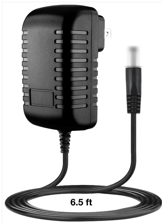
Figure 7.2: The adapter features a 6.5-foot long power cable for flexible placement.