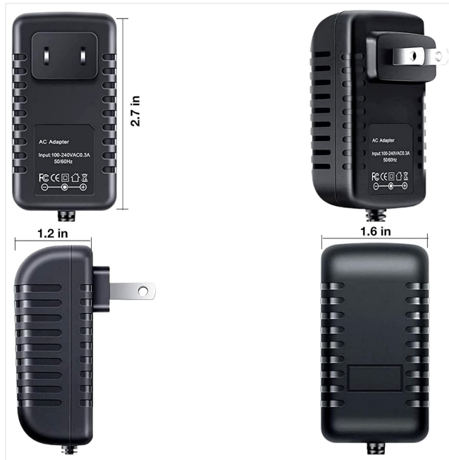
Figure 7.1: Dimensions of the saschedross AC/DC Adapter.