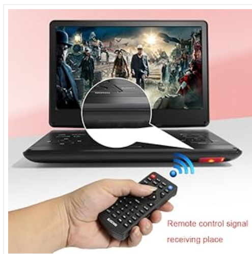
Image 5.5: The remote control sensor is located on the front of the player.

The included remote control provides full functionality for operating the DVD player from a distance. Ensure the remote is pointed towards the player's remote sensor during use.