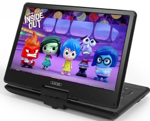
Image 5.2: The screen offers 270-degree rotation and 180-degree flip for flexible viewing.