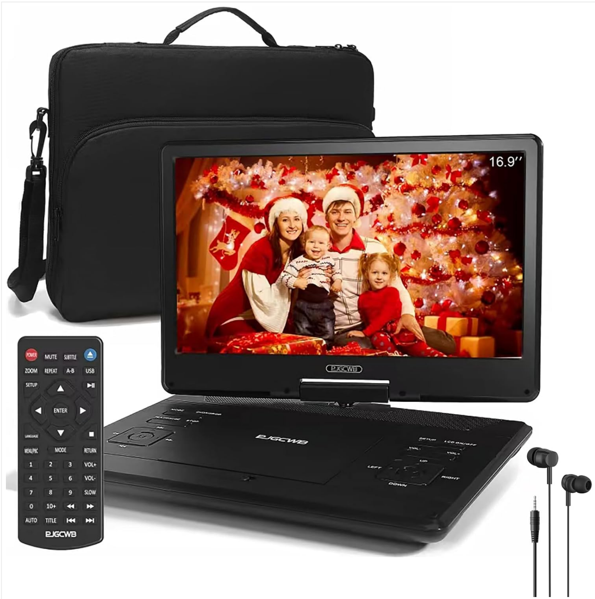
Image 2.1: The P.JGCWB PD-1805 Portable DVD Player shown with its remote control, headphones, and carrying bag.