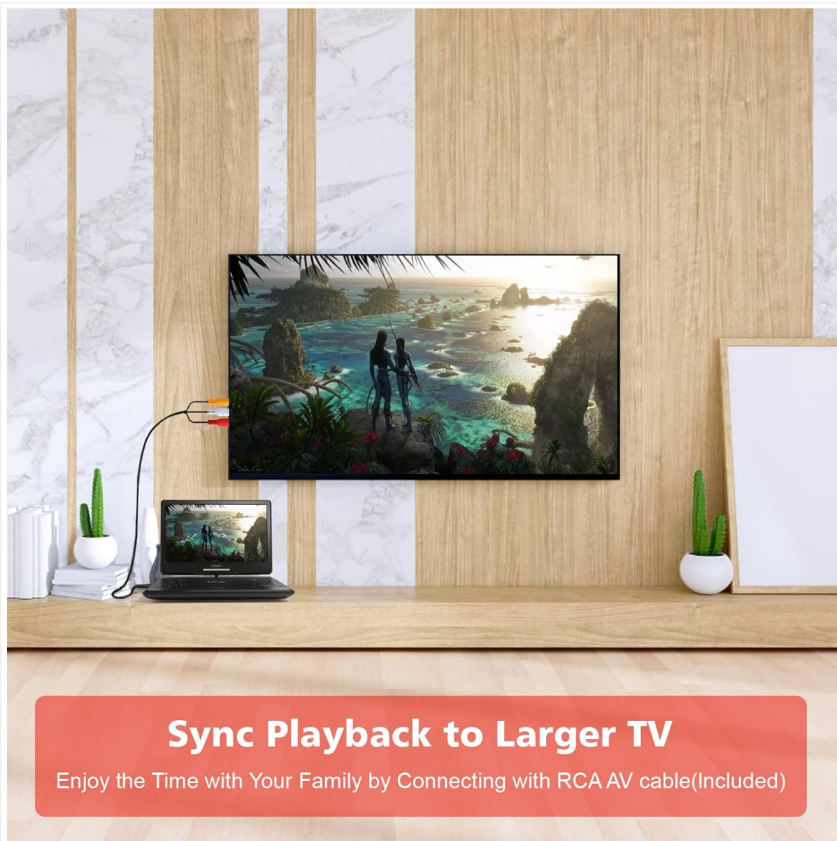
Image 5.3: Connecting the portable DVD player to a larger TV screen using the AV cable.