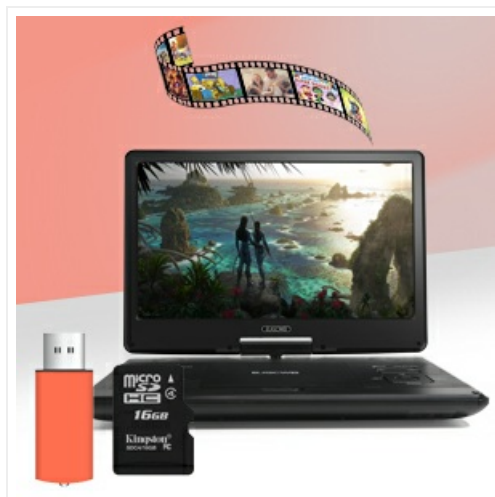
Image 5.1: The player supports media playback from USB drives and SD cards.

Insert a USB flash drive into the USB port or an SD card into the SD card slot. The player will typically prompt you to select the media type (Movie, Music, Photo). Navigate through your files using the control buttons or remote and select the desired content for playback. Supported formats include MP3, WMA, WAV, JPEG, and VOB.