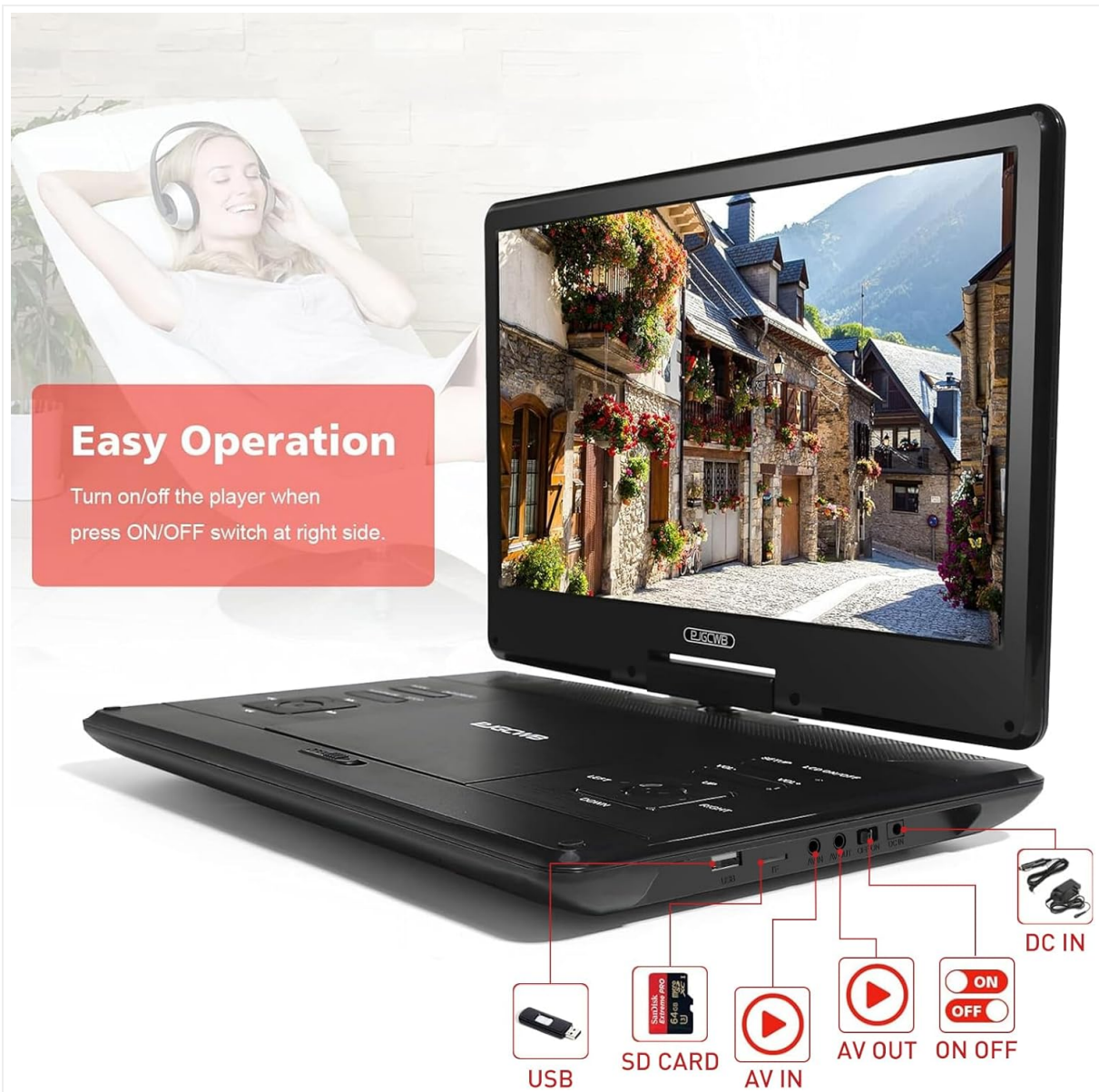
Image 3.1: Side view illustrating the input/output ports and the power switch.