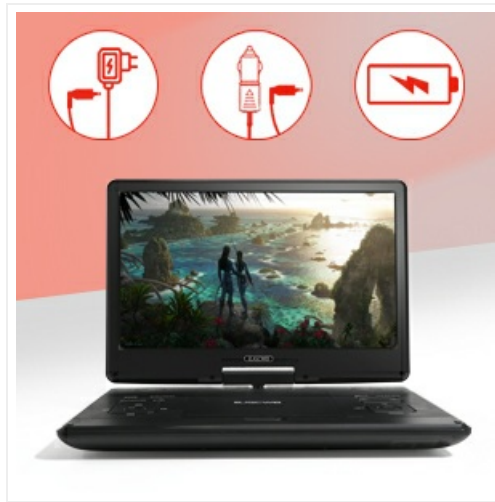
Image 4.1: The player can be powered and charged using the included AC adapter or car charger, or by its internal battery.