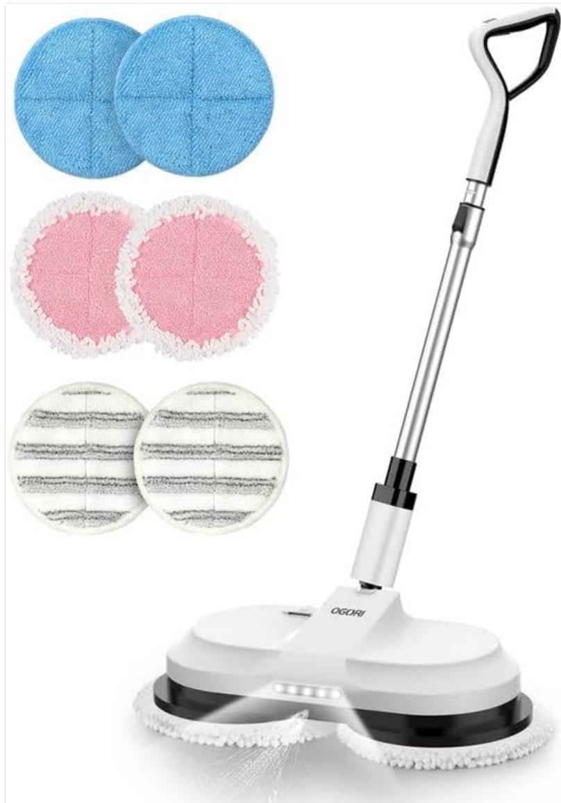
Image: The OGORI Cordless Electric Mop main unit shown with the three types of included mop pads: pink cleaning pads, blue waxing pads, and white scrubby pads.