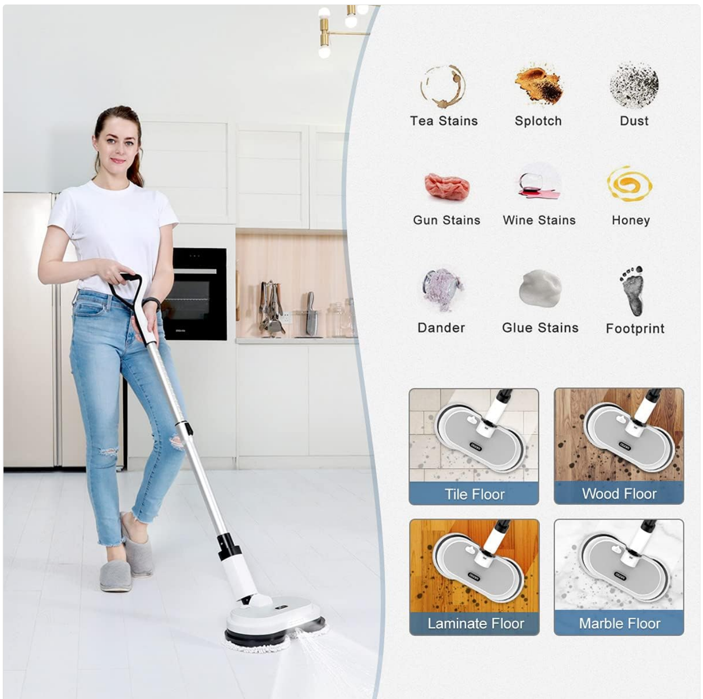
Image: A user operating the OGORI Electric Mop, with an accompanying graphic illustrating its effectiveness against various stains (e.g., tea, splotch, dust, wine) and its suitability for different floor types (tile, wood, laminate, marble).