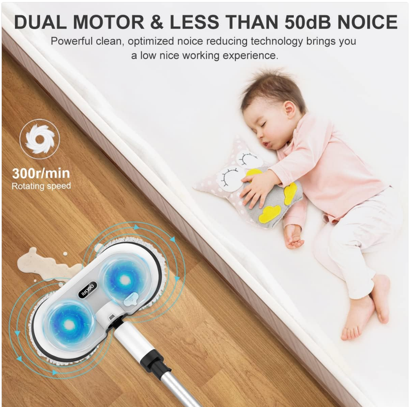
Image: An illustration highlighting the dual powerful motors of the OGORI Electric Mop, emphasizing its 300r/min rotating speed and quiet operation (less than 50dB noise level).

Powerful clean, optimized noise reducing technology brings you a low noise working experience.