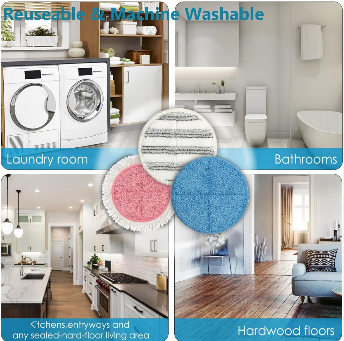
Image: This image showcases the reusability and machine washability of the mop pads, along with examples of different areas and floor types where the mop can be effectively used, such as laundry rooms, bathrooms, kitchens, and hardwood floors.