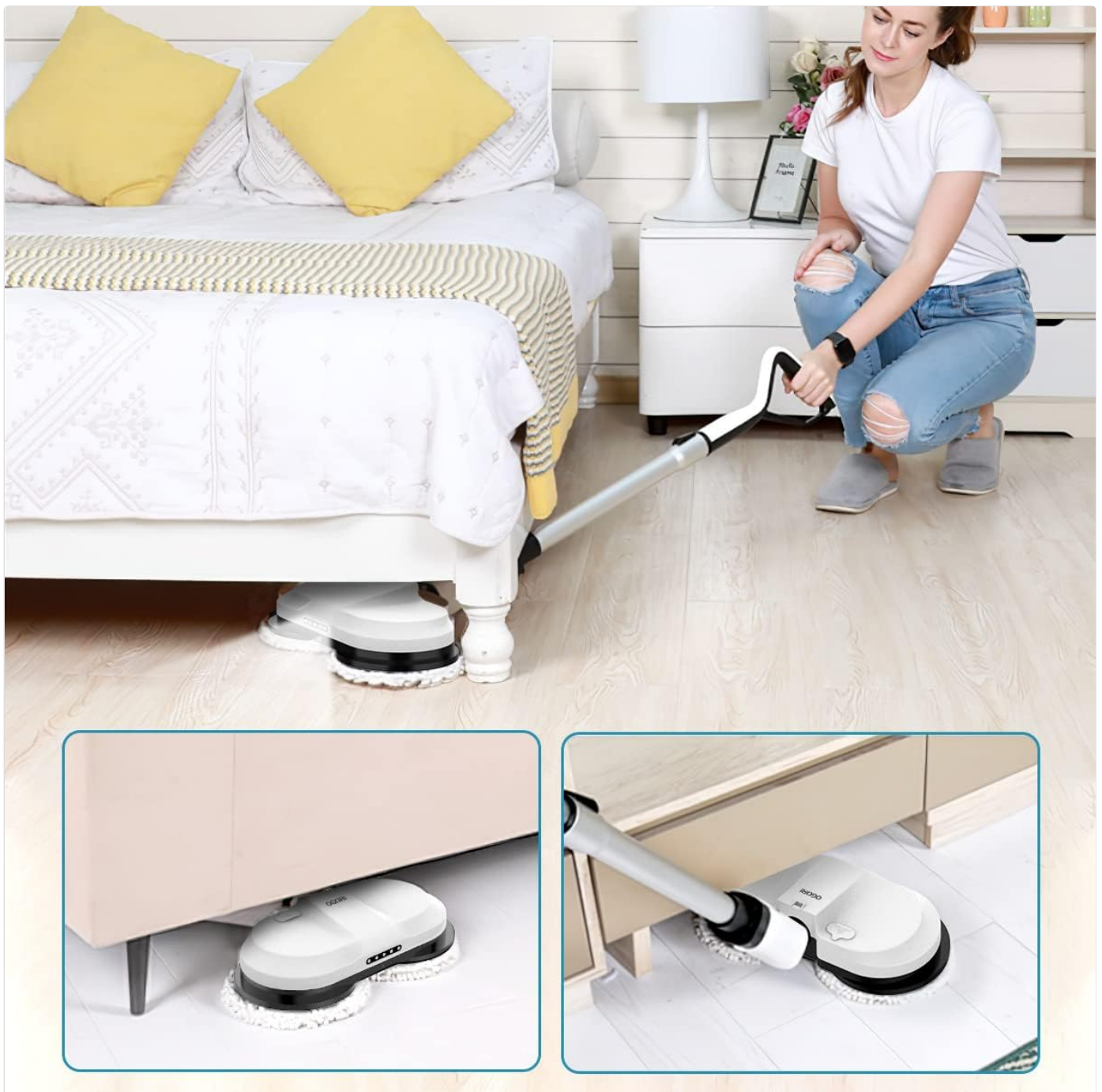
Image: This image illustrates the mop's flexibility, showing it easily reaching and cleaning under a bed and other low-clearance furniture, thanks to its adjustable handle and low-profile design.