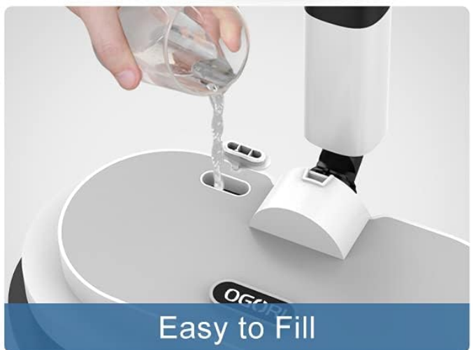
Easy to Fill

Image: This image demonstrates the on-demand spray feature, showing the spray trigger on the handle and a diagram of the 300ml water tank, along with an illustration of how to easily fill it.