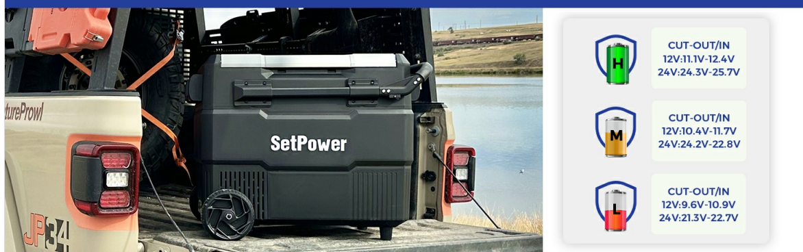
Image Description: This image illustrates the three battery protection levels (H, M, L) of the portable refrigerator, showing the corresponding cut-out/in voltages for 12V and 24V systems. This feature helps prevent over-discharge of the power source, making it suitable for various vehicles.