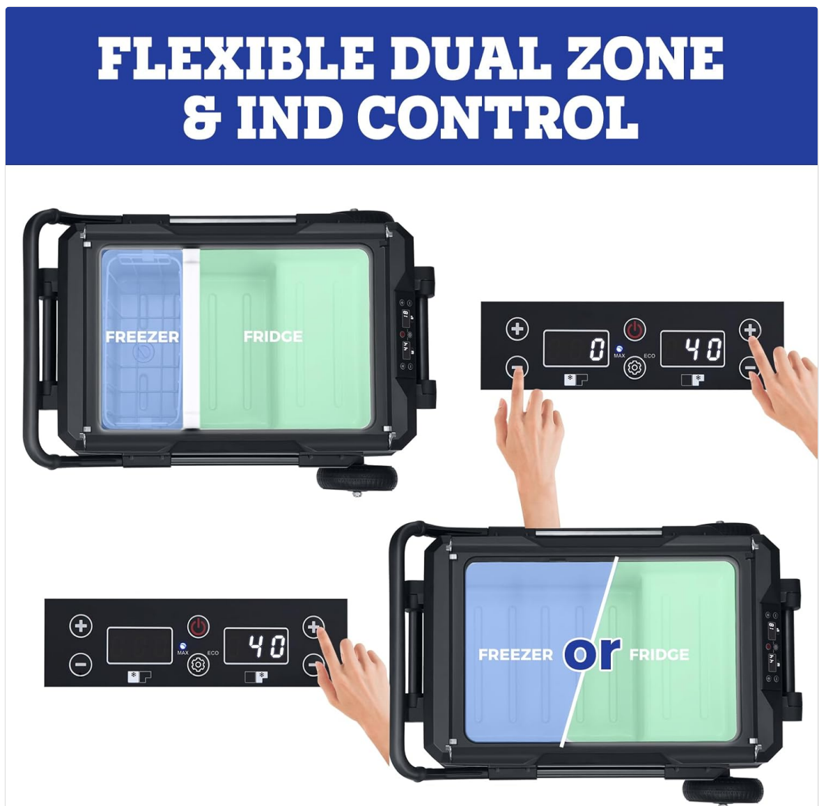
Image Description: This image illustrates the dual-zone functionality and independent temperature control of the Setpower RV45D PRO. It shows the interior divided into 'Freezer' and 'Fridge' sections, with separate digital displays and control buttons for each zone, allowing users to set different temperatures for different compartments.