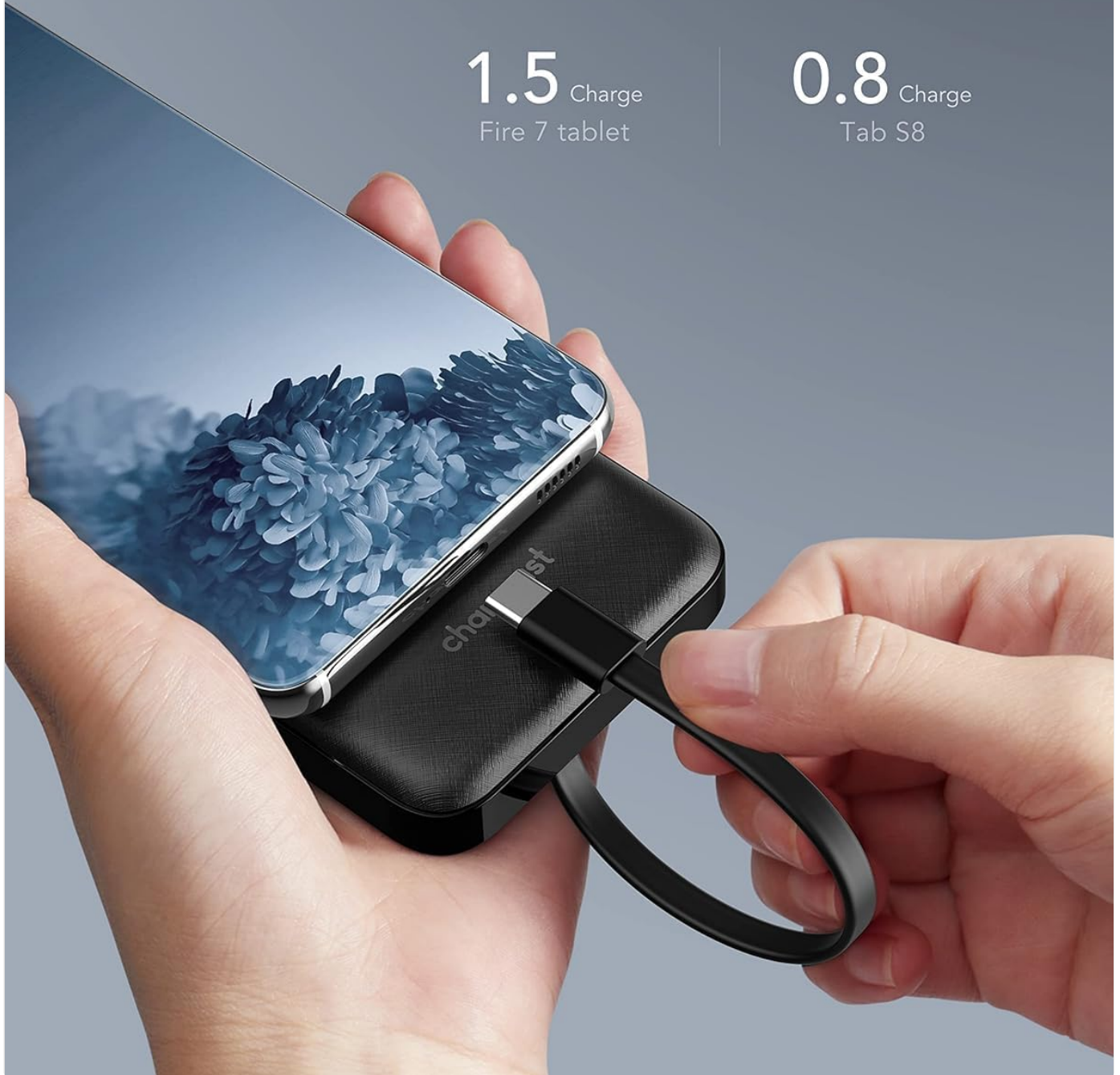
Image: A hand holding the Charmast Power Bank, which is connected via its built-in cable to a smartphone, illustrating its use for portable charging.