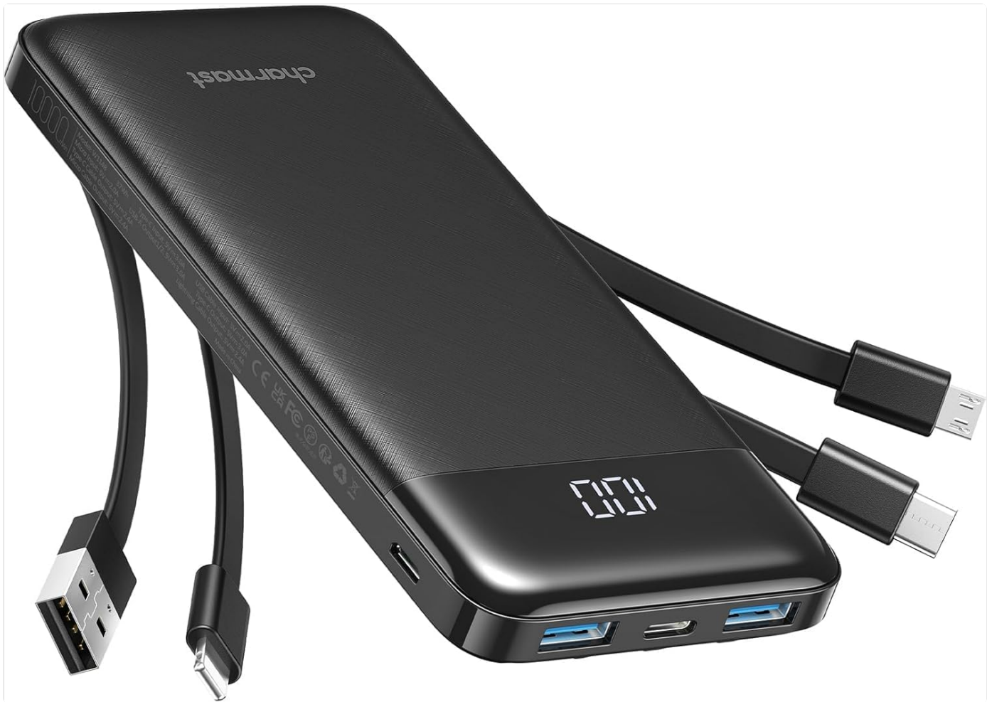
Image: The Charmast 10000mAh Power Bank, showcasing its sleek black design, integrated charging cables, and clear digital LED display.