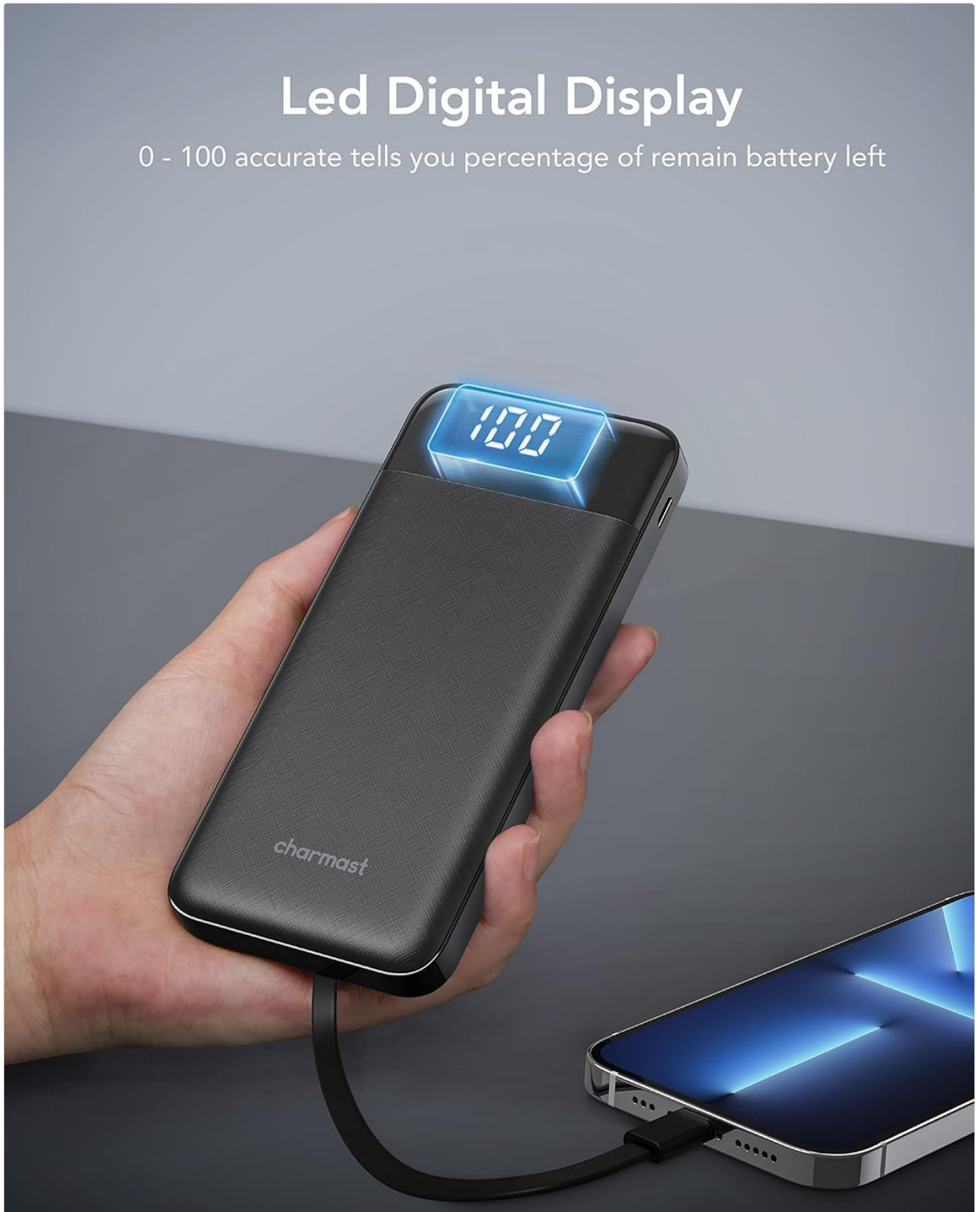
Image: The Charmast Power Bank held in hand, with its LED digital display clearly showing "100", indicating a full charge.

2. Full Charge Indication: The LED display will show "100" when the power bank is fully charged.