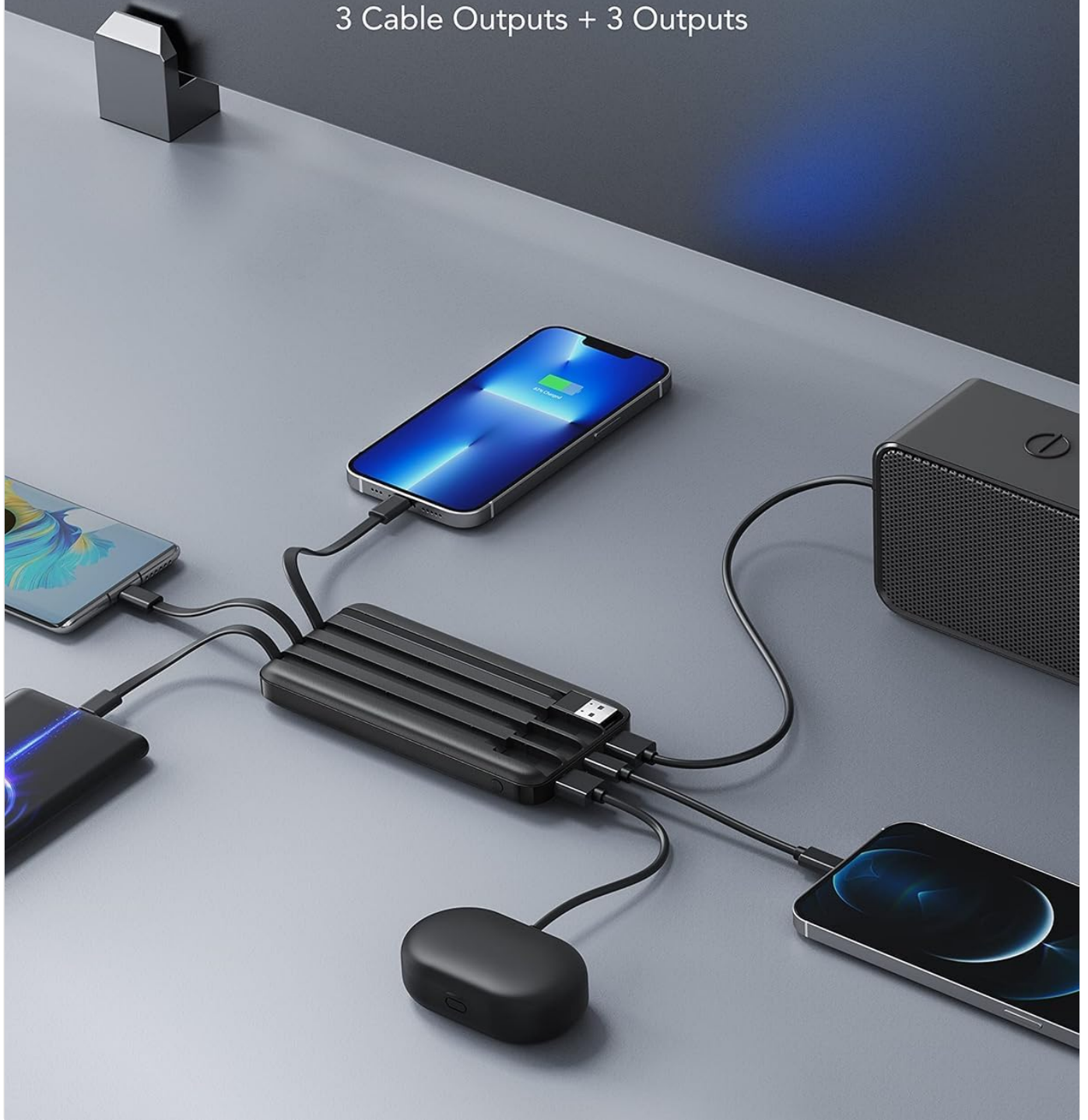
Image: An overhead view showing the Charmast Power Bank connected to and simultaneously charging multiple electronic devices, including smartphones and a speaker, demonstrating its multi-output capability.