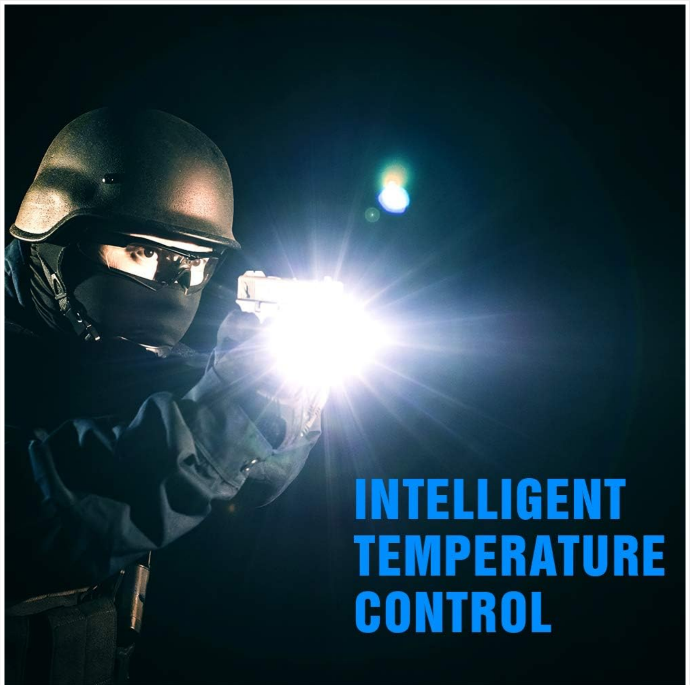
Figure 7: The compact size of the GM23 Pistol Light, easily held in one hand.