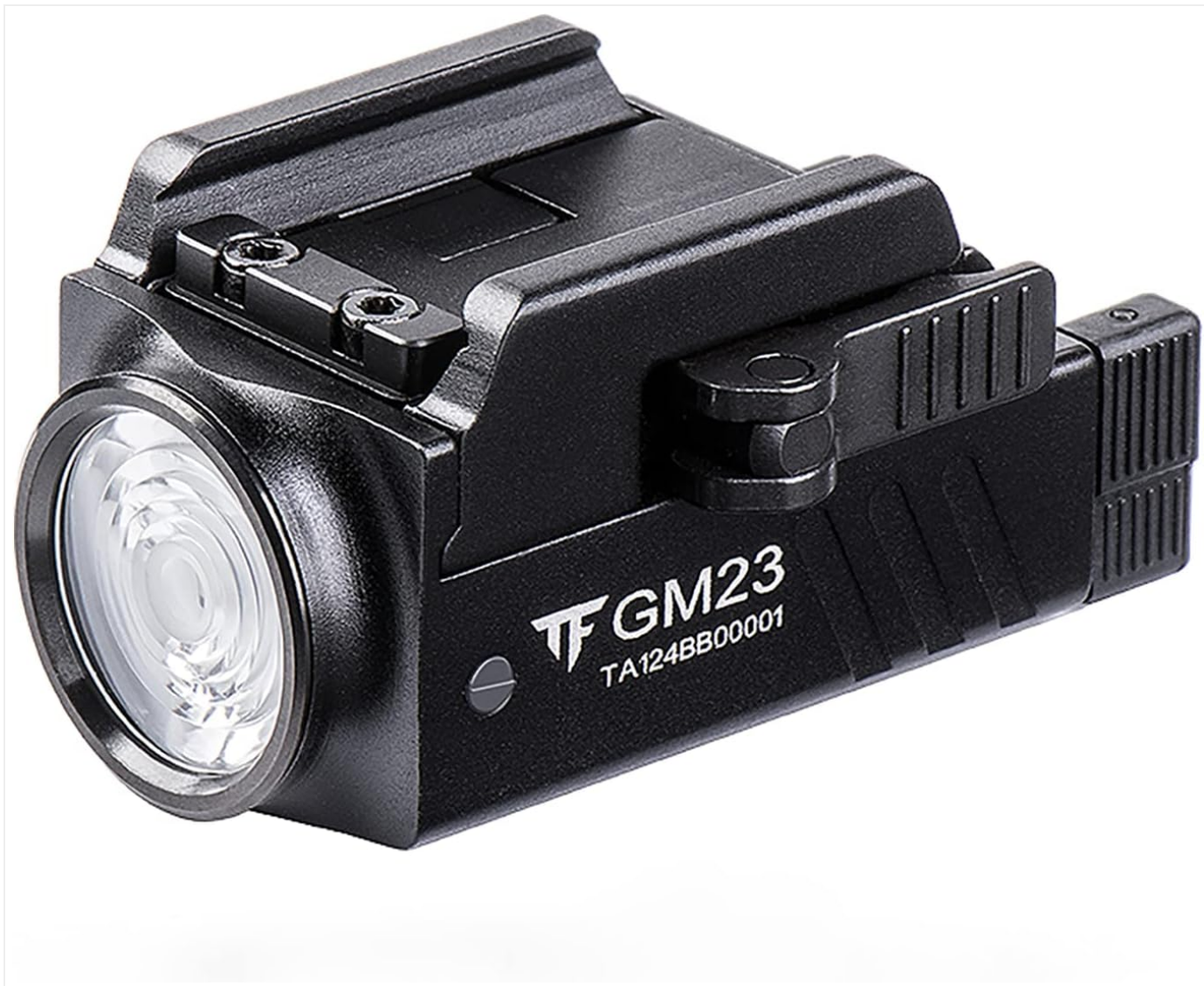
Figure 1: TrustFire GM23 Pistol Light, showcasing its compact design and integrated rail mount.