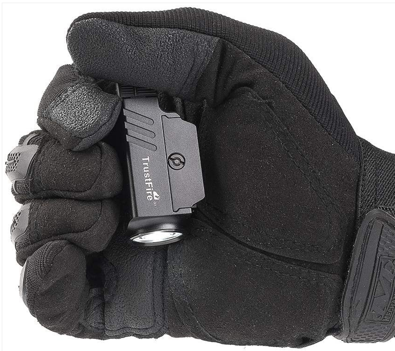
Figure 6: The GM23's intelligent temperature control system maintaining optimal performance during operation.