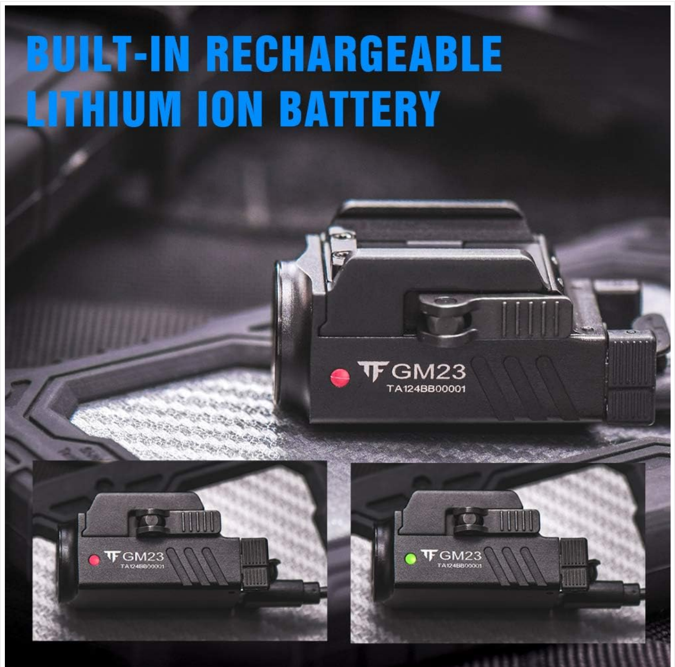
Figure 4: The GM23's built-in rechargeable battery and charge indicator light.