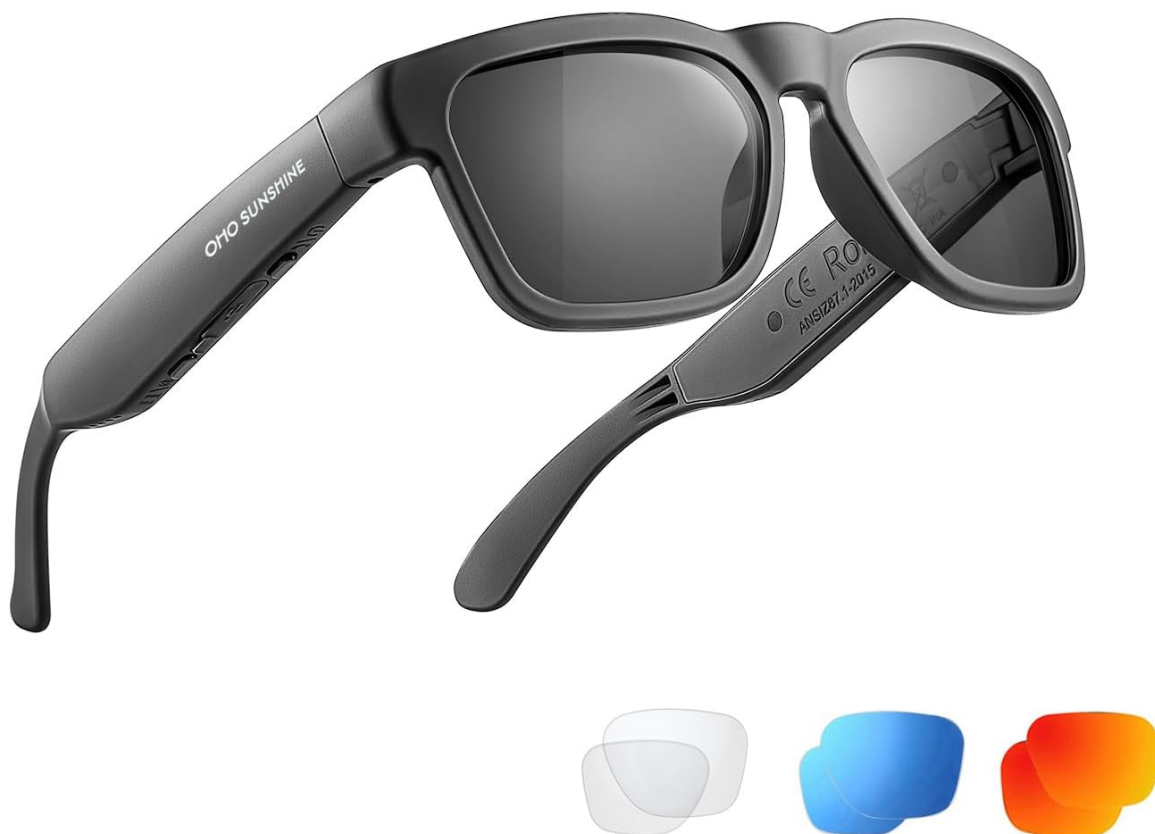
Figure 1: OhO Smart Glasses (Black Frame-black Lens) with included clear, blue, and orange interchangeable lenses.

Thank you for choosing OhO Smart Glasses. These innovative glasses combine stylish polarized sunglasses with advanced Bluetooth audio technology, allowing you to enjoy music, make calls, and use voice control hands-free. This manual provides essential information for setting up, operating, and maintaining your new smart glasses.