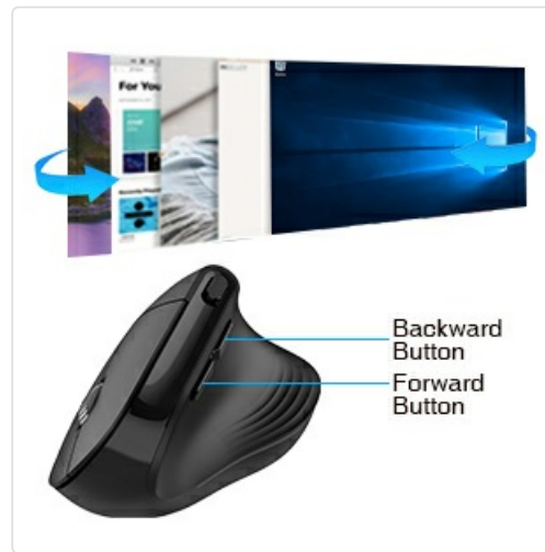
Figure 6: Visual representation of the Forward and Backward buttons and their function for navigation.

The mouse is equipped with dedicated Forward and Backward buttons on its side (refer to Figure 1). These buttons are designed to enhance web browsing efficiency, allowing you to navigate web pages quickly. Note: Forward/Backward buttons are not compatible with MAC OS. All buttons are non-programmable.