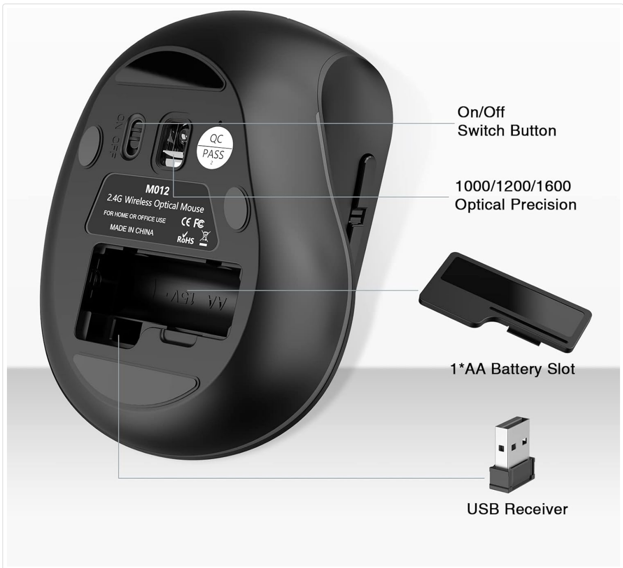
Figure 2: Underside view of the mouse, highlighting the On/Off Switch Button, 1*AA Battery Slot, and the storage location for the USB Receiver.