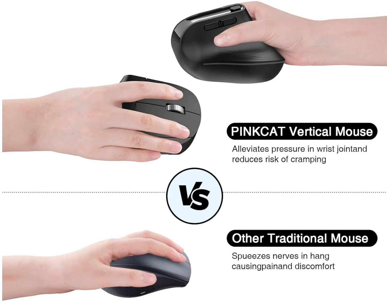
Figure 4: Visual comparison demonstrating the natural, ergonomic grip of the PINKCAT Vertical Mouse compared to a traditional mouse, highlighting wrist posture.

Supports palm and eliminates wrist strain