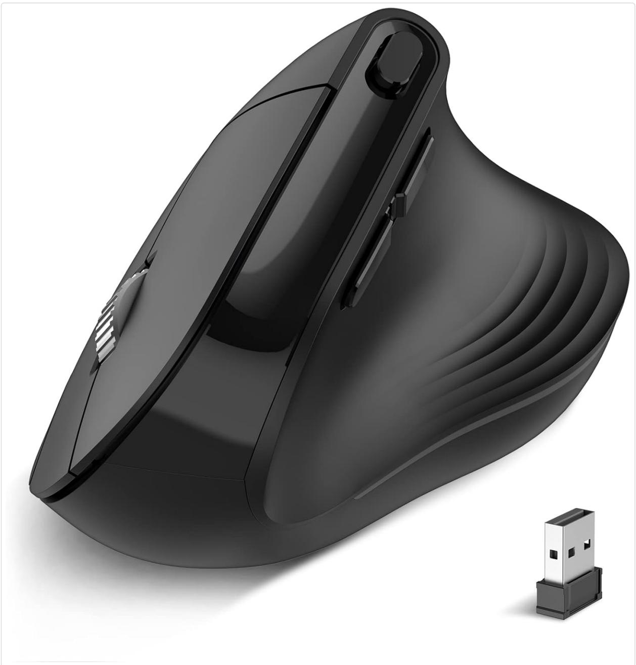
Figure 3: The PINKCAT Wireless Vertical Mouse and its accompanying USB receiver, ready for connection.