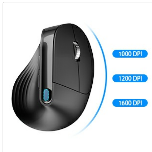
Figure 5: Illustration of the three adjustable DPI settings (1000, 1200, 1600) and how to switch between them using the DPI button.

The mouse features three adjustable DPI (Dots Per Inch) levels: 1000, 1200, and 1600. DPI controls the sensitivity of the mouse cursor movement. To switch between DPI settings, press the DPI Switch Button located on the side of the mouse (refer to Figure 1). Each press will cycle through the available DPI levels.