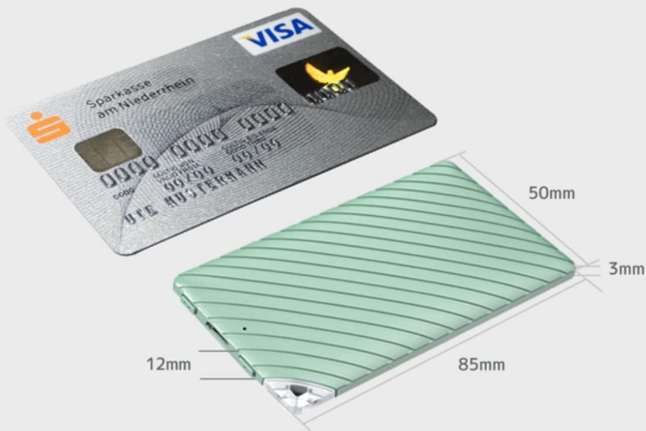
Image: Dimensions of the Bocoice Blade Speaker compared to a credit card.