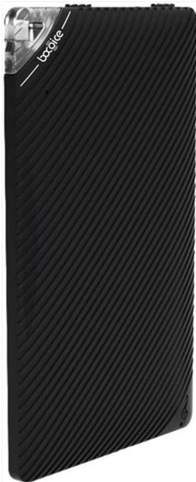
Image: The Bocoice Blade Speaker, a sleek, thin black rectangular device.