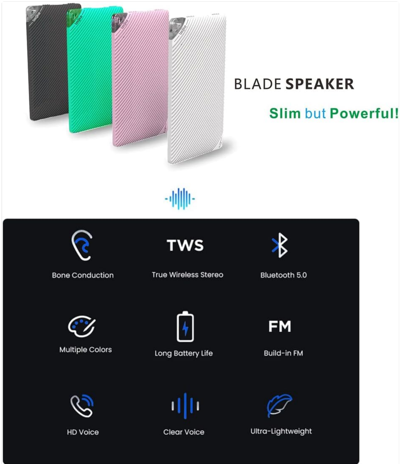
Image: An overview of the Bocoice Blade Speaker's key features, including its various color options and technological capabilities.