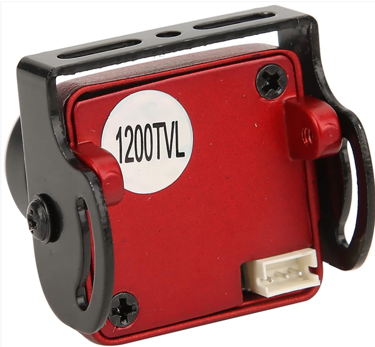
Figure 4: Rear view of the camera showing connection points.