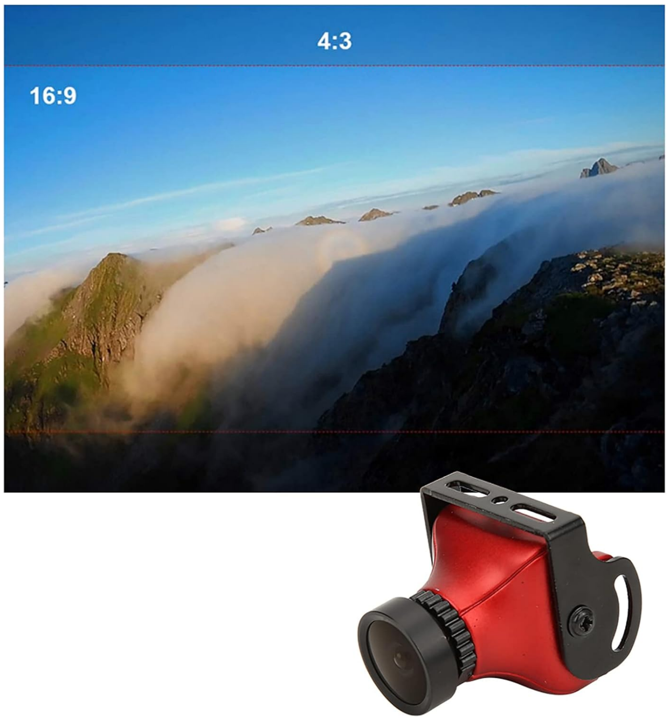
Figure 2: Camera view demonstrating 4:3 aspect ratio for clear imaging.