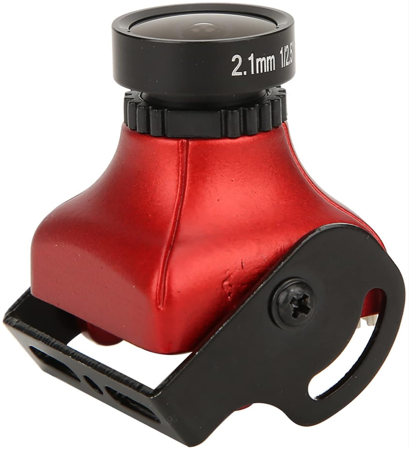
Figure 6: Close-up of the camera lens (2.1mm).