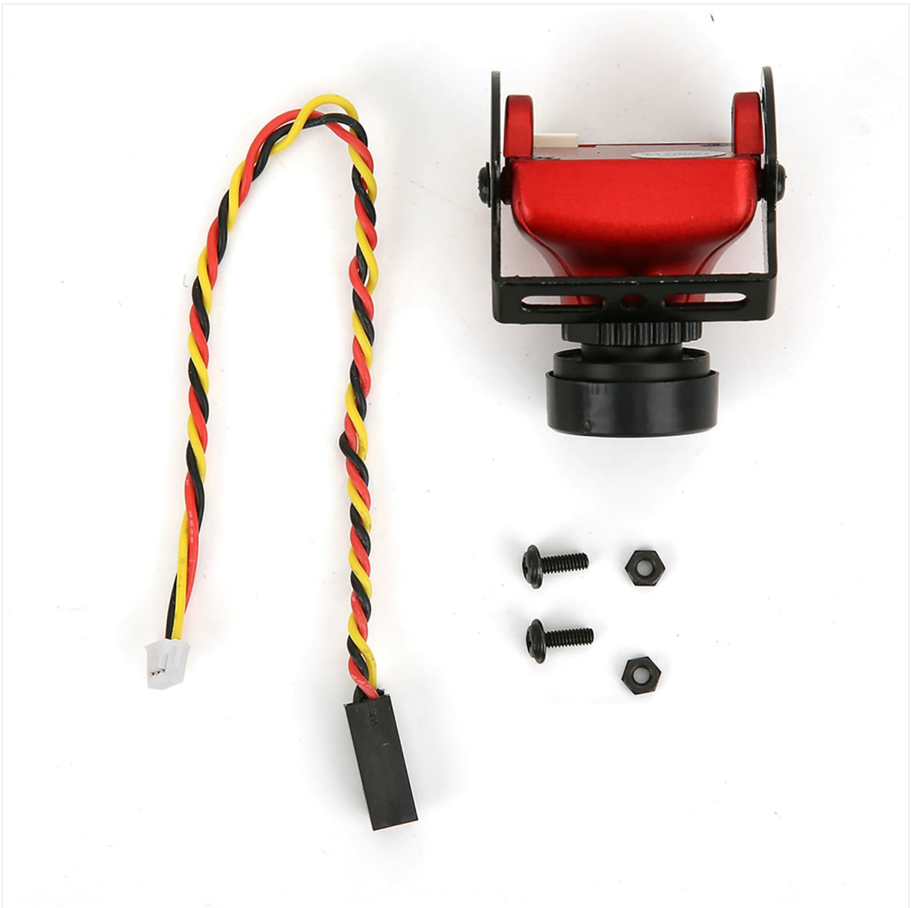
Figure 1: Astibym RC Drone Camera, front view.