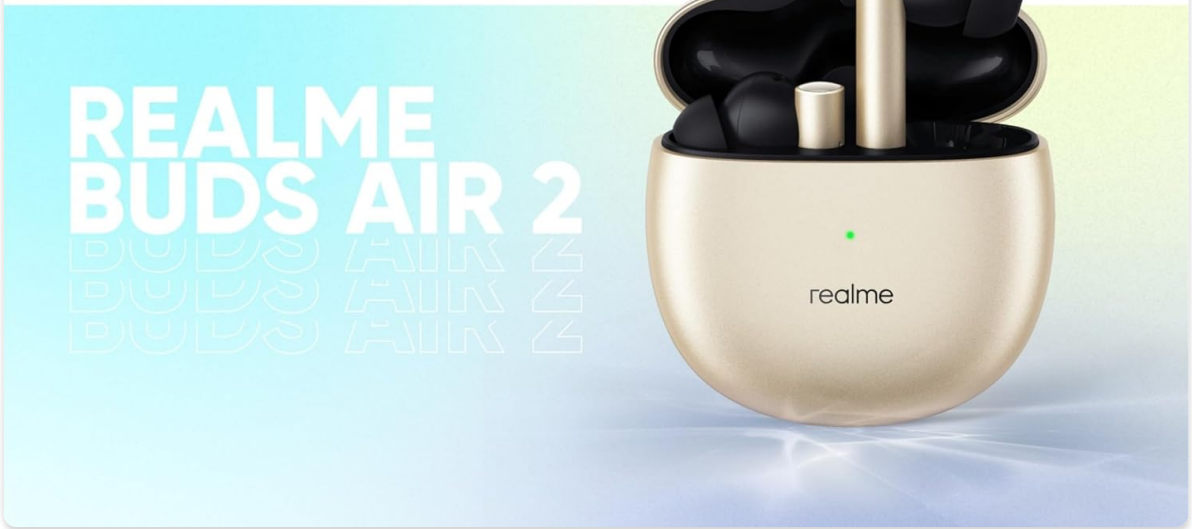
Image: An infographic summarizing the key features of the realme Buds Air 2, including ANC, battery life, driver size, and water resistance.