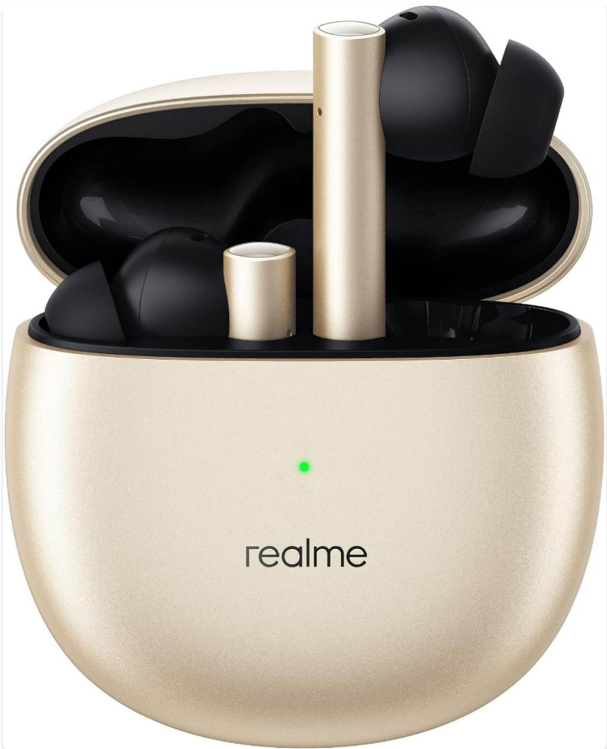
Image: realme Buds Air 2 earbuds in their charging case, presented in a gold color variant.