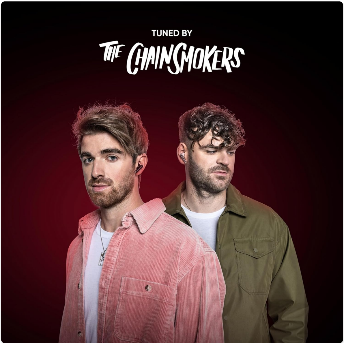
Image: A person wearing realme Buds Air 2, illustrating the smart wear detection feature.