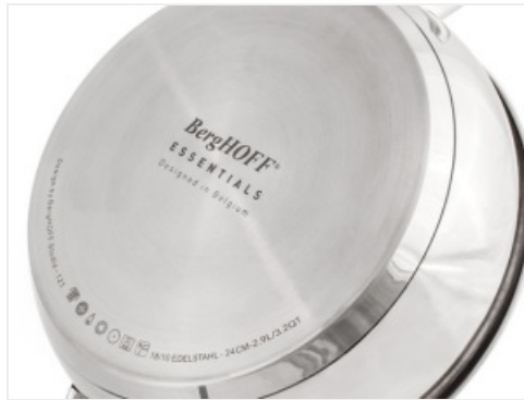
Image: The multi-layered base of the skillet, designed for even heat distribution and compatibility with various cooktops, including induction.