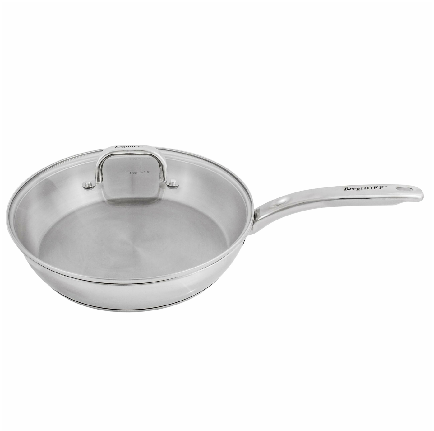
Image: The Berghoff Belly Shape 18/10 Stainless Steel 10.5-inch Skillet with its glass lid, showcasing its ergonomic handle and mirror finish.