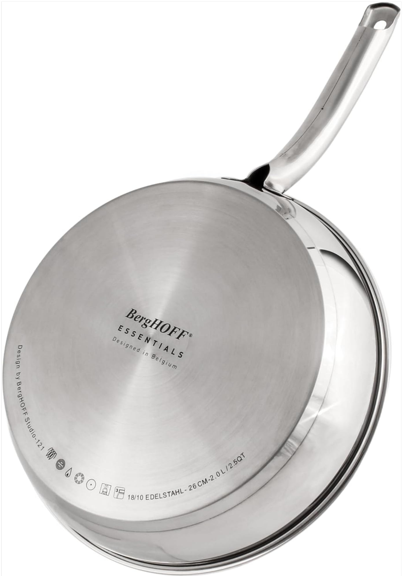
Image: The underside of the Berghoff Belly Shape Skillet, displaying brand information and key specifications like material and capacity.