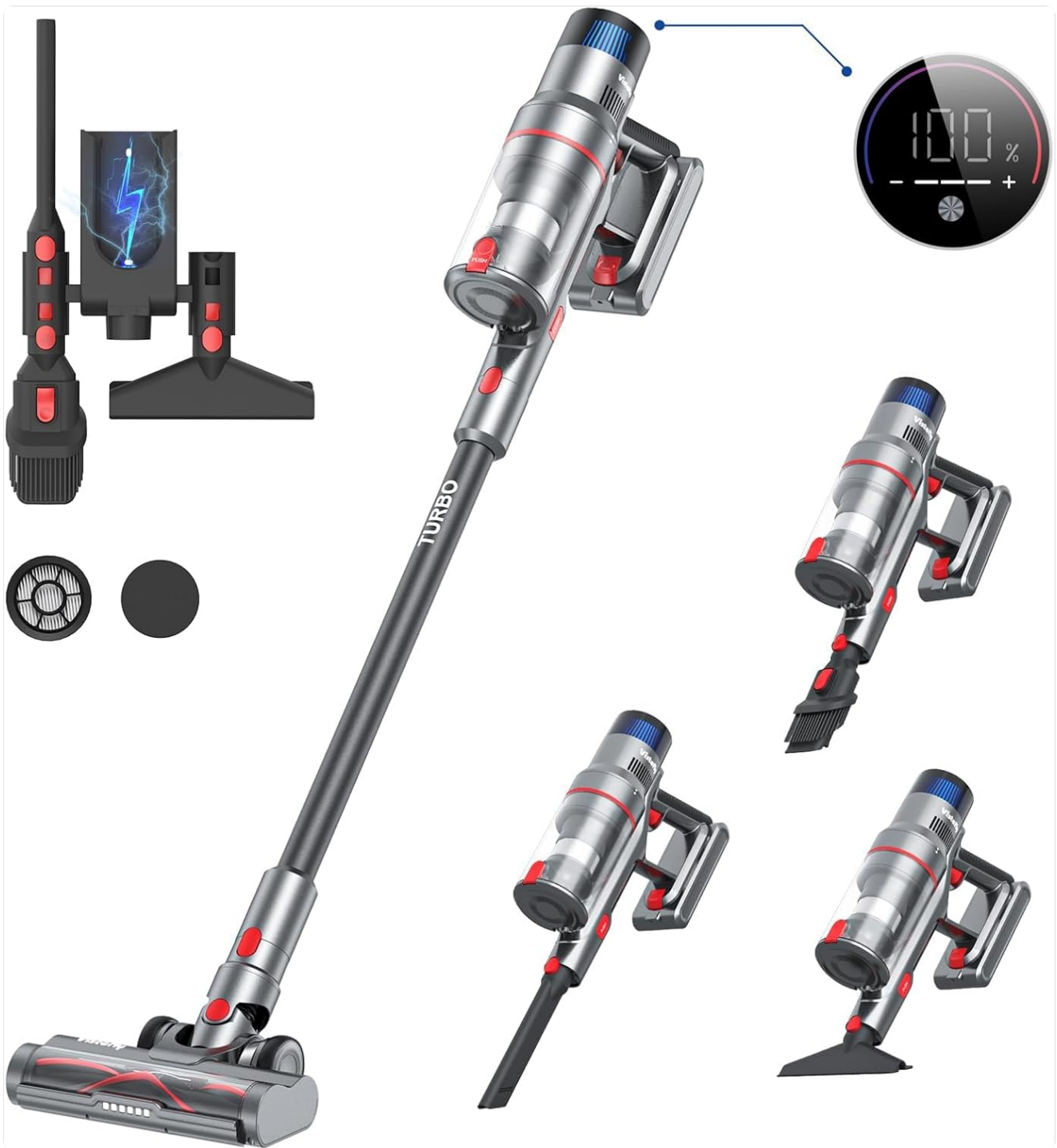
Image: The Vistefly V15 Cordless Vacuum Cleaner shown with its main body, extension wand, floor brush, and various attachments, demonstrating its versatile configurations for different cleaning needs.