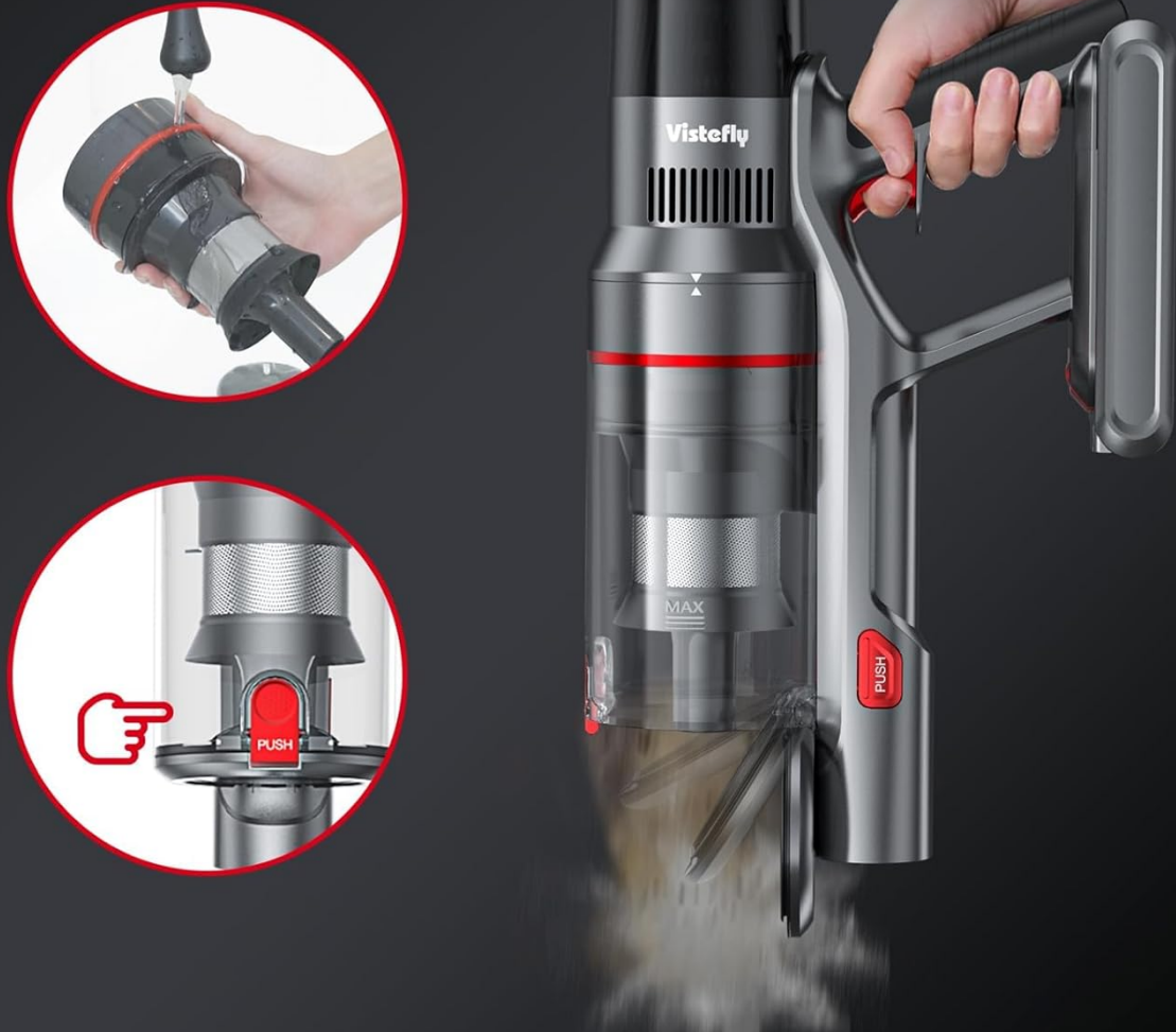
Image: A hand demonstrating the removal and cleaning of the Vistefly V15's filter components, emphasizing the ease of maintenance for sustained performance.