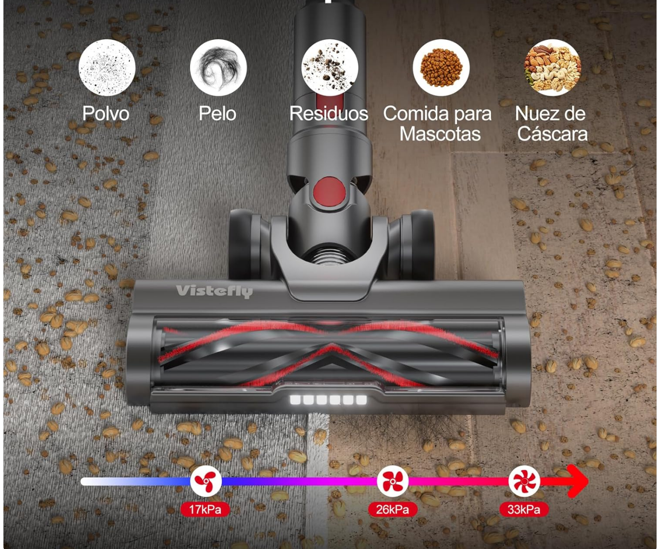
Image: The Vistefly V15's floor head effectively cleaning different types of debris, including dust, hair, crumbs, pet food, and nut shells, showcasing its strong suction capabilities.