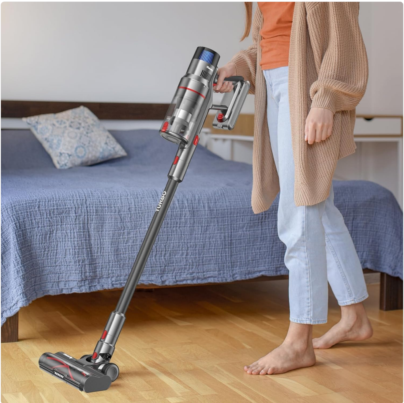
Image: The Vistefly V15's floor head demonstrating its flexible 90-degree vertical and 180-degree horizontal rotation, allowing for easy maneuverability under furniture and around obstacles.