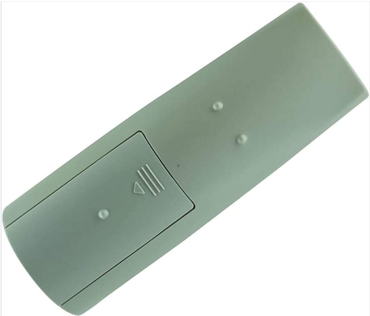
Figure 2.1: Back of the remote control with the battery cover in place.