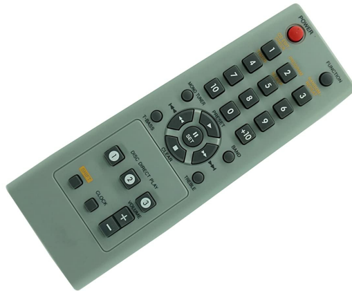
Figure 3.1: Front view of the remote control with its buttons.