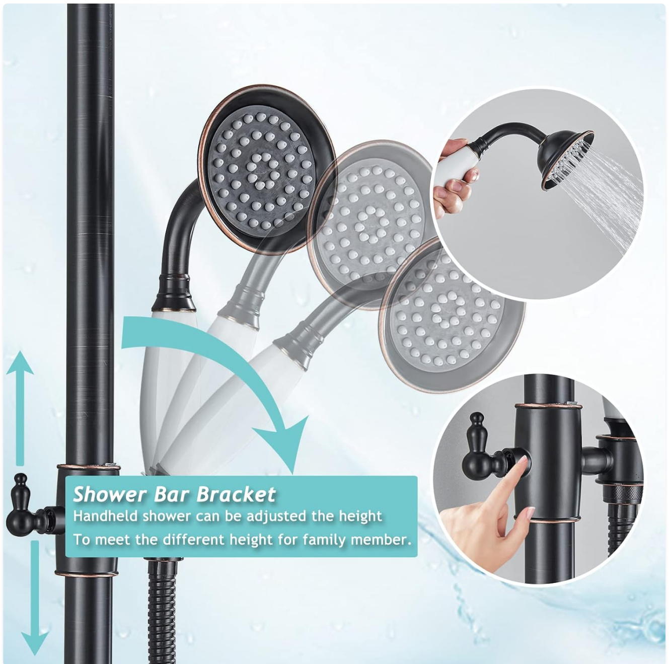
Image: Illustration demonstrating the adjustable shower bar bracket for the handheld shower.

Your browser does not support the video tag.