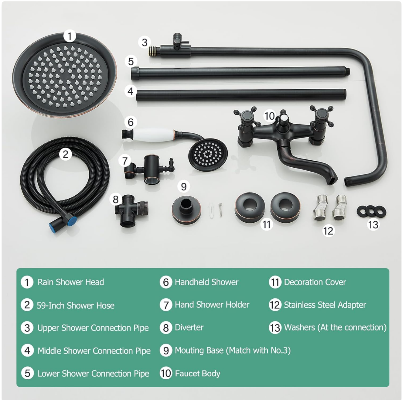
Image: Exploded view diagram showing all included parts of the Gmusre shower system with corresponding labels.