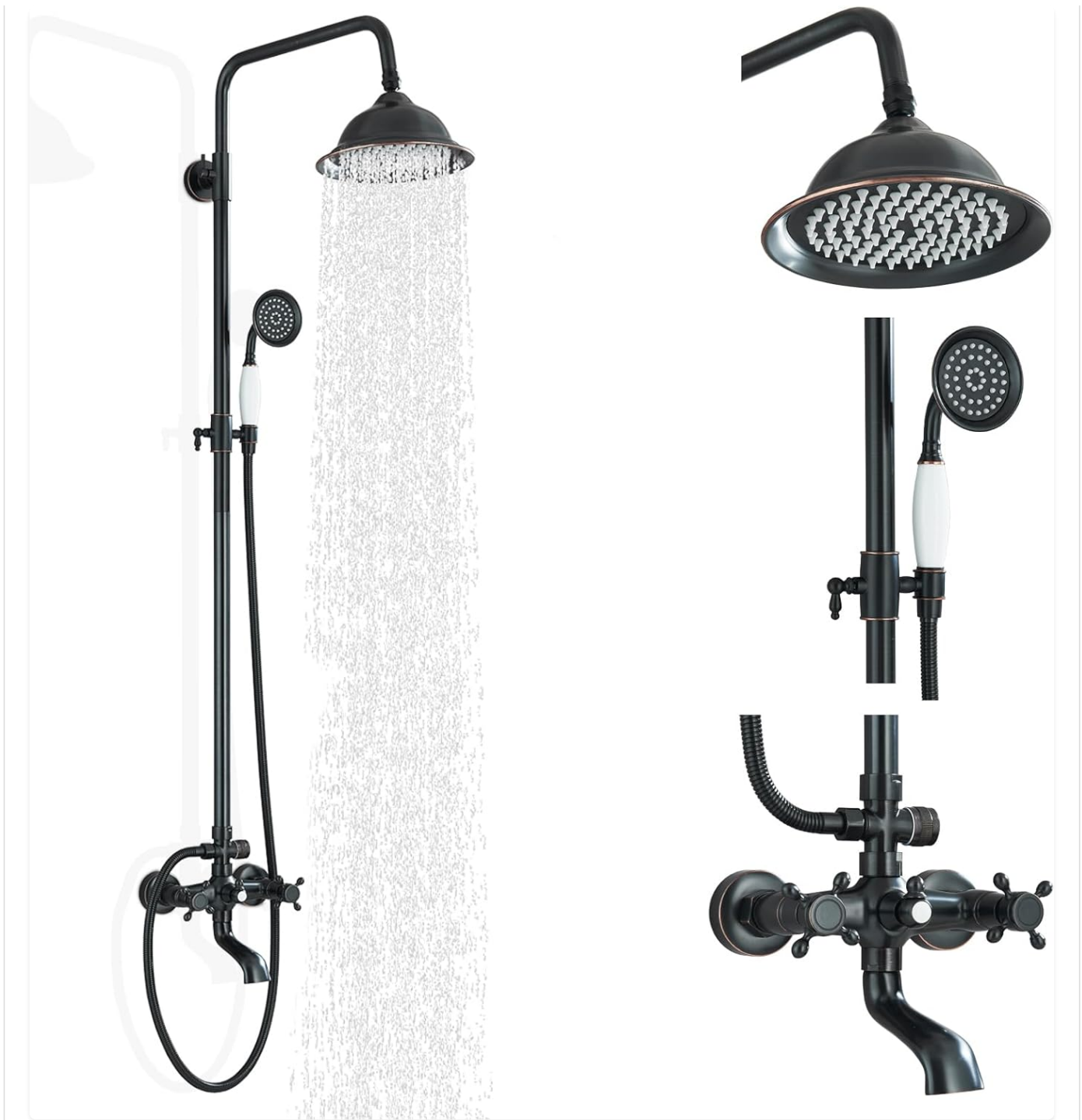
Image: The Gmusre Outdoor Shower Fixtures Oil Rubbed Bronze Shower System, showcasing the rainfall head, handheld spray, and tub spout.