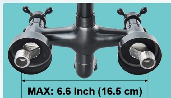
Image: Diagram detailing the product dimensions of the Gmusre shower system.