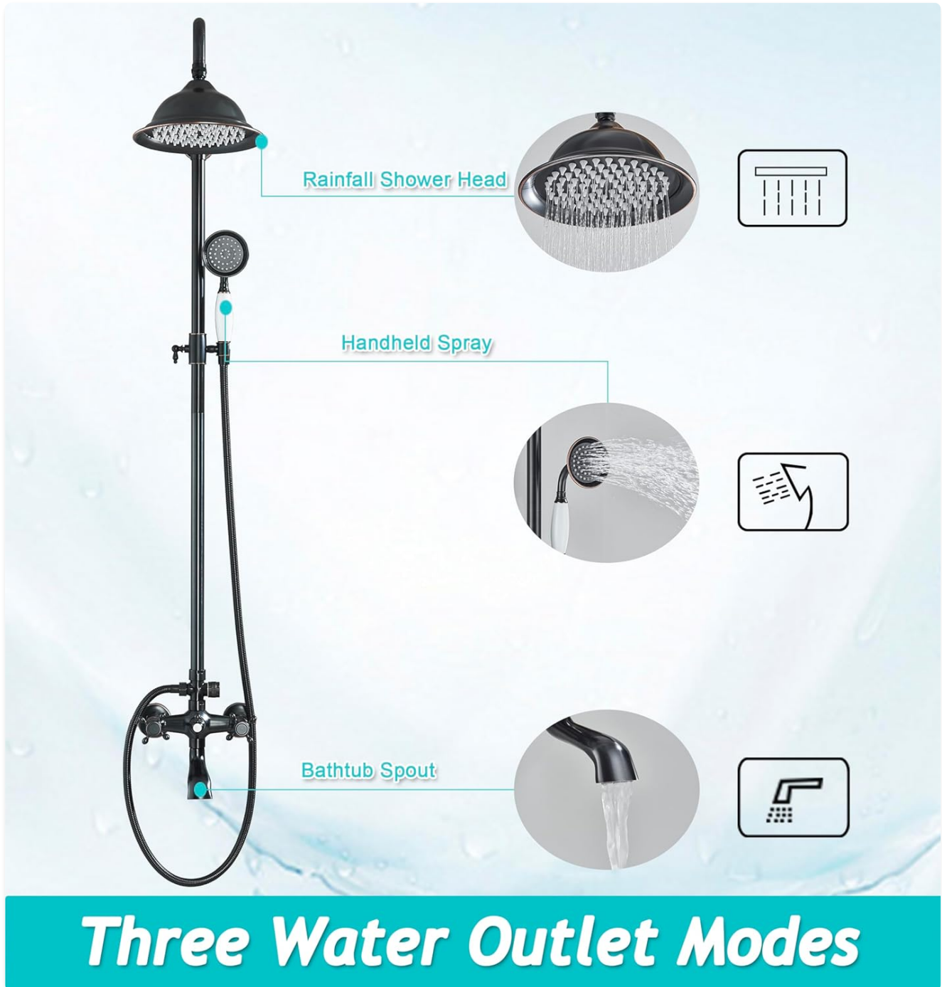
Image: Diagram illustrating the three water outlet modes: rainfall shower head, handheld spray, and bathtub spout.