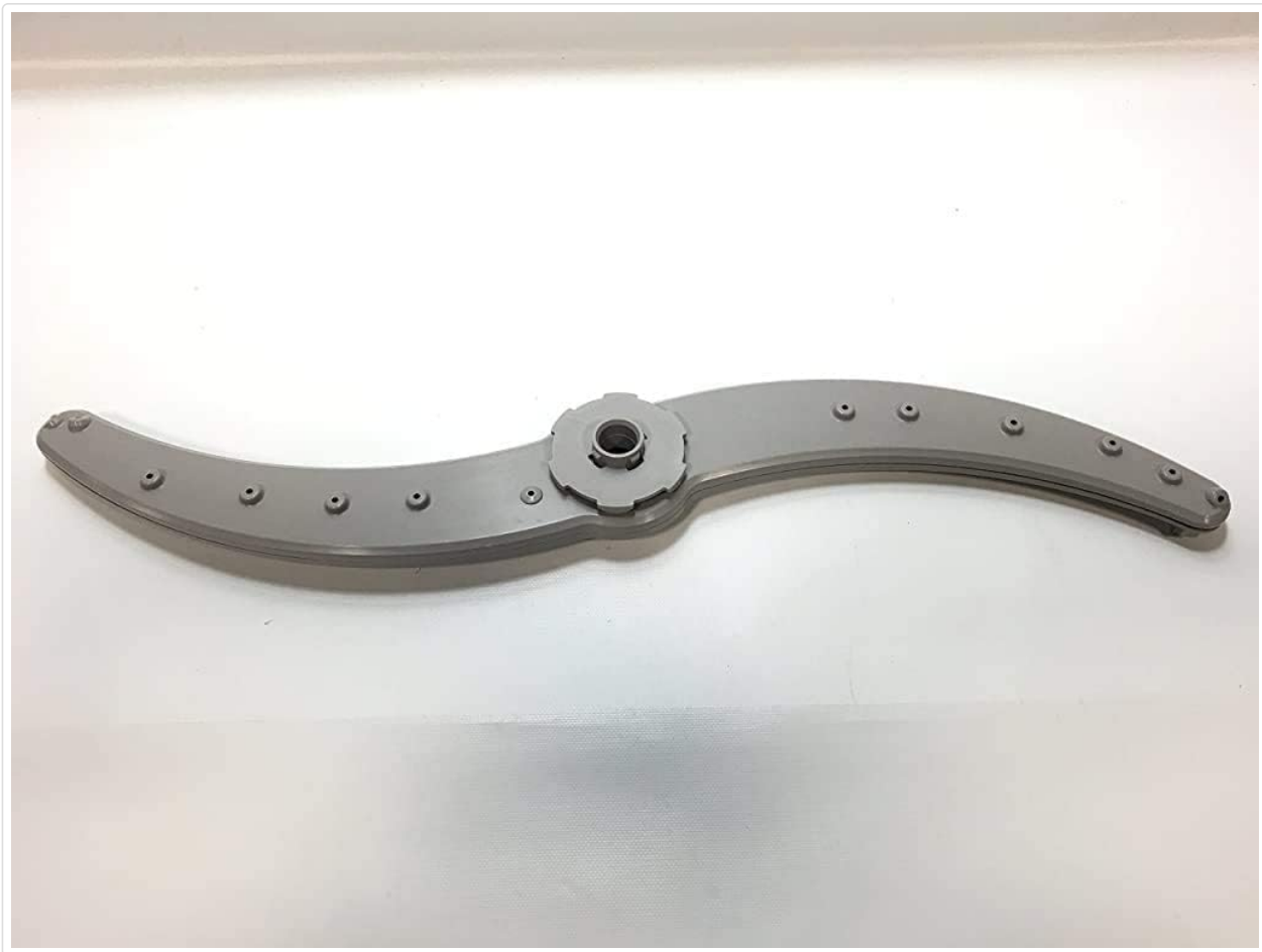
Figure 4: The spray arm's design ensures optimal water coverage.