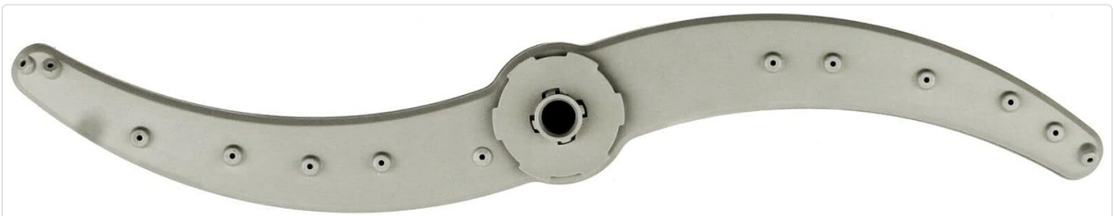
Figure 1: Amesias WD22X26622 Dishwasher Spray Arm.

This manual provides instructions for the installation, maintenance, and troubleshooting of the Amesias WD22X26622 Dishwasher Spray Arm. This replacement part is designed for specific GE dishwasher models and is compatible with original part numbers WD22X27740, WD35X10393, WD22X10089, and WD22X33498.