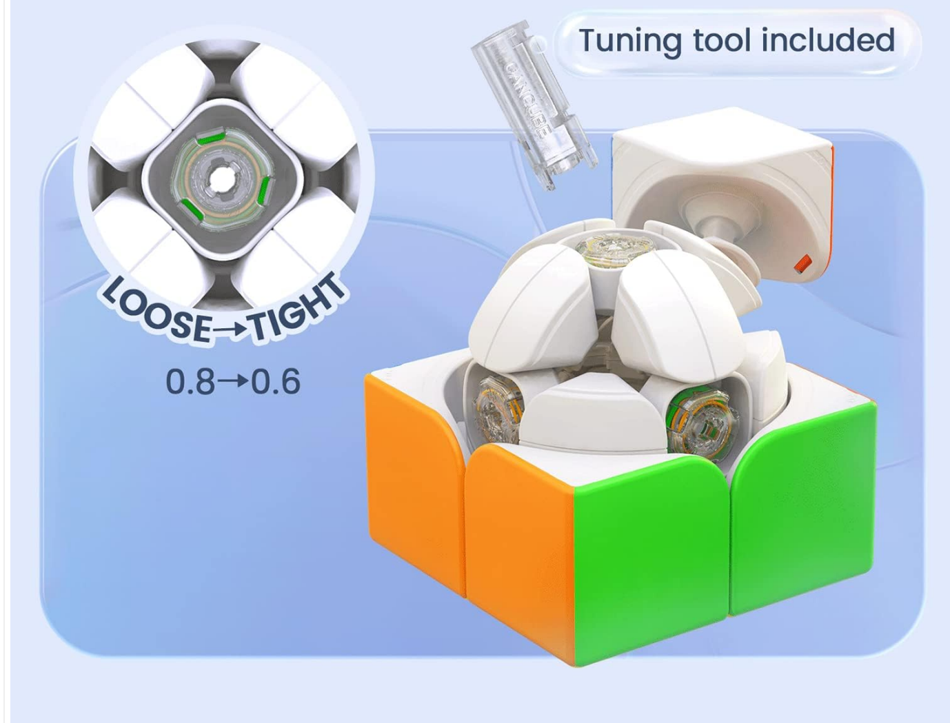
Figure 3: Illustration of the Numerical Tension Nuts (GES+) system, showing how to adjust the cube's tension from loose to tight using the included tuning tool.

Special design for all levels speed cube player. To find your perfect hand feeling.