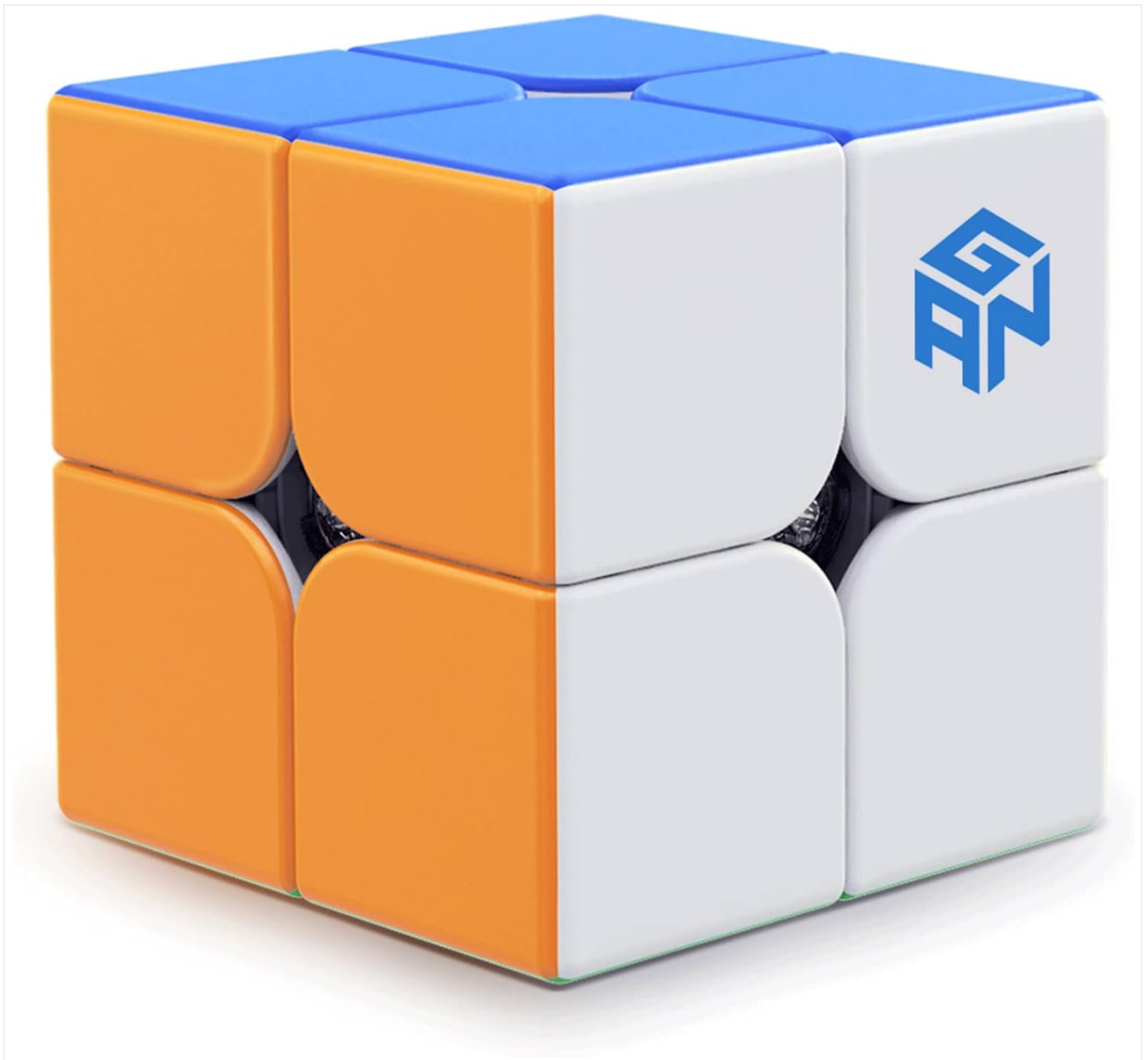
Figure 1: The GAN 251 V2 Speed Cube, showing its stickerless design with blue, orange, and white faces visible. The GAN logo is present on one of the white faces.