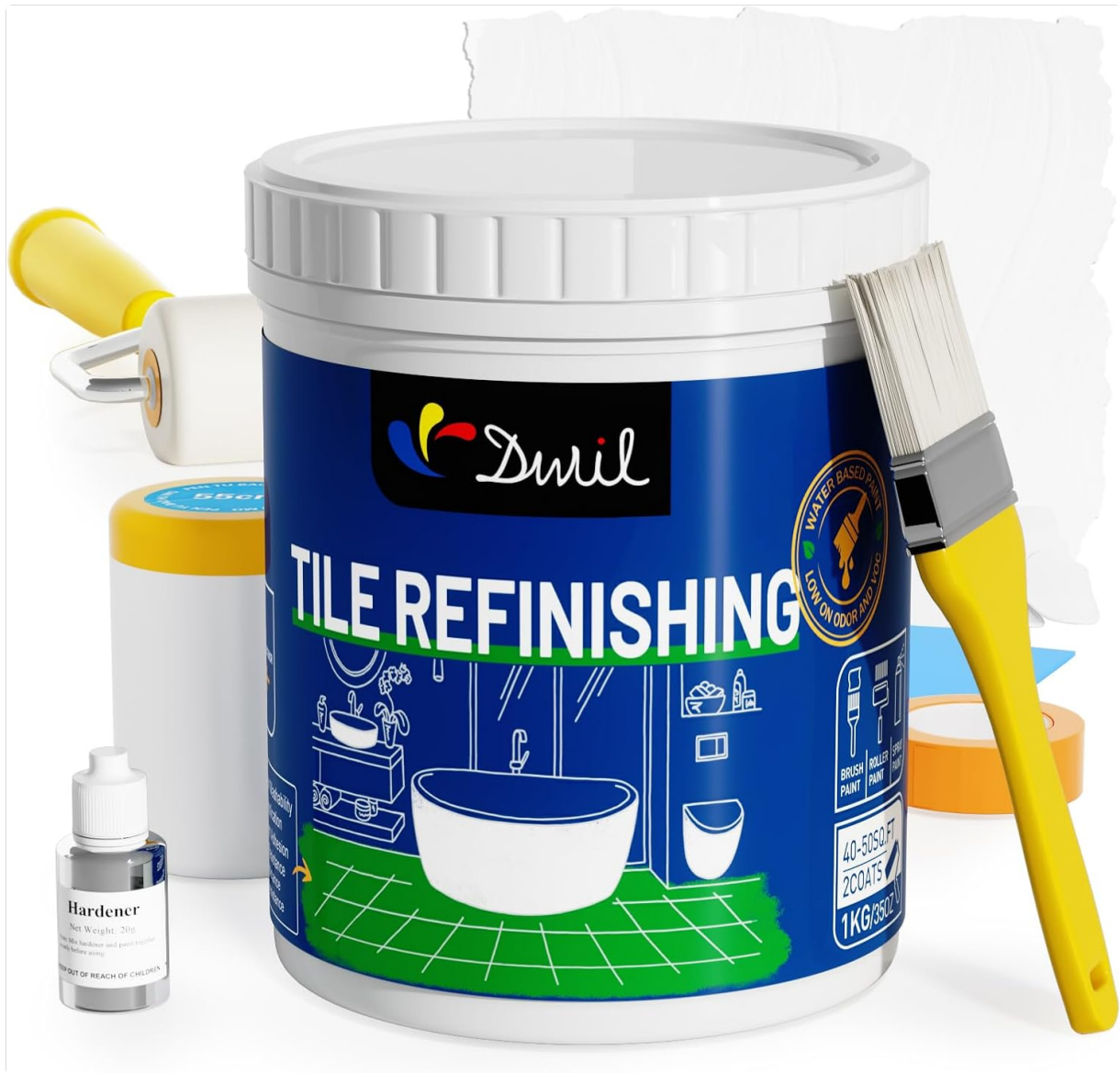
Image: The complete DWIL Tub and Tile Refinishing Kit, showing the paint can, hardener, and various application tools.