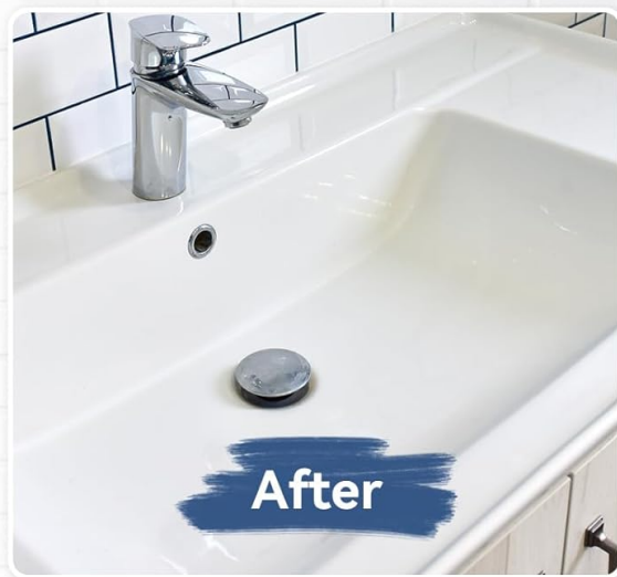
Image: Visual comparison of surfaces before and after refinishing, highlighting the effectiveness of the kit.

Video: A demonstration of the initial steps for refinishing tiles, including cleaning and smoothing the surface.