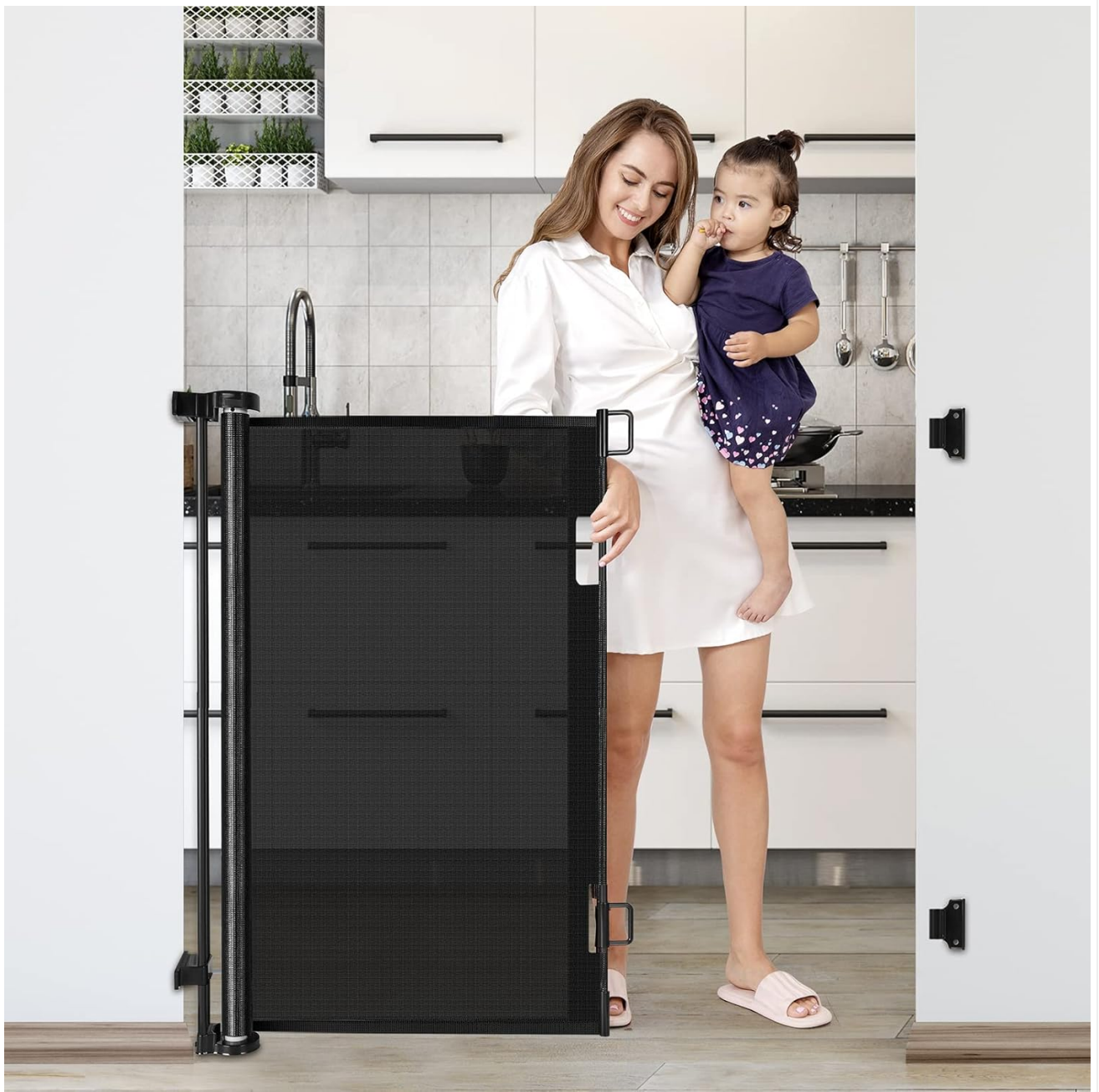
The KISKIZ retractable gate in a kitchen doorway, demonstrating its use as a barrier.