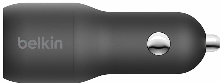
The Belkin BOOSTCHARGE 37W Dual Port Car Charger and the included 3.3ft USB-C to Lightning Cable.