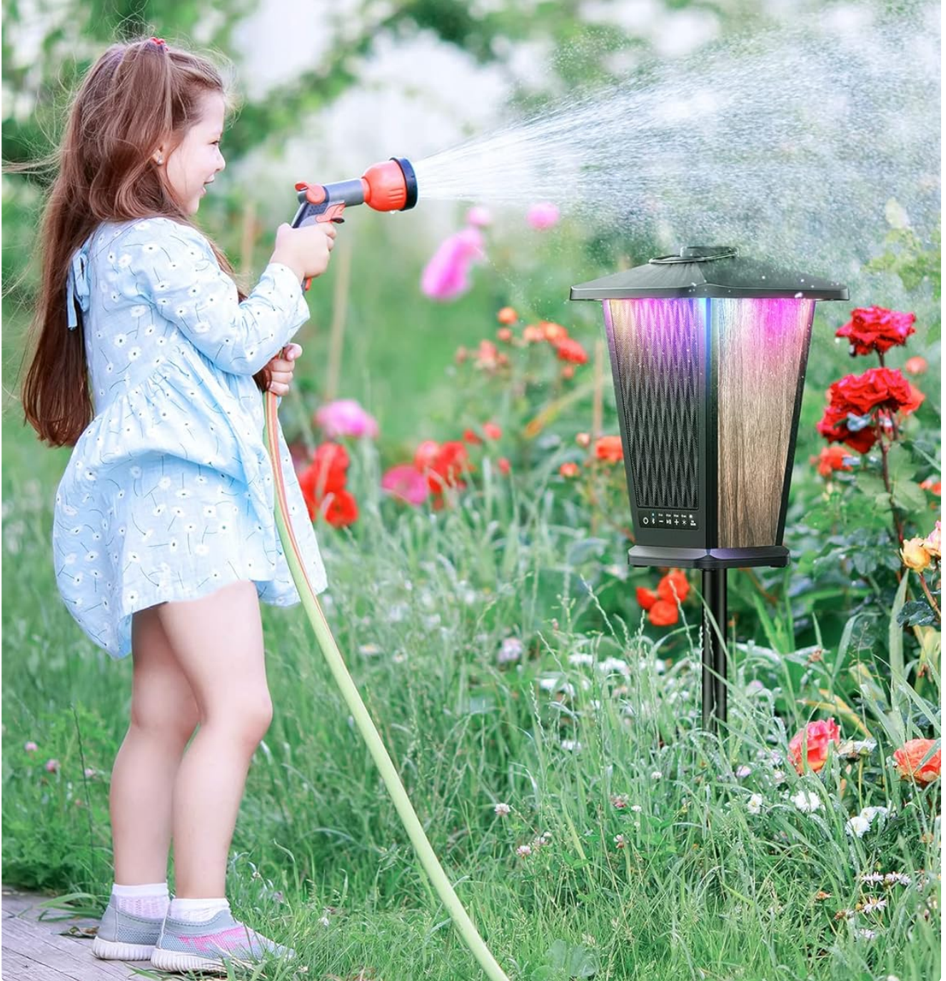
Image: Speaker being exposed to water spray, illustrating its waterproof capability.

Important: Do not immerse the speaker in water or expose it to heavy splashes for extended periods. The IPX5 rating protects against jets, not submersion.