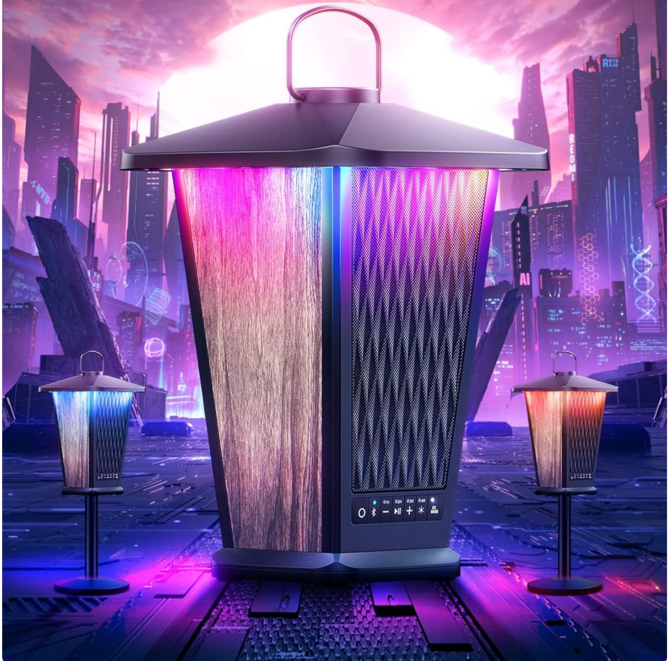
Image: Speakers showcasing various colorful lighting effects.

Add a beat-driven light show or choose from 3 other lighting modes