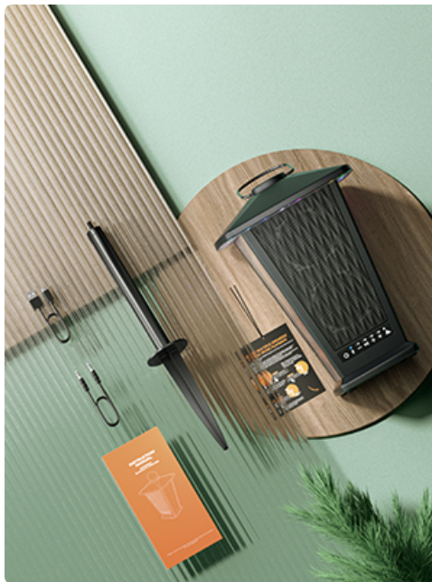
Image: Speaker highlighting the EX BASS button.