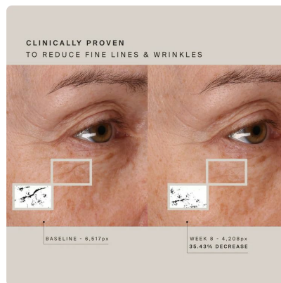
A clinical comparison image showing a reduction in fine lines and wrinkles around the eye area after 8 weeks of use.