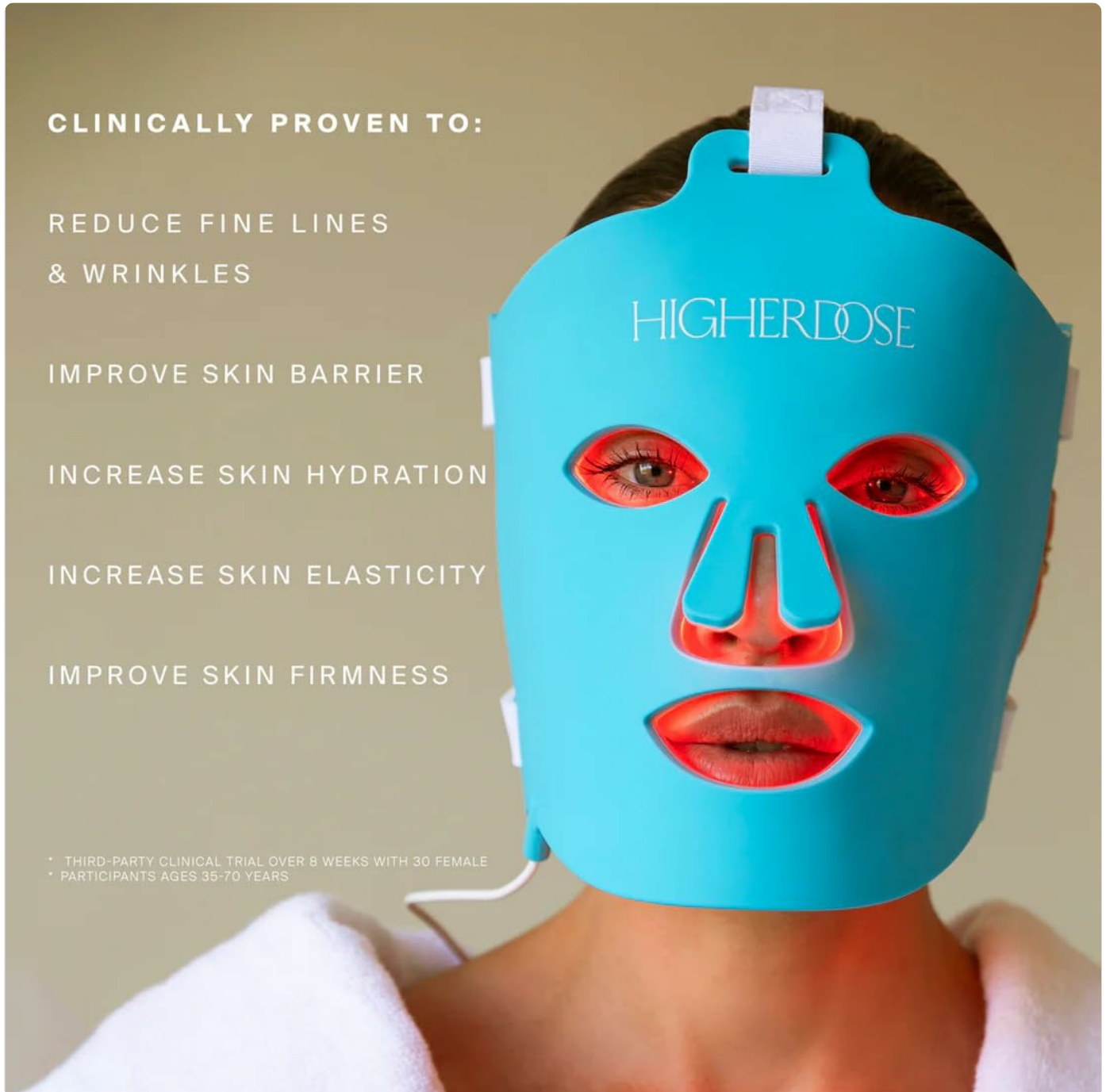
Image: A woman wearing the light blue HigherDOSE Red Light Face Mask, which emits a red glow, demonstrating its use.