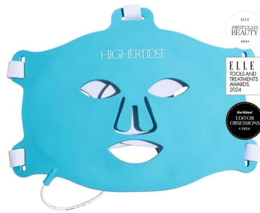
The HigherDOSE Red Light Face Mask displayed with various beauty award badges.