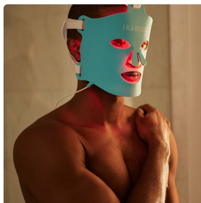
A man wearing the light blue HigherDOSE Red Light Face Mask, emitting a red glow, in a bathroom setting.