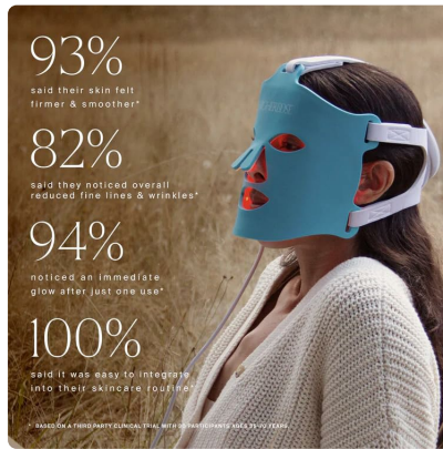
A woman wearing the light blue HigherDOSE Red Light Face Mask, with statistics indicating high user satisfaction regarding skin firmness, reduced fine lines, and ease of integration into skincare routines.