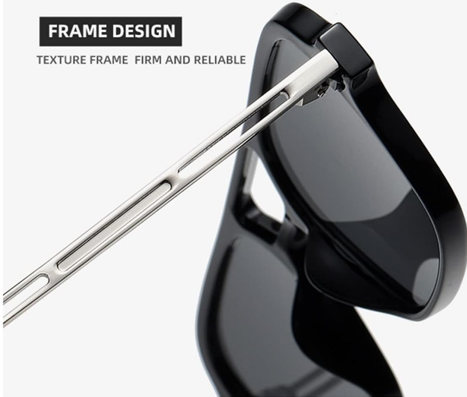
Image 2.1: Detail of the frame design, highlighting its texture and reliability.